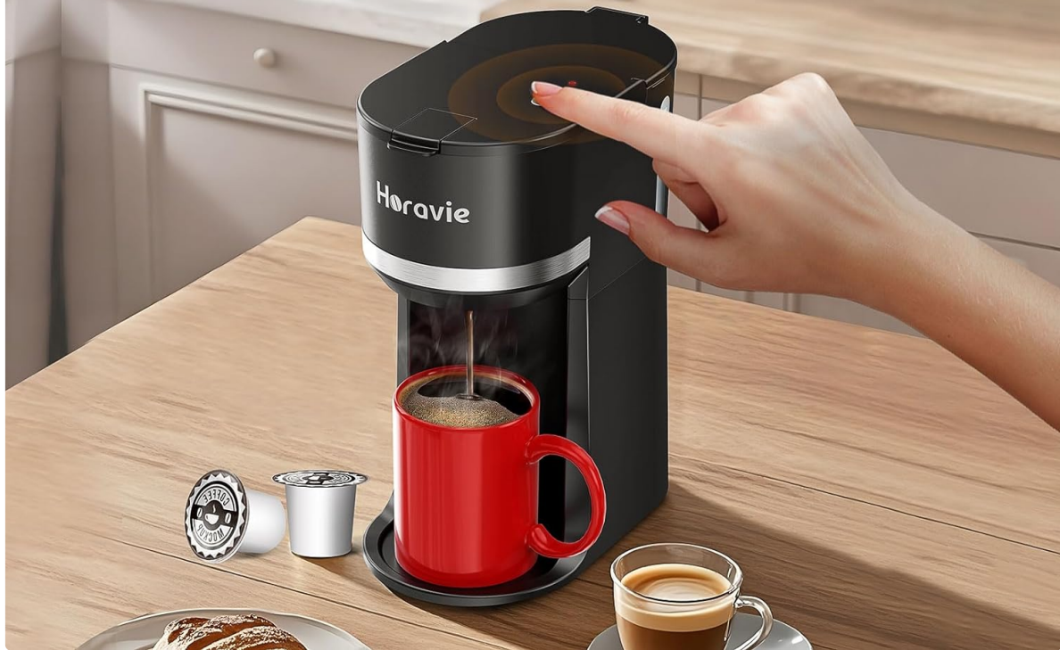
Figure 5: Simple one-button operation and the descaling reminder light for easy maintenance.

When everything is ready, press the power button for 2s to start descaling