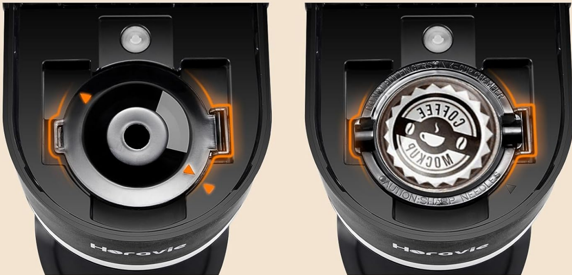
Figure 7: Correct horizontal placement of the K-Pod holder or ground coffee filter for proper lid closure.

After brewing, please do not open the top cover to remove the holder or filter immediately to avoid burns.