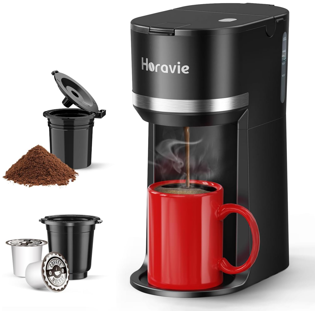
Figure 1: The Horavie Mini Single Serve Coffee Maker, showcasing its versatility with K-cup and ground coffee options.