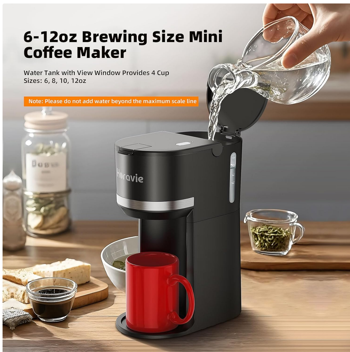
Figure 6: Filling the water tank. Note the clear view window for monitoring water levels and the maximum fill line.

Note: Please do not add water beyond the maximum scale line