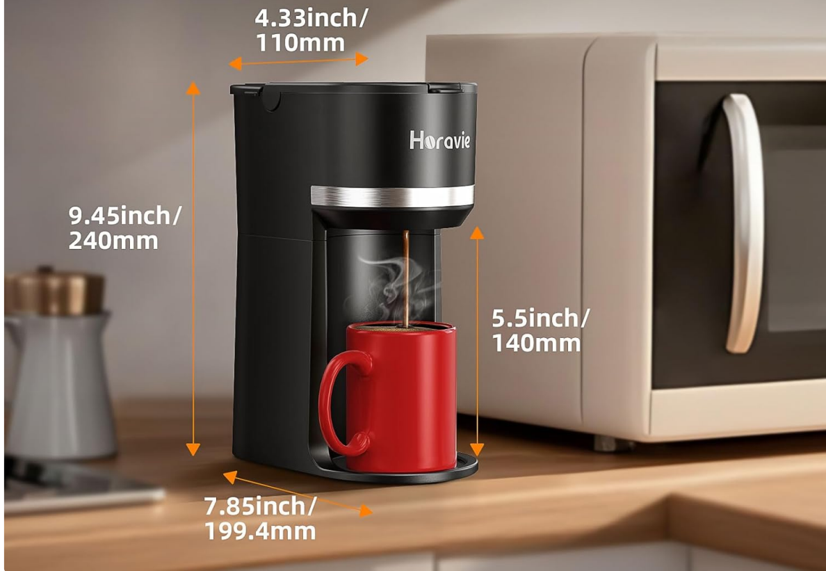
Figure 3: Compact dimensions of the coffee maker, highlighting its space-saving design.

Pure manual measurement, there may be errors, the size is for reference only please prevail in kind!