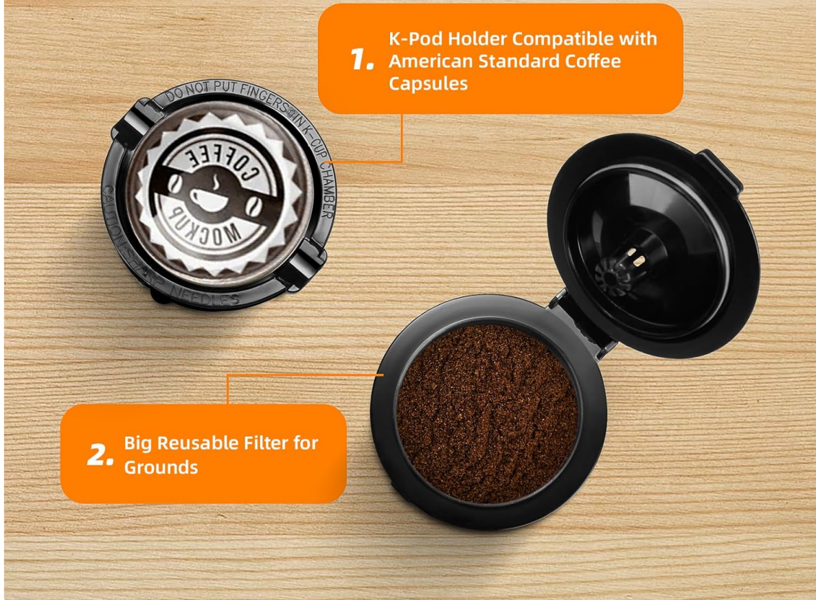
Figure 2: The 2-in-1 brewing system, featuring both a K-Pod holder and a reusable filter for ground coffee.