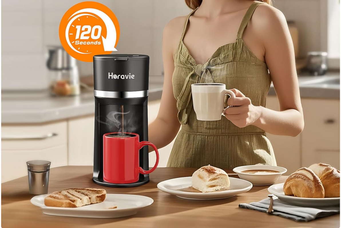
Figure 4: High-temperature fast brewing, delivering hot coffee in 120 seconds.