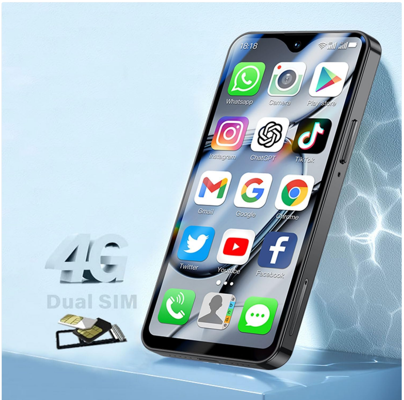
Figure 3.1: Illustration of dual SIM card installation.