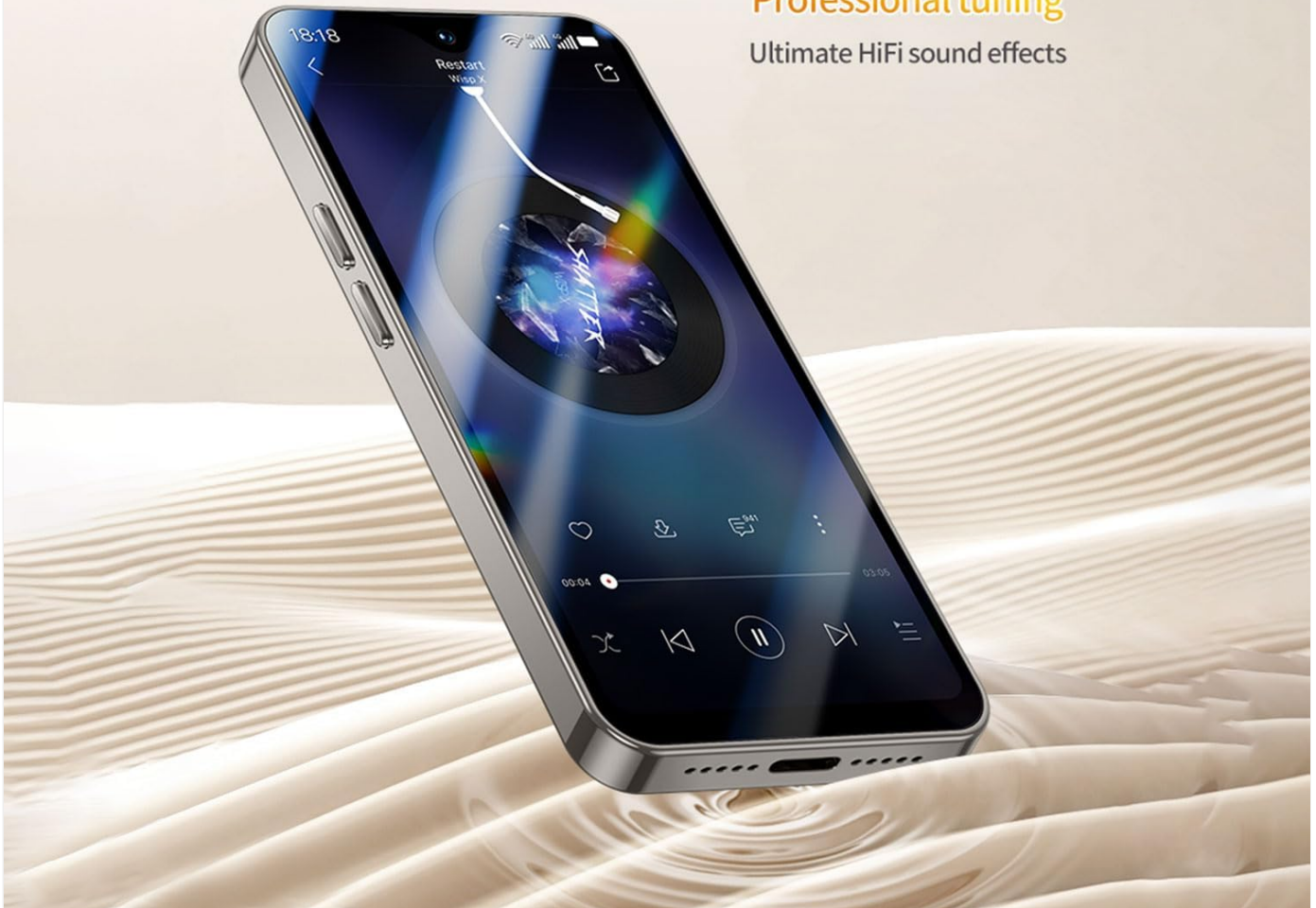
Figure 4.4: The smartphone's surround sound stereo speaker, offering Hi-Fi quality audio.