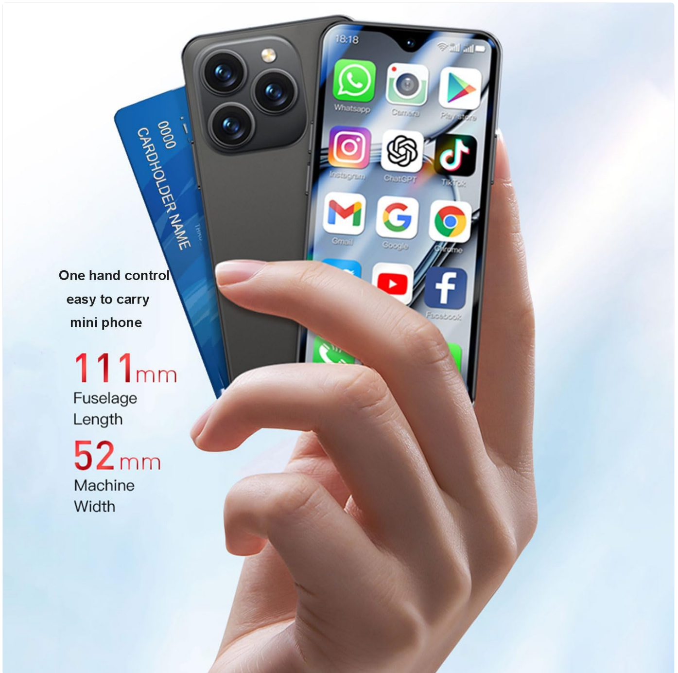
Figure 2.1: Front and back view of the Hipipooo XS18Pro MAX Mini Smartphone.