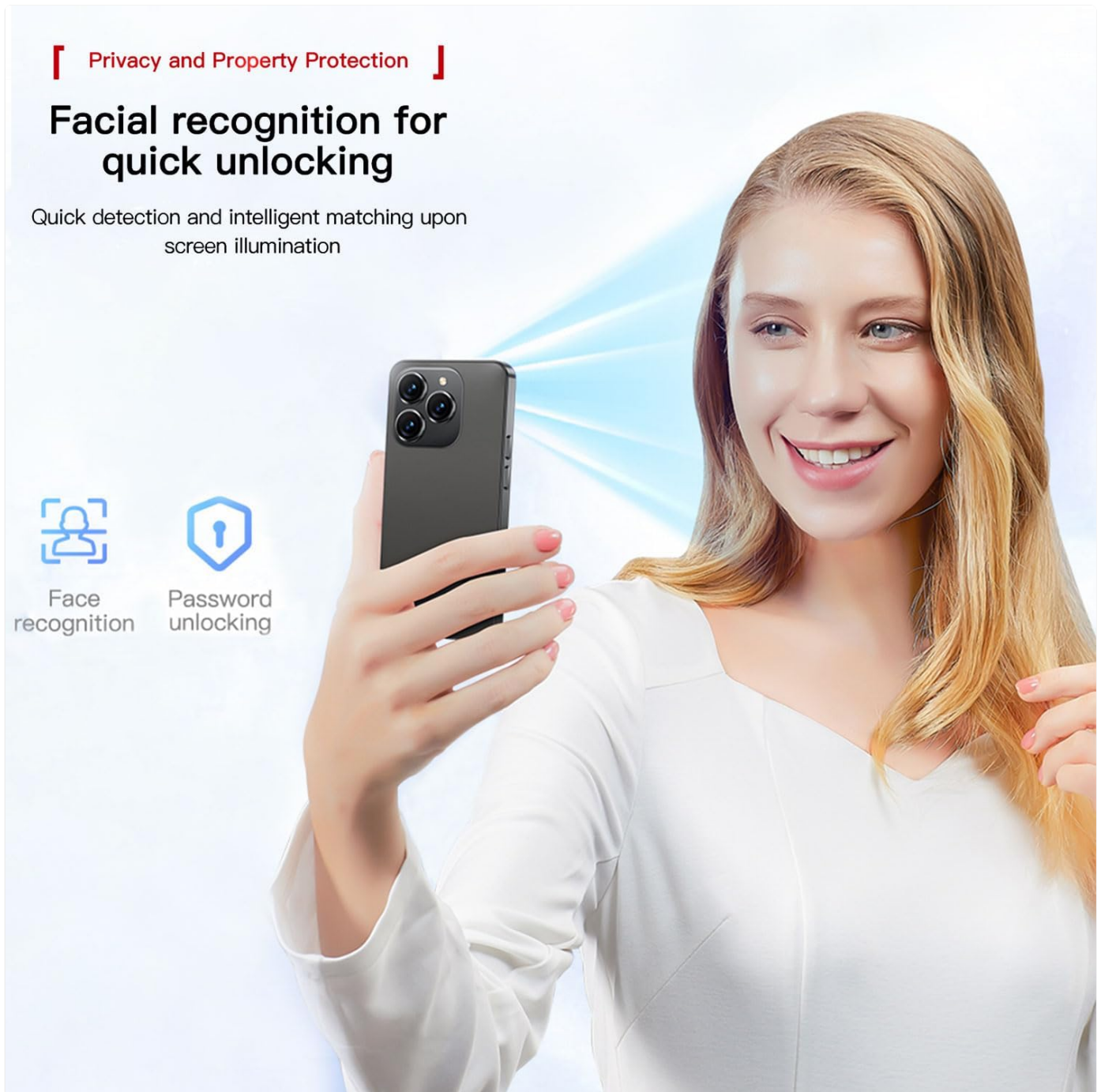
Figure 4.2: Demonstrating the facial recognition feature for quick unlocking.