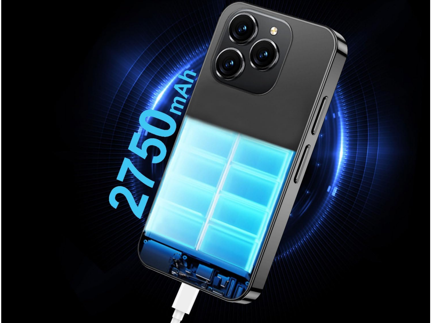
Figure 3.2: The smartphone connected to a charger, illustrating the 2750mAh battery capacity.

With a high capacity 2750mAh battery and our own battery saving technology, can confidently last a full day of medium-to -heavy use without charging,