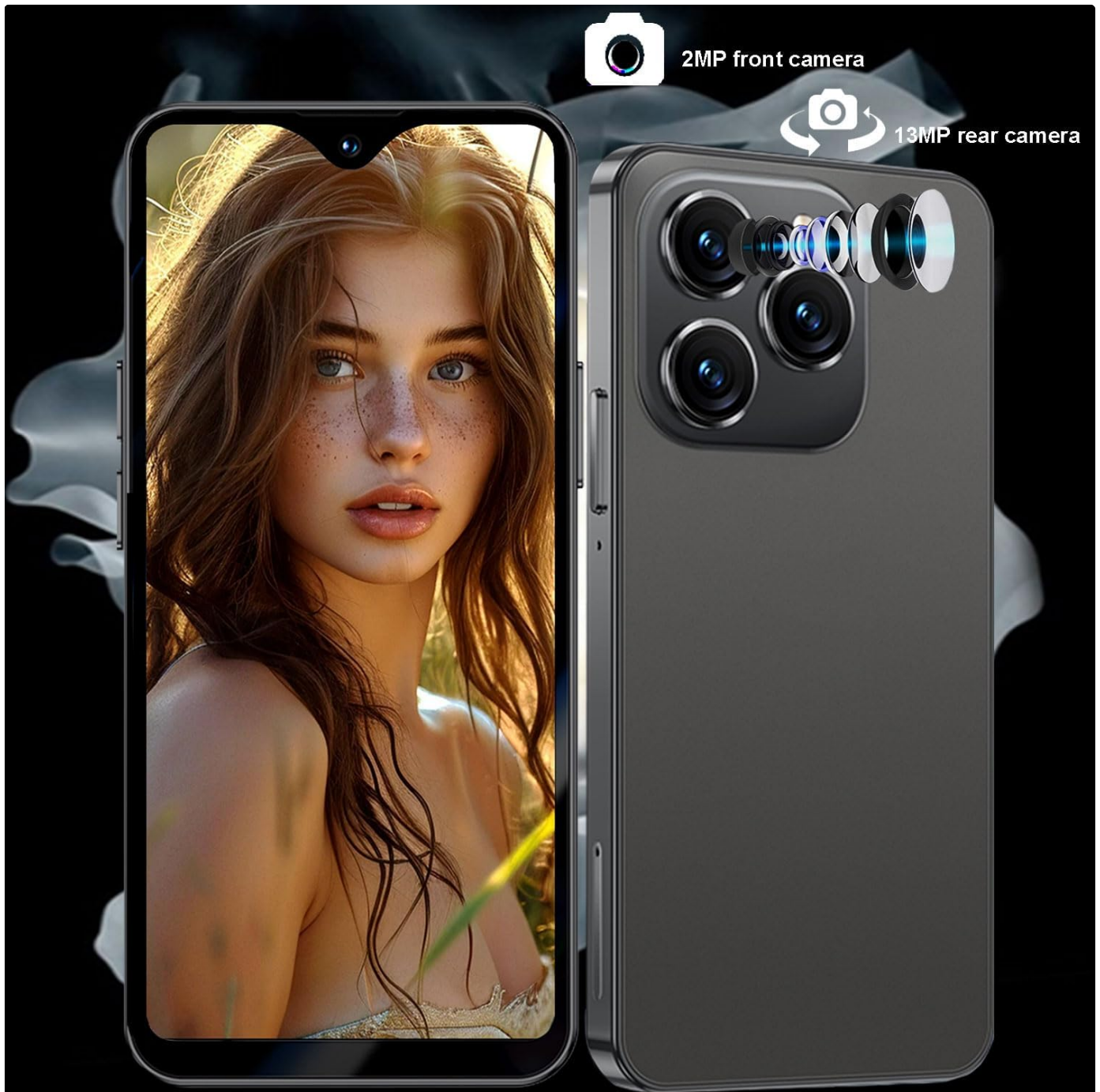
Figure 4.1: Overview of the smartphone's 2MP front camera and 13MP rear camera system.