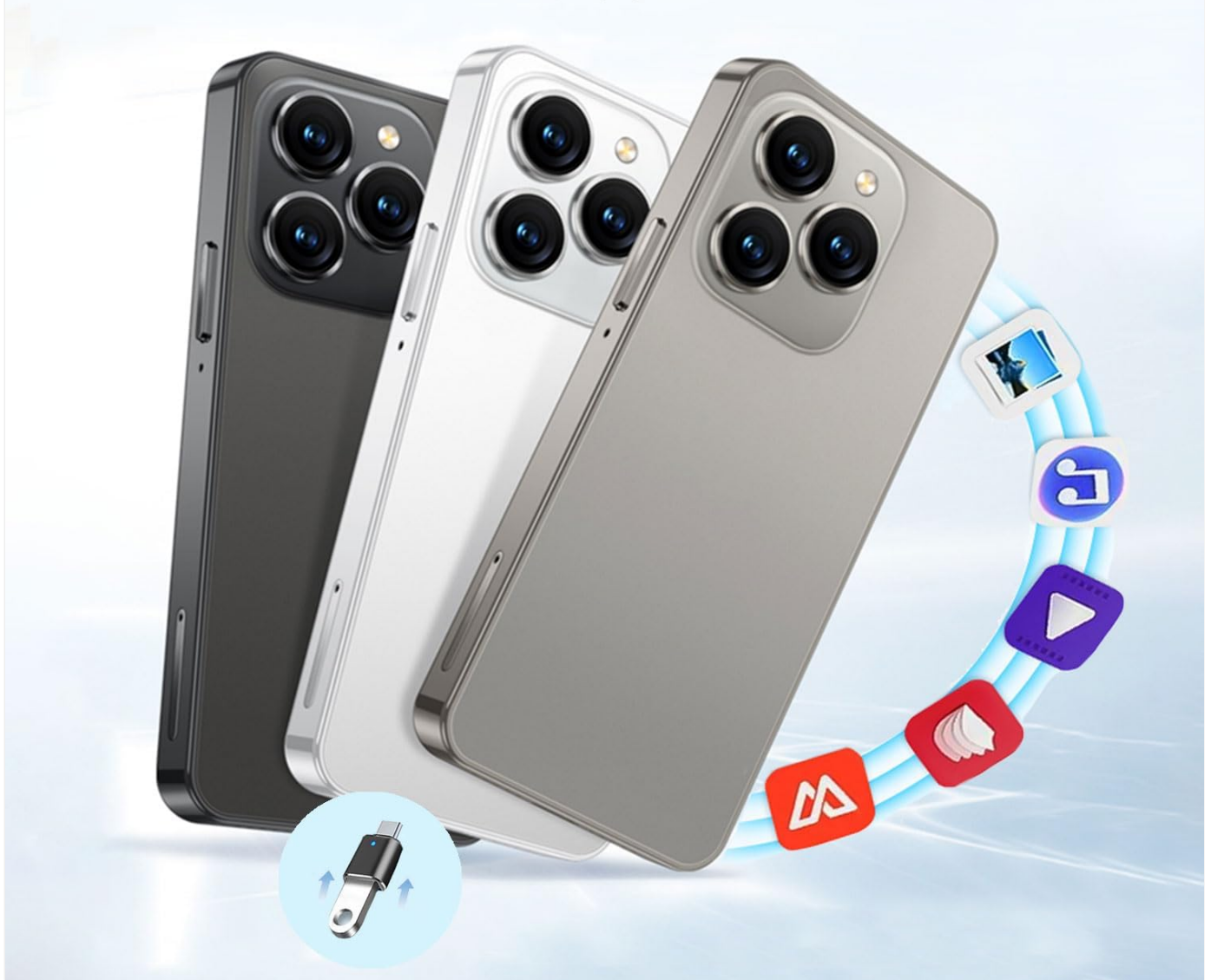
Figure 4.3: The OTG data transmission feature, allowing convenient data exchange and storage.

No traffic required, movies and documents can be read anytime