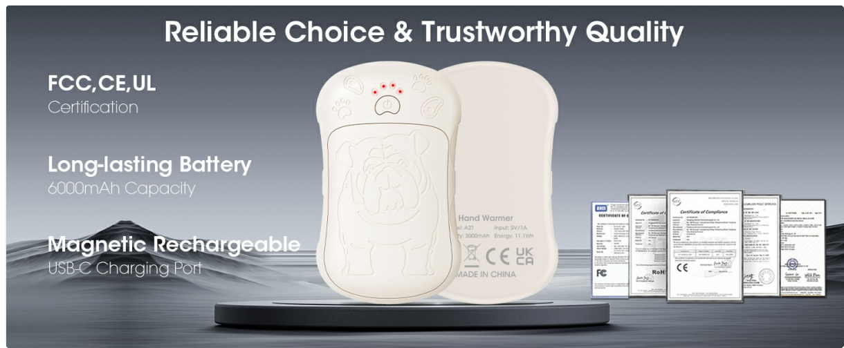
Image: The OLV Hand Warmers with their USB-C charging cable, highlighting the charging ports and product certifications.