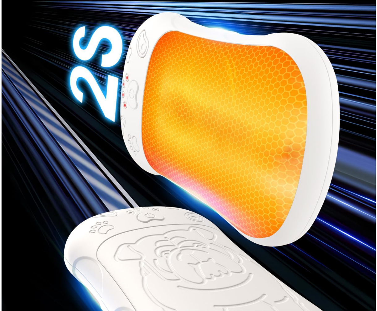
Image: The OLV Hand Warmer demonstrating its rapid 2-second heat-up capability.