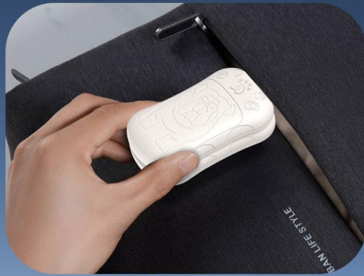
Image: The OLV Hand Warmer being held and placed into a pocket, emphasizing its compact and lightweight design.