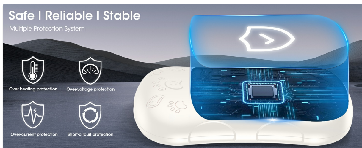
Image: A graphic detailing the comprehensive multiple protection system, including safeguards against overheating, over-voltage, over-current, and short-circuits.