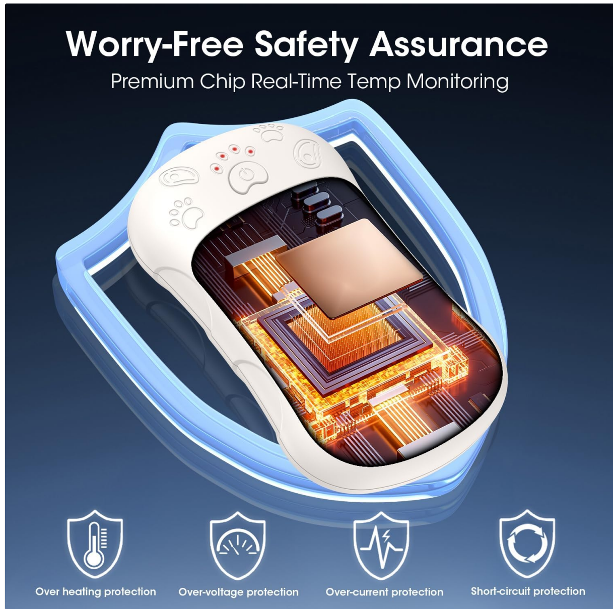
Image: An X-ray view of the OLV Hand Warmer, highlighting its internal safety assurance chip and protection mechanisms.

The OLV Hand Warmers are built with premium AI intelligent chipsets and high-tech aviation-grade aluminum and ABS materials, ensuring multiple protection technologies to prevent overheating, over-voltage, over-current, and short circuits. They are flame-proof, explosion-proof, and emit no radiation.