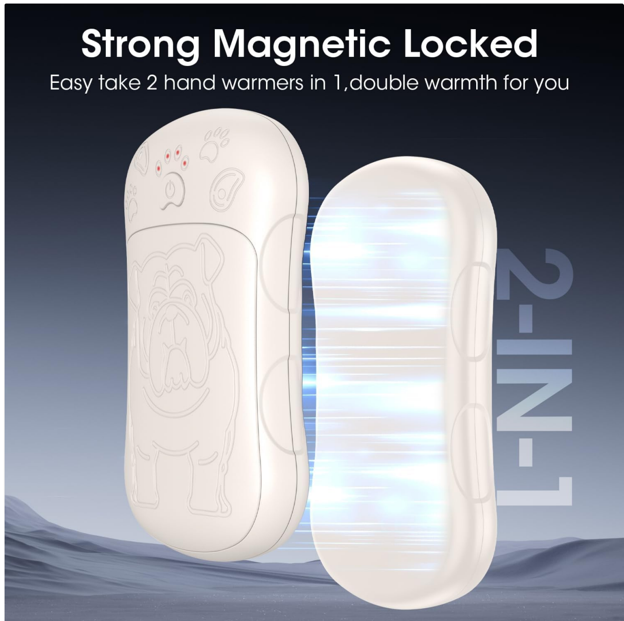
Image: The two OLV Hand Warmers magnetically connected, illustrating their 2-in-1 functionality.