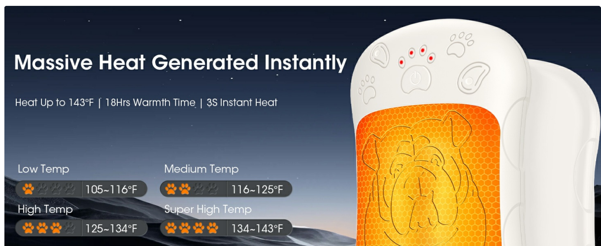
Image: A diagram illustrating the four distinct heat levels, their corresponding temperature ranges, and how they are indicated by the paw print lights.

Heat Up to 143°F | 18Hrs Warmth Time | 3S Instant Heat