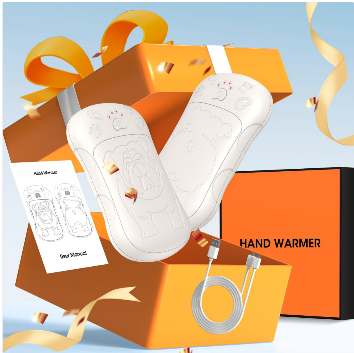
Image: The OLV Hand Warmers, charging cable, and user manual as included in the product packaging.