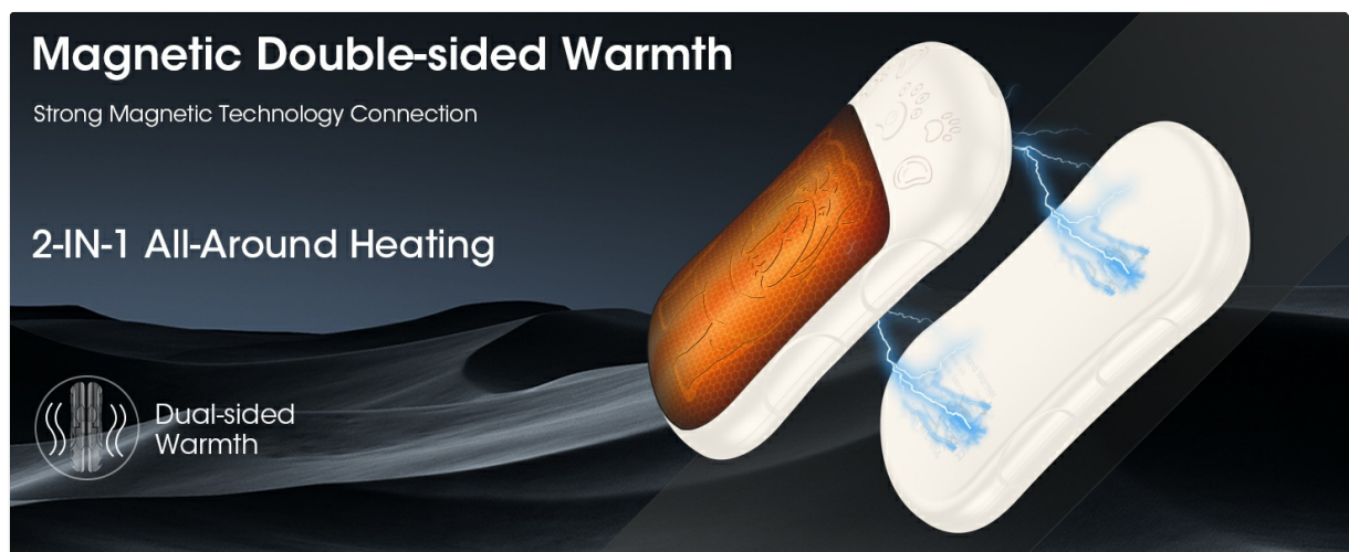
Image: A graphic depicting the magnetic double-sided warmth, showing the two units attracting to form a single warmer.