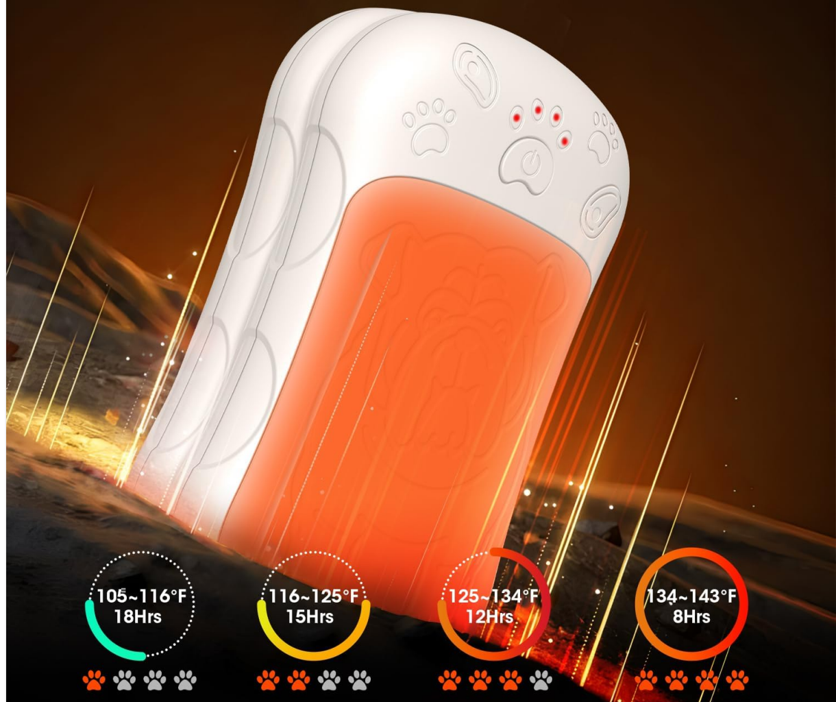
Image: Visual representation of the four double-sided heating levels and their approximate durations.

18 Hours Long-lasting 6000mAh Battery Capacity