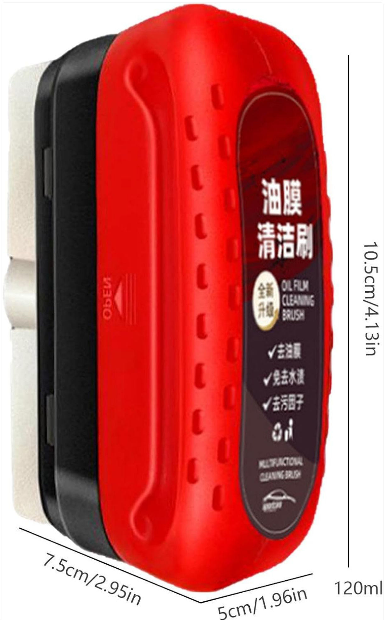
Image 8.1: Dimensions of the cleaning brush applicator, showing approximate measurements of 10.5cm (4.13in) length, 7.5cm (2.95in) width, and 5cm (1.96in) height.