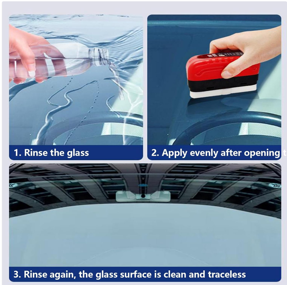
Image 4.1: Illustration of rinsing the glass surface with water as the first step.