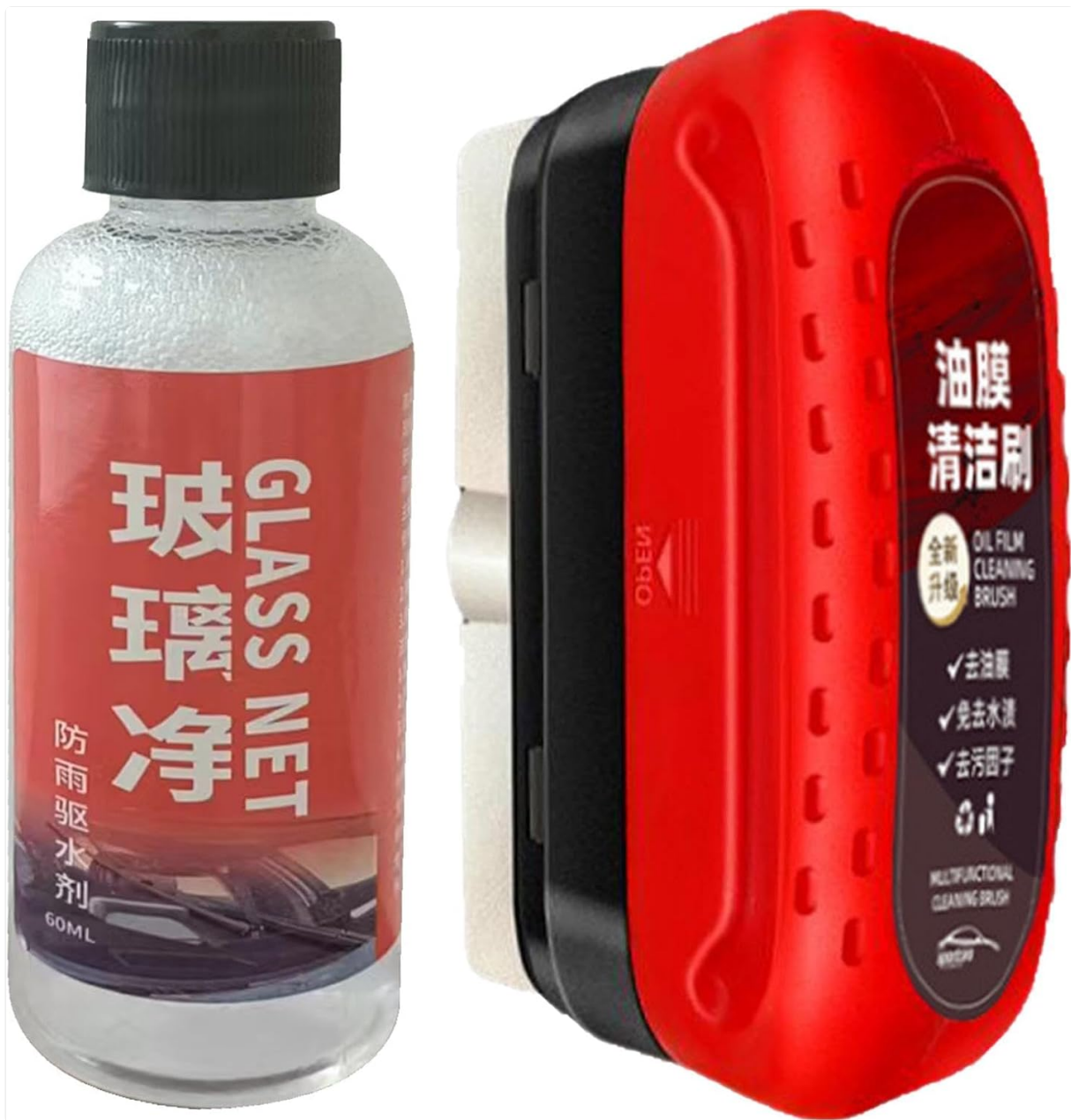
Image 1.1: The WOGXN Glass Oil Film Cleaner and Brush Kit, showing the cleaner bottle and the integrated brush applicator.