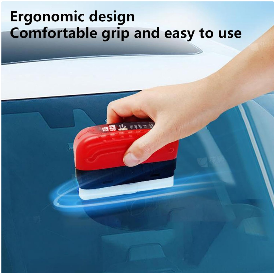
Image 5.2: Shows the ergonomic design of the brush and its comfortable grip during application on a car windshield.