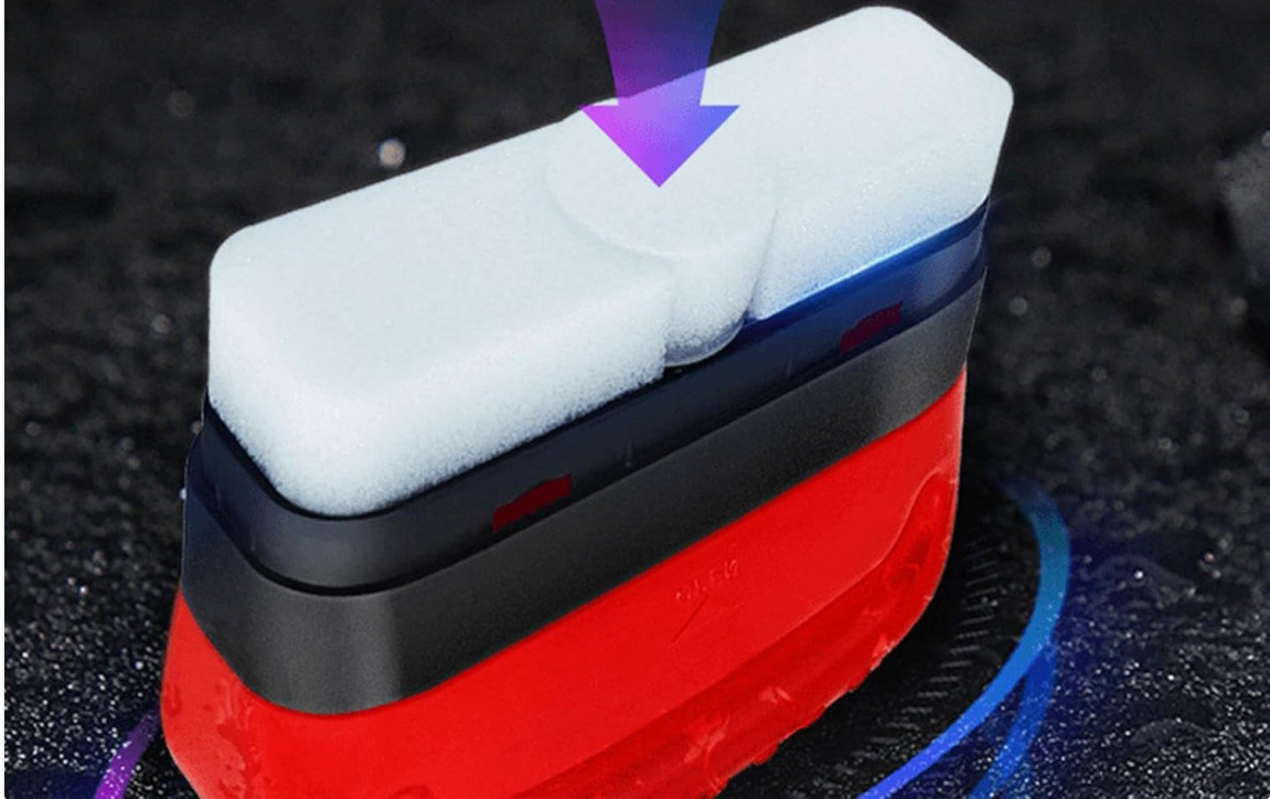
Image 5.1: Demonstrates opening the lid of the applicator for product dispensing.

Open the lid and apply it with one click Stubborn oil film can be removed with one wipe Labor-saving design