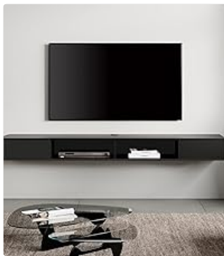
Figure 6: Waterproof surface for easy cleaning.