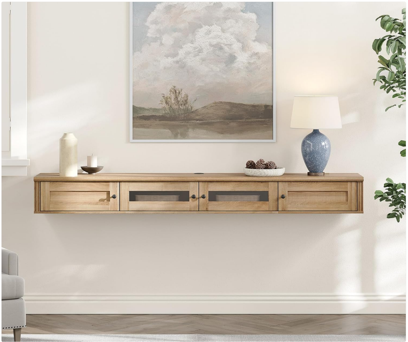
Figure 1: Assembled WAMPAT Floating TV Stand in Oak finish.