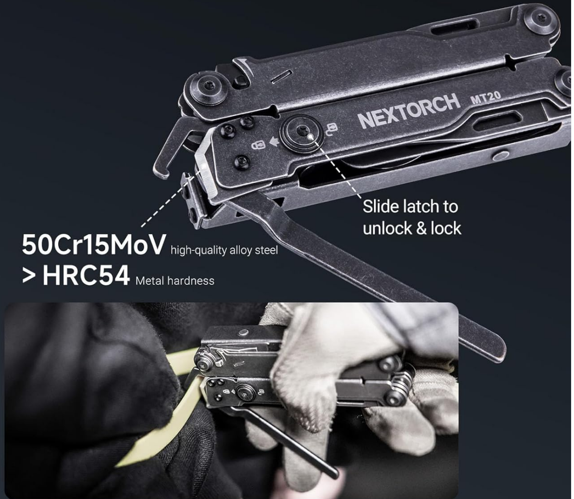
Figure 9: Using the integrated wire cutters.

The single-edge blade design and ergonomic right-angle blade cut cable ties quickly and easily.