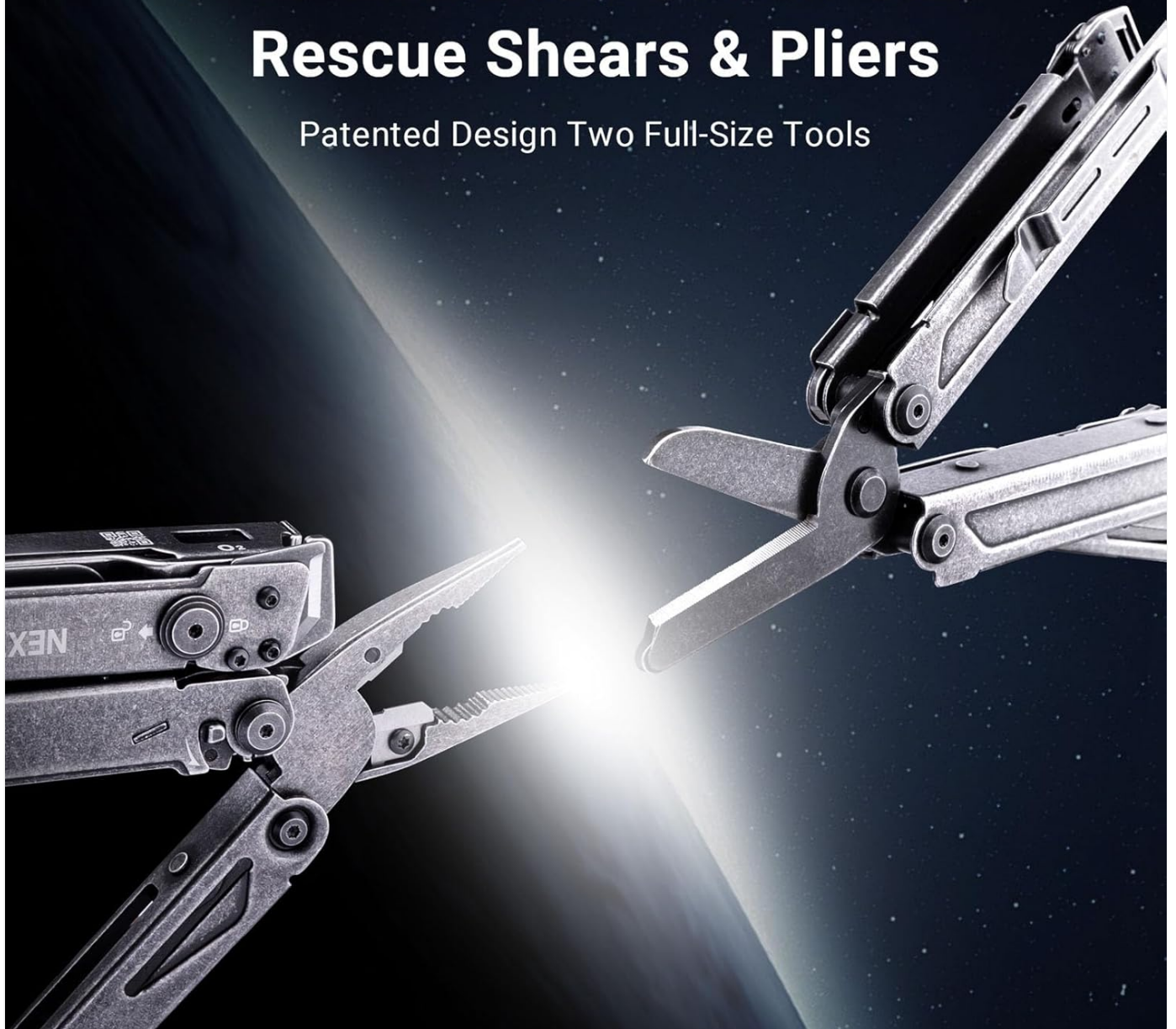
Figure 3: Detailed view of the full-size rescue shears and pliers.