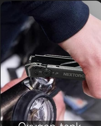
Oxygen tank wrench