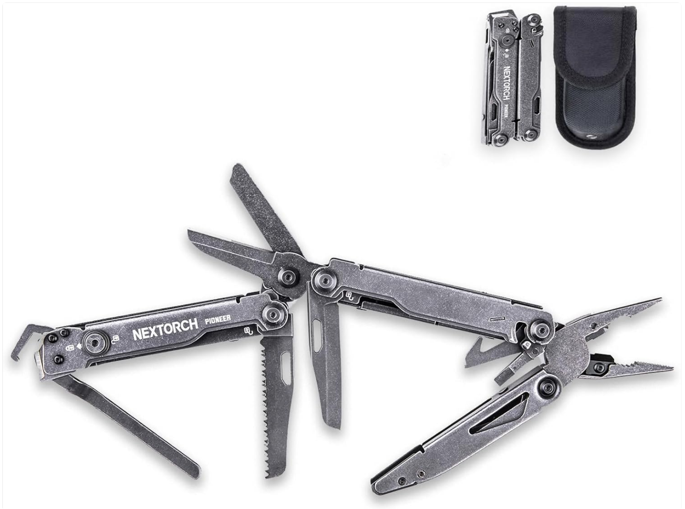
Figure 7: The multi-tool in its unfolded state, ready for use.