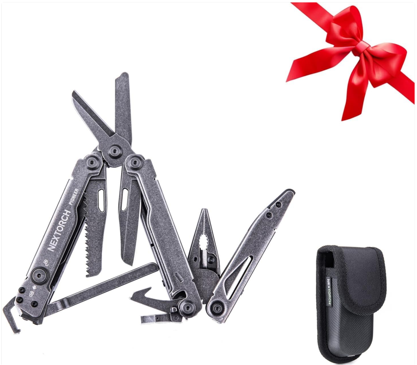
Figure 1: The PIONEER 14-IN-1 Multi-tool and its included nylon sheath.