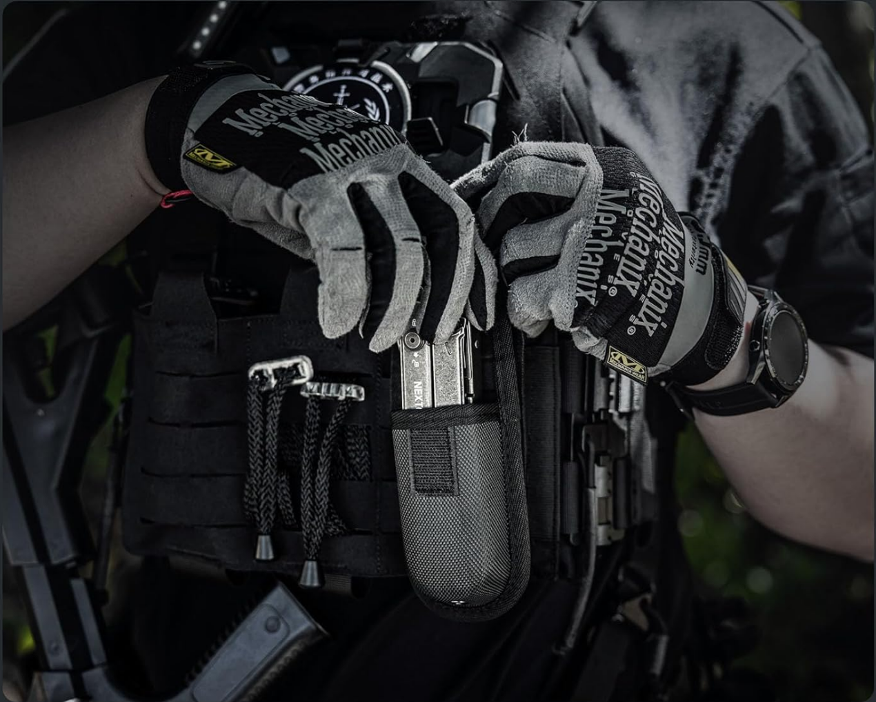
Figure 8: The compact design allows for easy pocket carry.

The Pioneer nylon sheath can be carried on a tactical backpack, belt, or any other MOLLE panel.