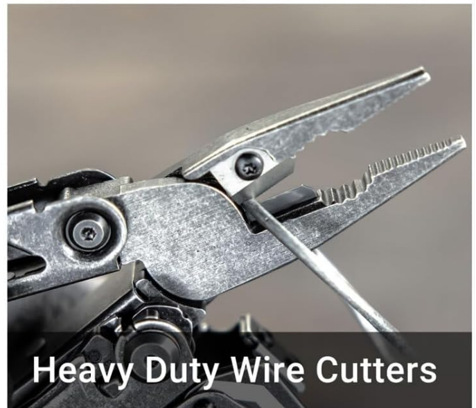
Figure 5: Demonstrating the use of the needlenose pliers.