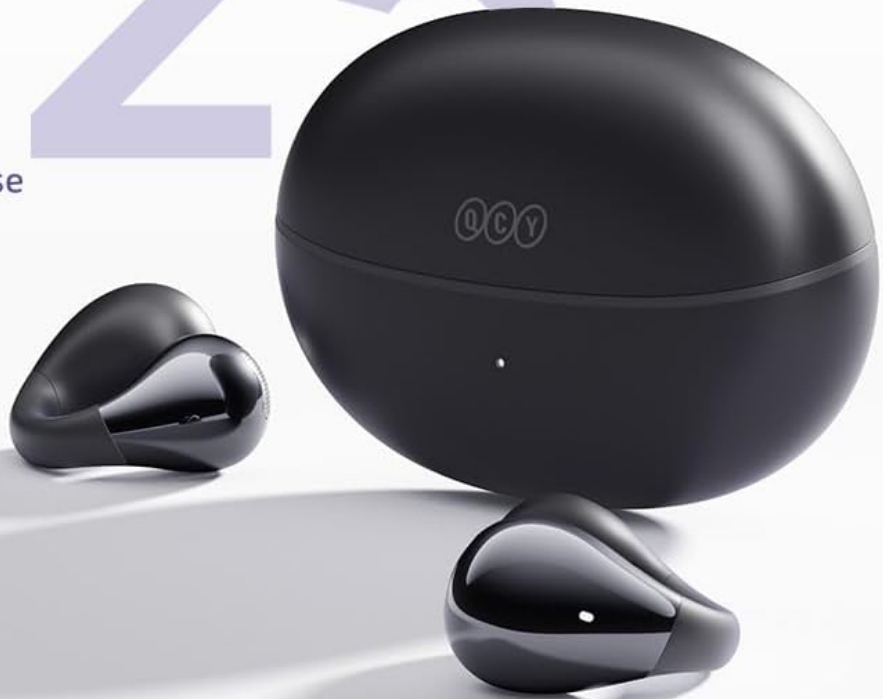
Image: A visual representation of the QCY Crossky C30's battery life, indicating up to 5.5 hours on a single charge and up to 25 hours with the charging case.