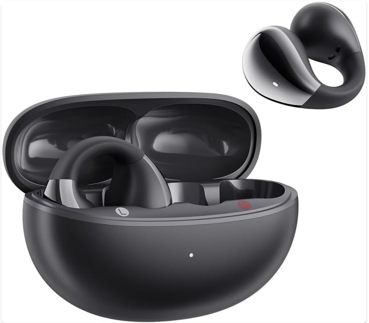
Image: The QCY Crossky C30 open-ear headphones, with one earbud placed in its charging case and another earbud shown separately, highlighting its unique design.