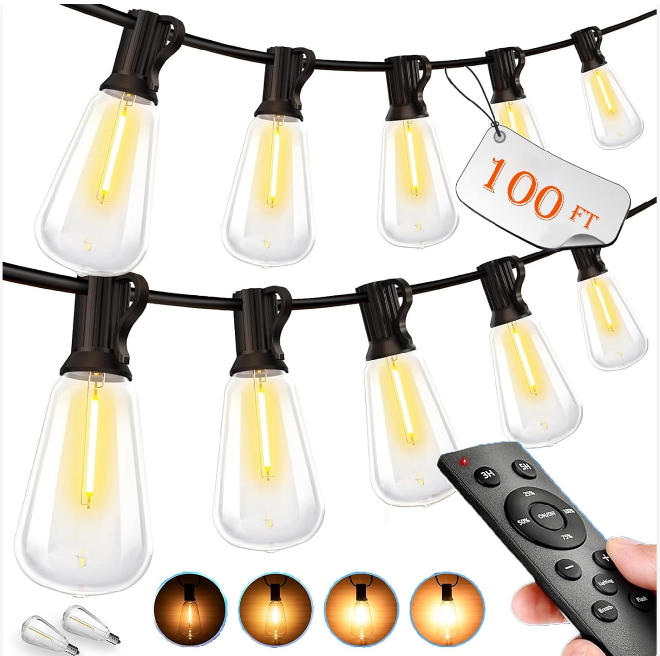
Image: MGVIH 100Ft Outdoor String LED Patio Lights with remote control and dimming options, showcasing the bulbs and the remote.