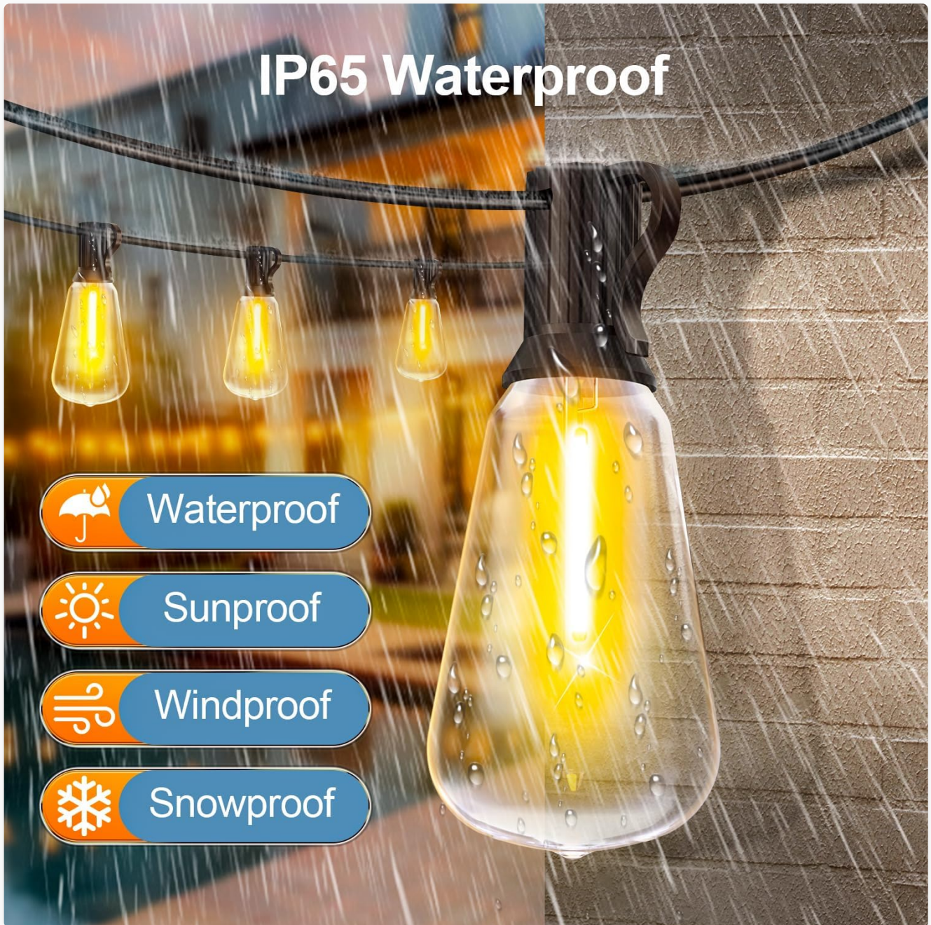
Image: Close-up of an MGVIH ST38 bulb with icons indicating waterproof, sunproof, windproof, and snowproof features, highlighting its weather resistance.