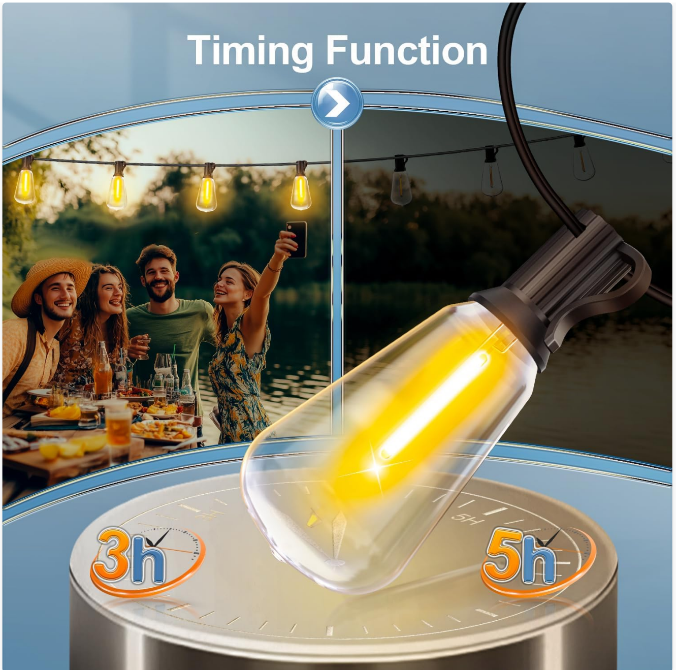
Image: Graphic illustrating the 3-hour and 5-hour timing functions for the string lights.