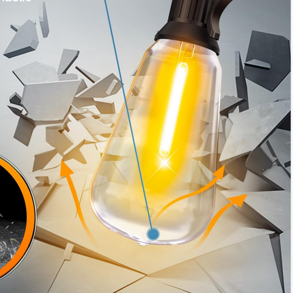
Image: Diagram illustrating the shatterproof nature of MGVIH PET plastic bulbs compared to fragile glass bulbs, emphasizing durability.