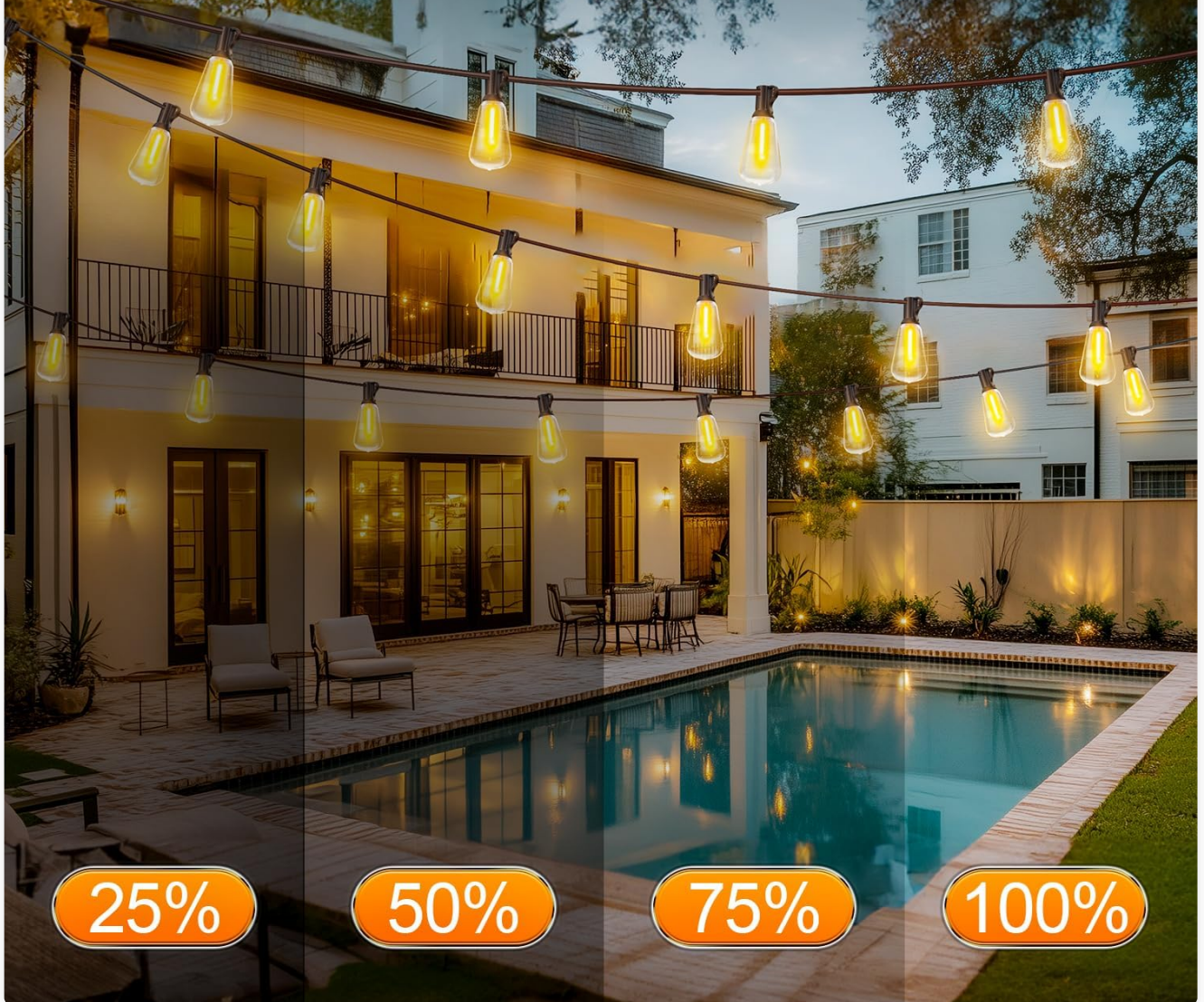
Image: Outdoor patio scene with string lights demonstrating different brightness levels: 25%, 50%, 75%, and 100% illumination.