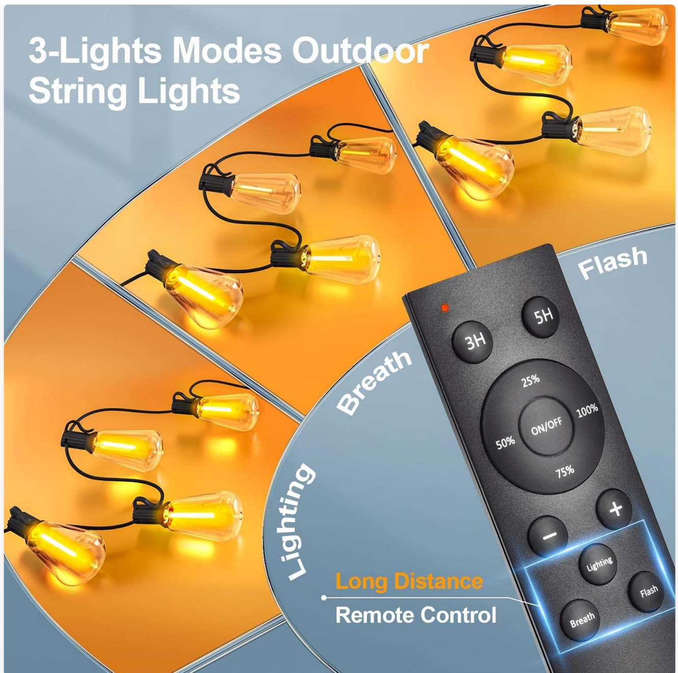
Image: Remote control displaying buttons for 3 lighting modes: Lighting, Breath, and Flash.