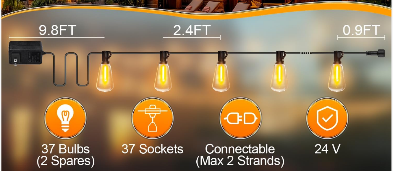
Image: Diagram showing the layout of the 100Ft string lights, including the power adapter, 37 bulbs, 37 sockets, and indicating connectability for up to 2 strands.