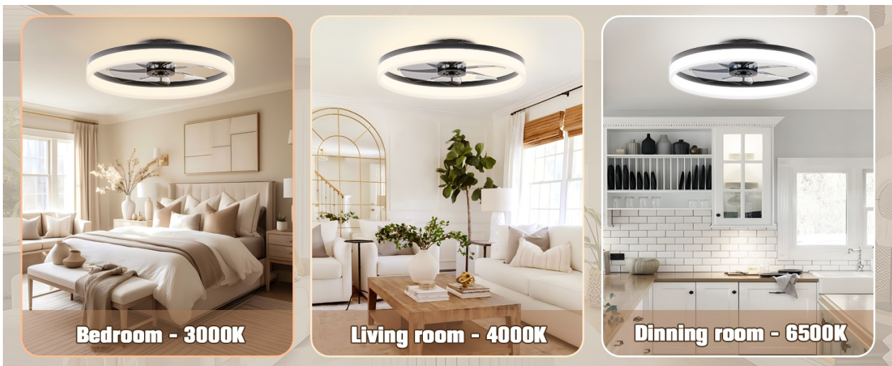
Image: Visual representation of the color temperature options (3000K Warm White, 4000K Cool White, 6500K Clear White) and smooth dimming capability of the fan light.