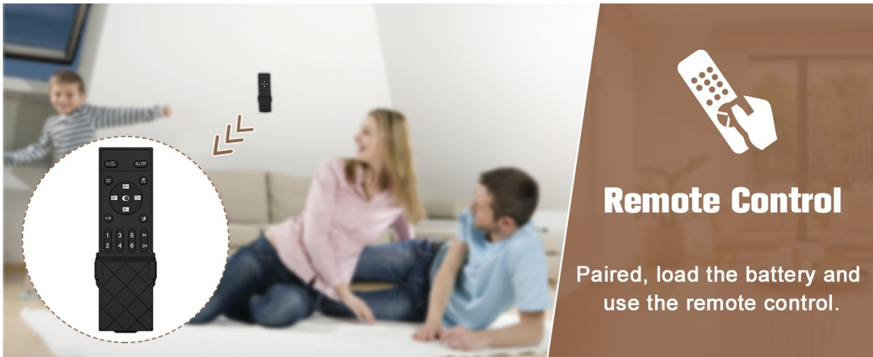
Image: The remote control for the VOLISUN ceiling fan, showing buttons for power, fan speed, light brightness, color temperature, and timer functions.