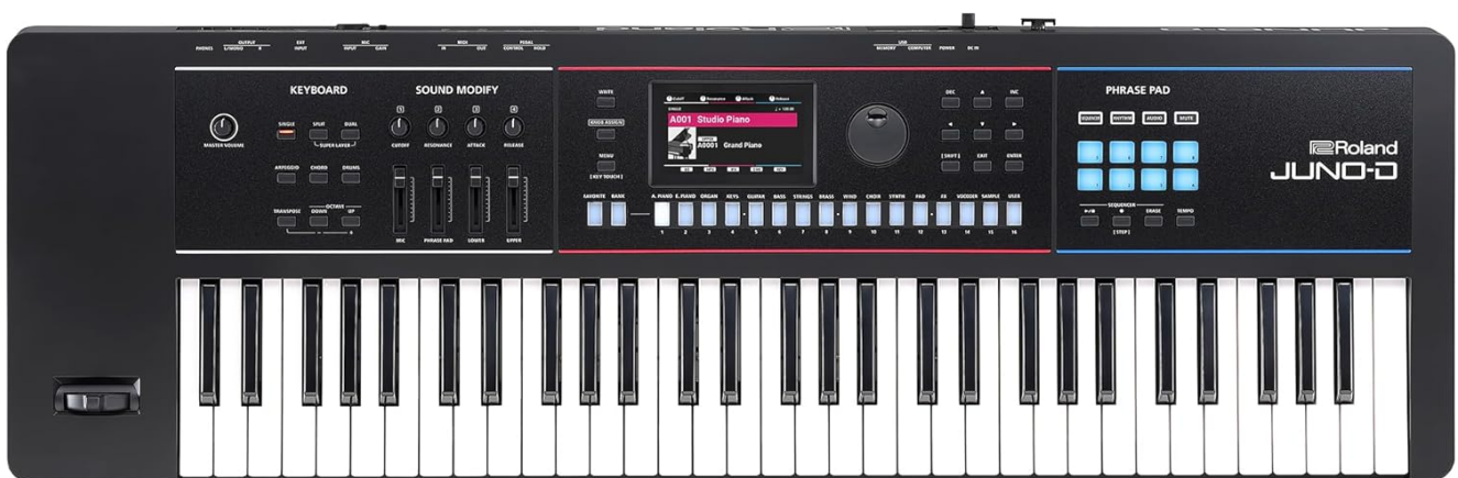
Figure 1: Front view of the Roland JUNO-D6 Synthesizer.