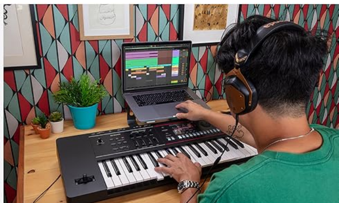
Figure 5: Easily select and play various instrument sounds.

The JUNO-D's USB-C audio/MIDI interface enables driverless connection to mobile devices, and computers supporting seamless music creation, performance, and high-quality audio for livestreams and videos.