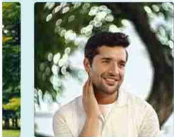
ZEISS Biotar Style Portrait

Dynamic Ambience Portraits with 7-Zeiss Style Portrait