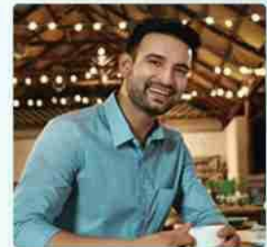
ZEISS Distagon Style Portrait