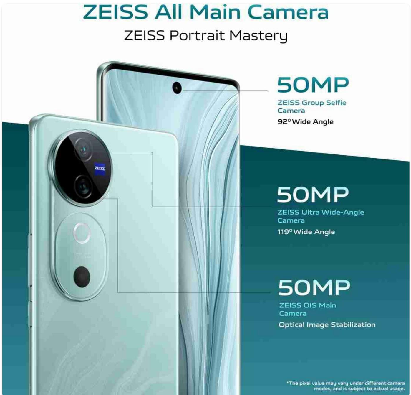
Image: Detailed breakdown of the Vivo V40 5G's ZEISS camera system, including the 50MP ZEISS Group Selfie Camera, 50MP ZEISS