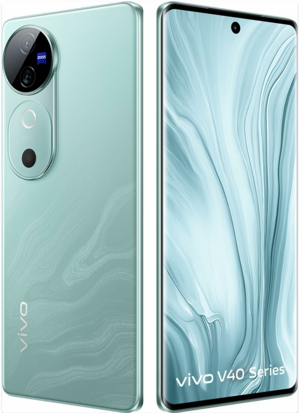
Image: Angled view of the Vivo V40 5G Smartphone, highlighting its slim profile and curved display.