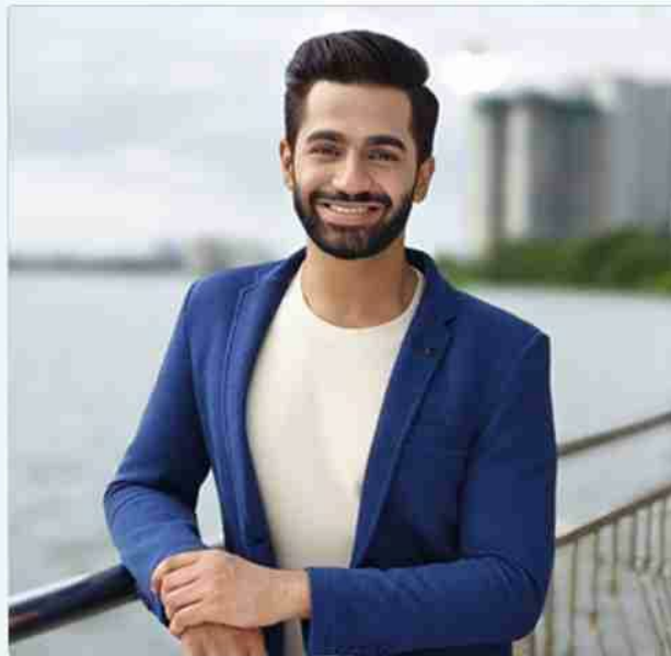
ZEISS Sonnar Style Portrait