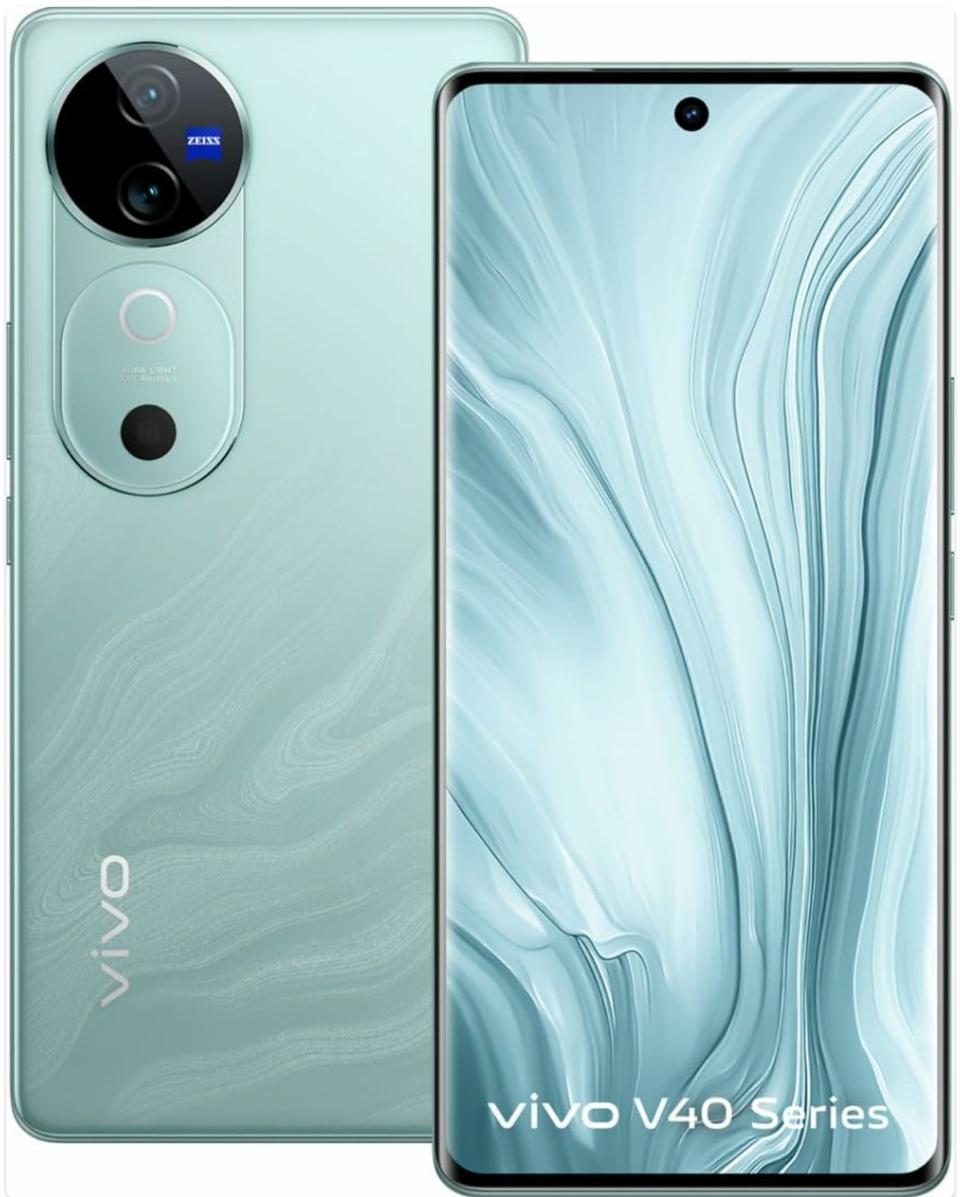
Image: Front and back view of the Vivo V40 5G Smartphone in Ganges Blue. The front displays a vibrant screen, and the back shows the camera module and Vivo branding.