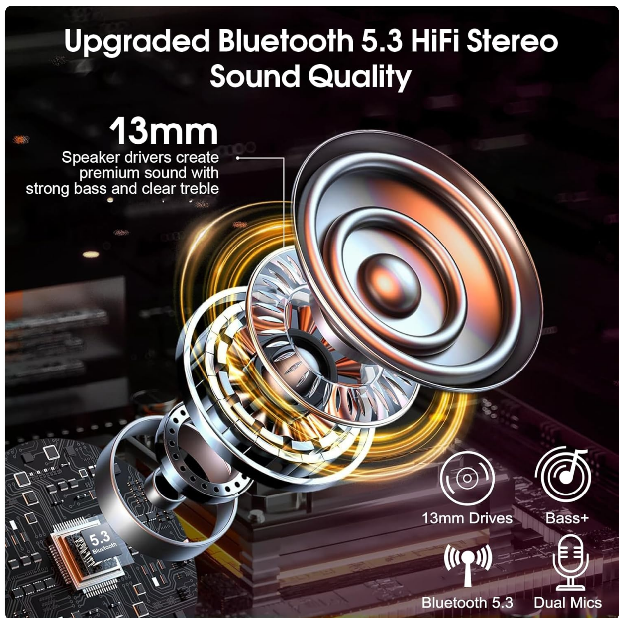
Image: Dual ENC Noise Cancelling Mics