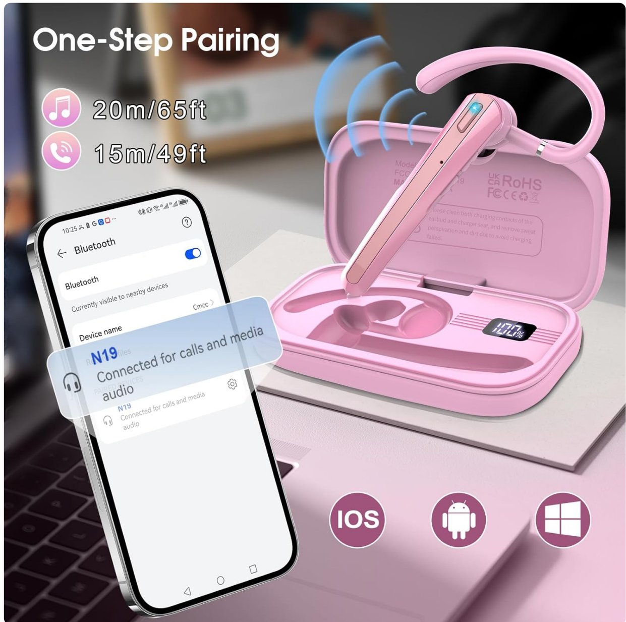
Image: Adjustable ear hook for comfort

construction and soft silicone ear tips (available in S, M, L sizes) to ensure effective sound isolation and comfort.