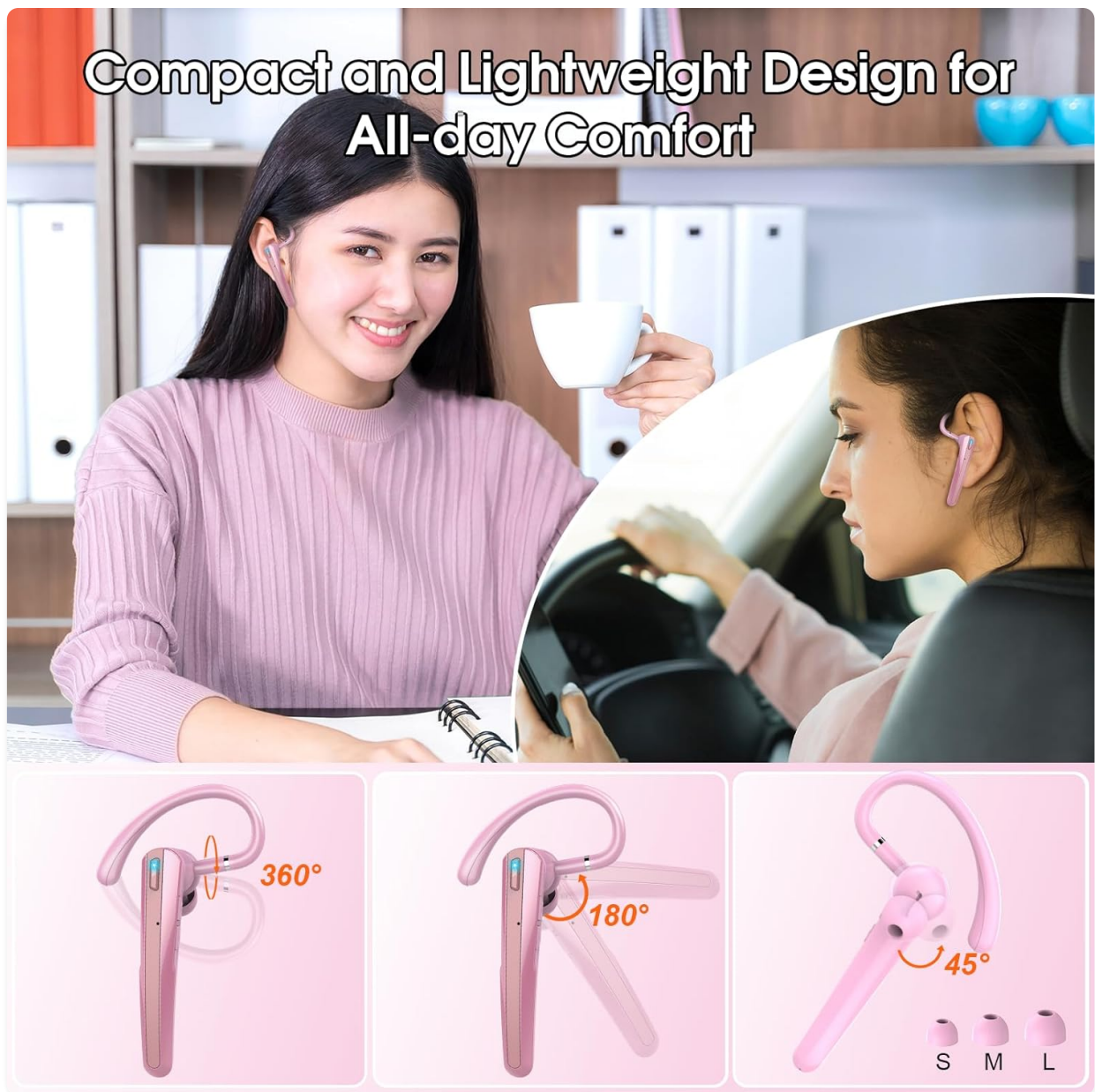
Image: Headset controls and ports