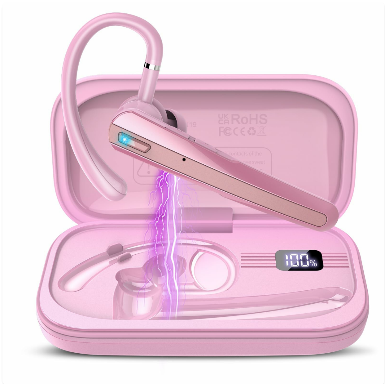
Image: SKIUDCT N19 Bluetooth Headset