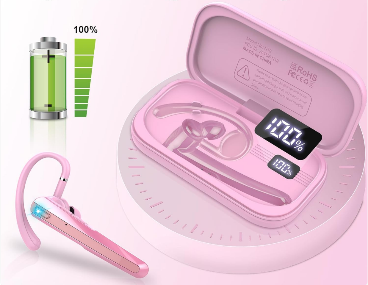
Image: 13mm Speaker Drivers for HiFi Stereo Sound