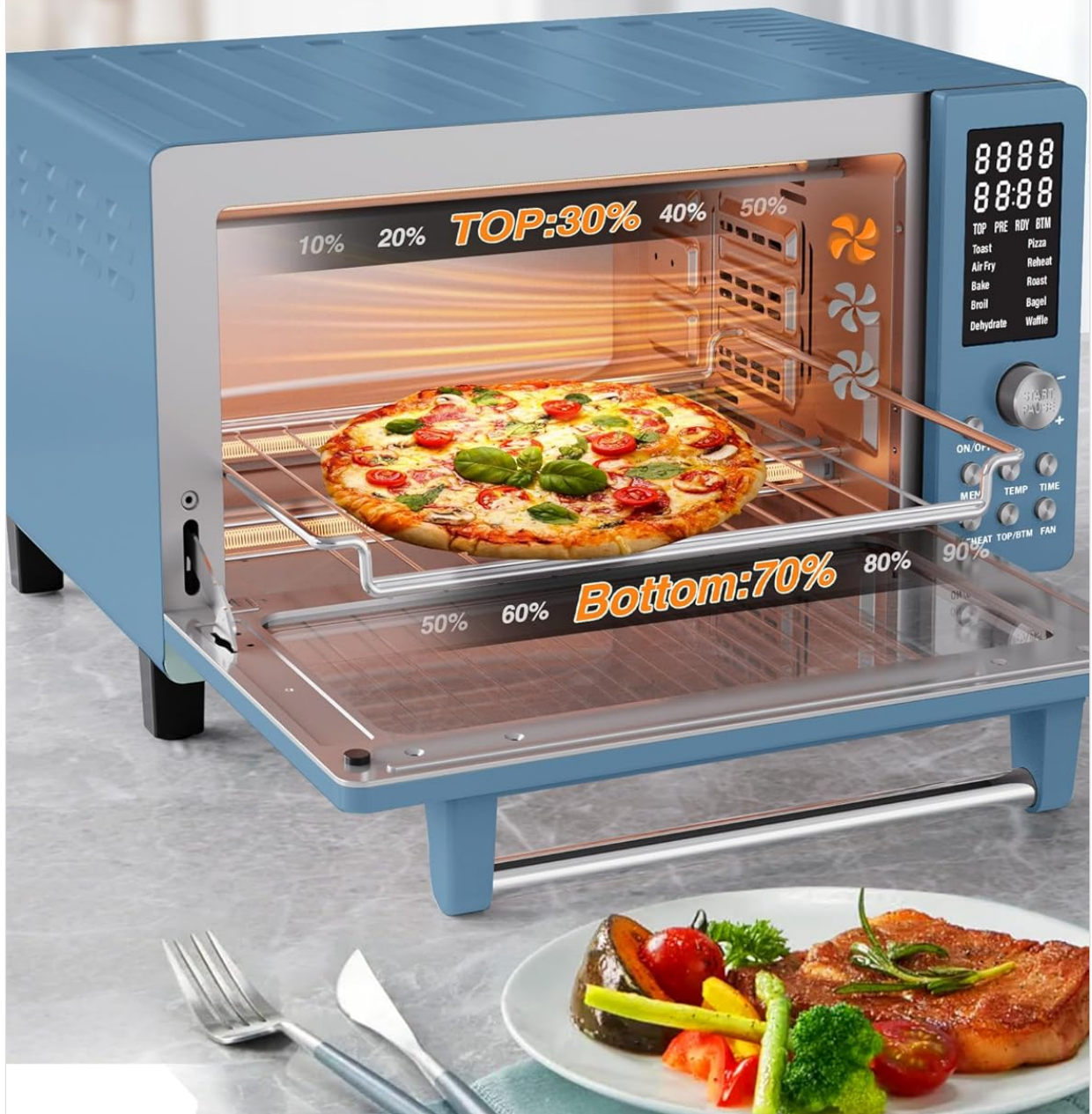
Image: The digital control panel of the Nuwave Bravo Pro Smart Oven, displaying the 10 preset cooking functions and the central control dial.

Adjust the ratio of the top and bottom heaters for crispy crusts and melty cheese