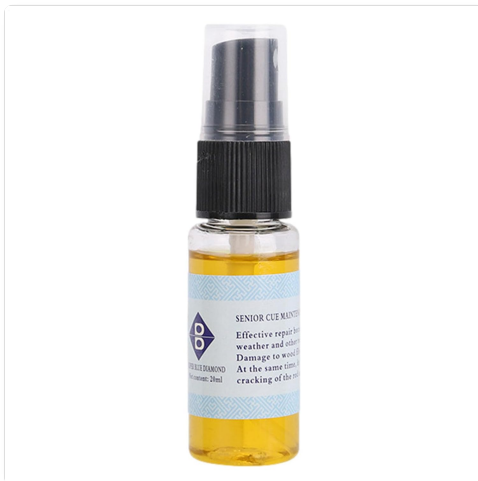
Image: The Generic Pool Cue Maintenance Oil in a 20ml spray bottle.

This manual provides instructions for the proper use and maintenance of the Generic Pool Cue Maintenance Oil. This high-quality lubricating oil is designed to extend the service life of your pool cue by reducing friction and wear, penetrating deep into the rod to remove dirt and stains, and adding a professional glossy sheen.