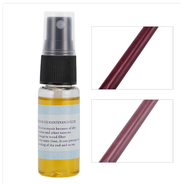
Image: A visual comparison showing a cue shaft before and after treatment with the maintenance oil, highlighting improved appearance.