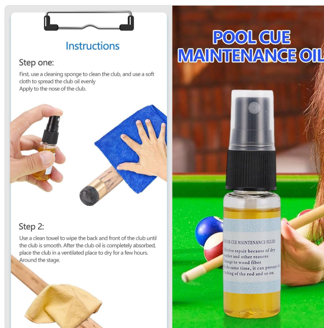
Image: A hand wiping a pool cue with a cloth, demonstrating the wiping and drying process after oil application.

Use a clean towel to wipe the back and front of the cue until it feels smooth. After the oil is completely absorbed, place the cue in a well-ventilated area to dry for a few hours. Ensure the cue is dry before storage or next use.