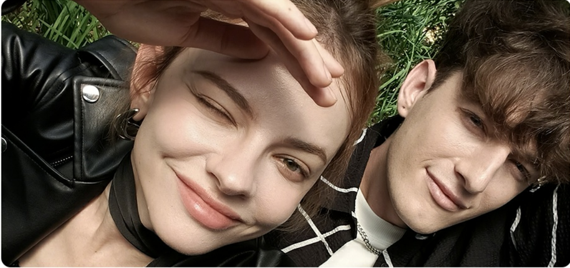
Image: A couple taking a selfie, demonstrating the clarity of the 32MP front camera.