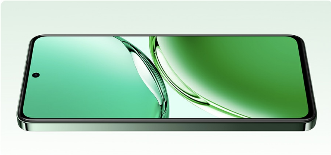
Image: The vibrant 120Hz AMOLED display of the OPPO F27 5G, showcasing its bright and clear visuals.