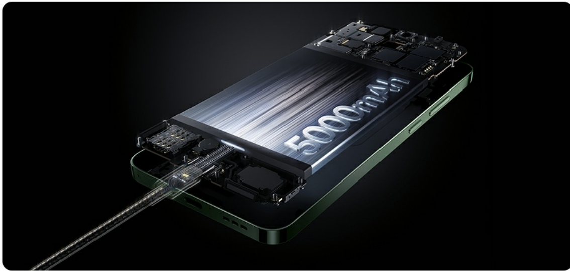
Image: An illustration showing the internal battery and the 45W SUPERVOOC charging process.