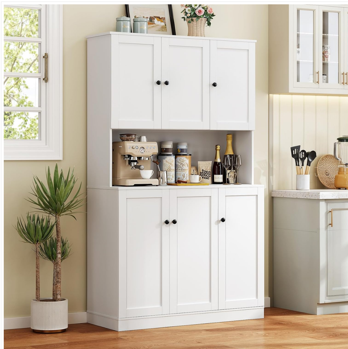
Image: A detailed view highlighting the adjustable shelves, the spacious countertop area for appliances, and the practical door shelves with guardrails to prevent items from falling.

reposition the shelf pins to the desired height, and then reinsert the shelf securely.