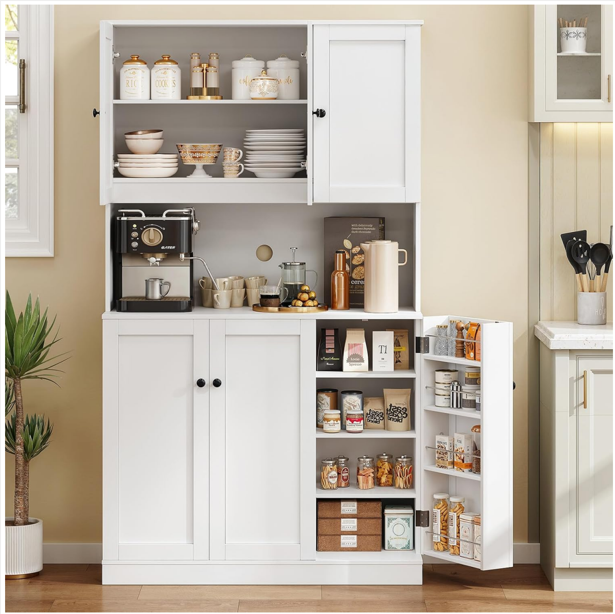
Image: The fully assembled ONBRILL 71" Tall Kitchen Pantry Storage Cabinet, showcasing its ample storage capacity and modern design.