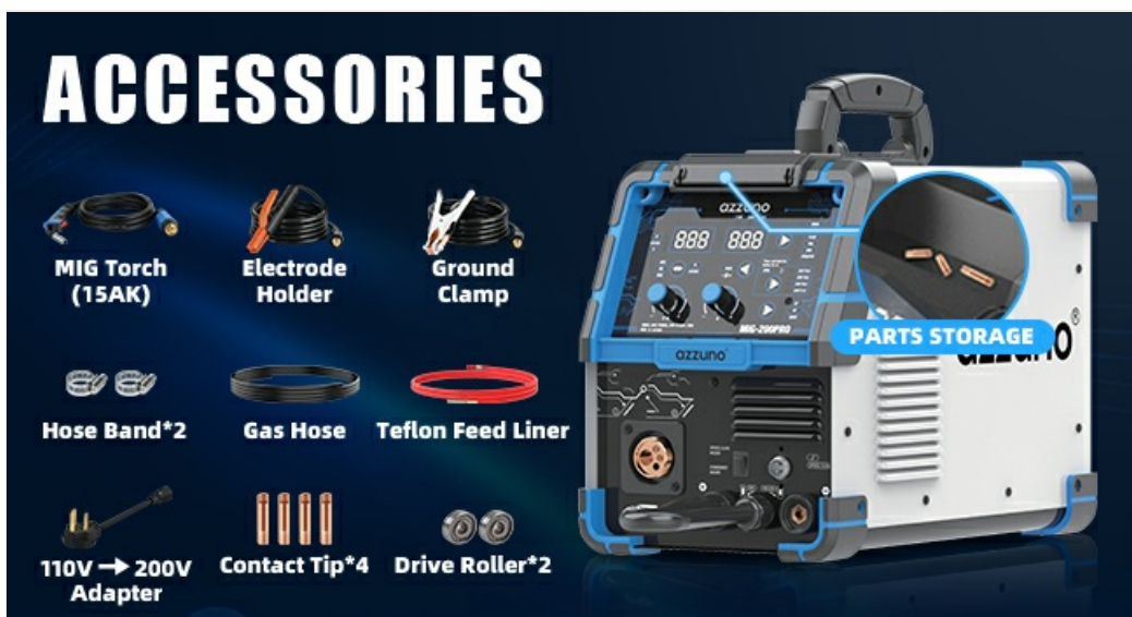
Image: A visual display of the AZZUNO MIG-200PRO welder and all its standard accessories, including the MIG torch, ground clamp, electrode holder, power adapter, and various consumables.