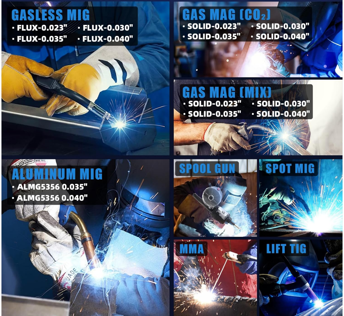
Image: Visual representation of the eight welding processes supported by the AZZUNO MIG-200PRO, including Gasless MIG, Gas MAG (CO 2 ), Gas MAG (MIX), Aluminum MIG, Spool Gun, Spot MIG, MMA (Stick), and Lift TIG.