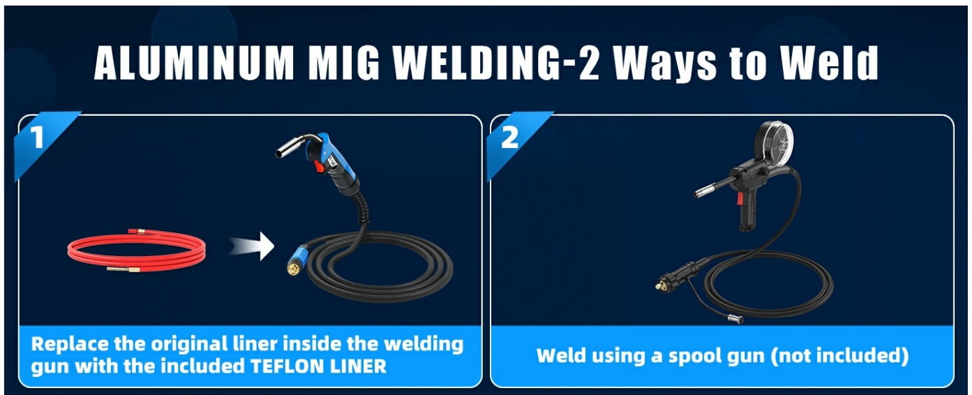
Image: A visual guide explaining the two methods for Aluminum MIG welding: replacing the torch liner with a Teflon liner, or using a separate spool gun.