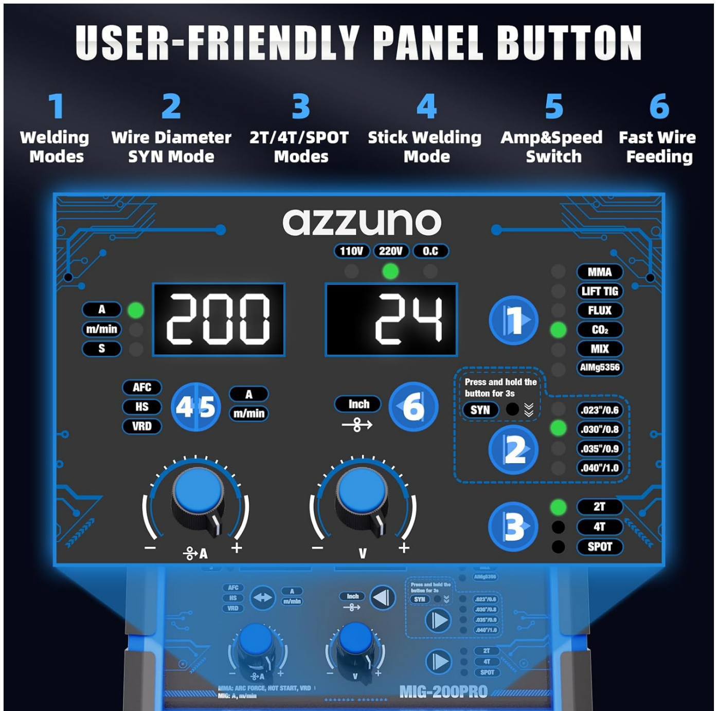
Image: A close-up view of the AZZUNO MIG-200PRO's control panel, labeling key functions such as Welding Modes, Wire Diameter, 2T/4T/Spot Modes, Stick Welding Mode, Amp & Speed Switch, and Fast Wire Feeding.

Familiarize yourself with the control panel for optimal welding performance.