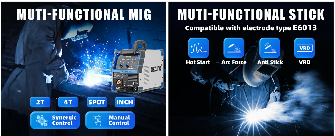
Image: A split image demonstrating the multi-functional capabilities for both MIG welding (with 2T, 4T, Spot, Inch, Synergic, and Manual Control options) and Stick welding (with Hot Start, Arc Force, Anti Stick, and VRD features).

The MIG-200PRO offers various welding modes for different applications.