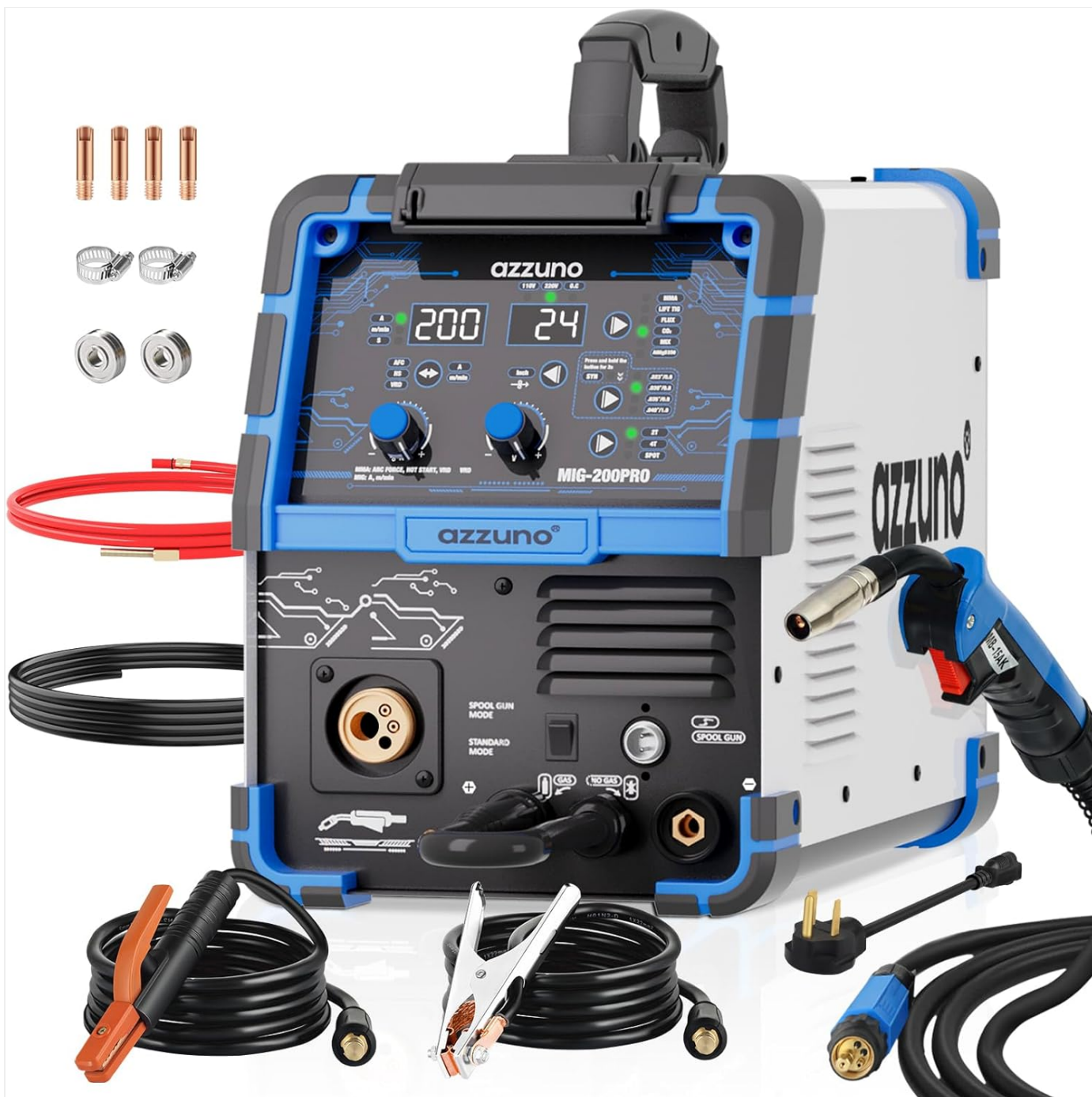
Image: The AZZUNO MIG-200PRO Multiprocess Welder shown with its included accessories, highlighting its compact design and comprehensive kit.