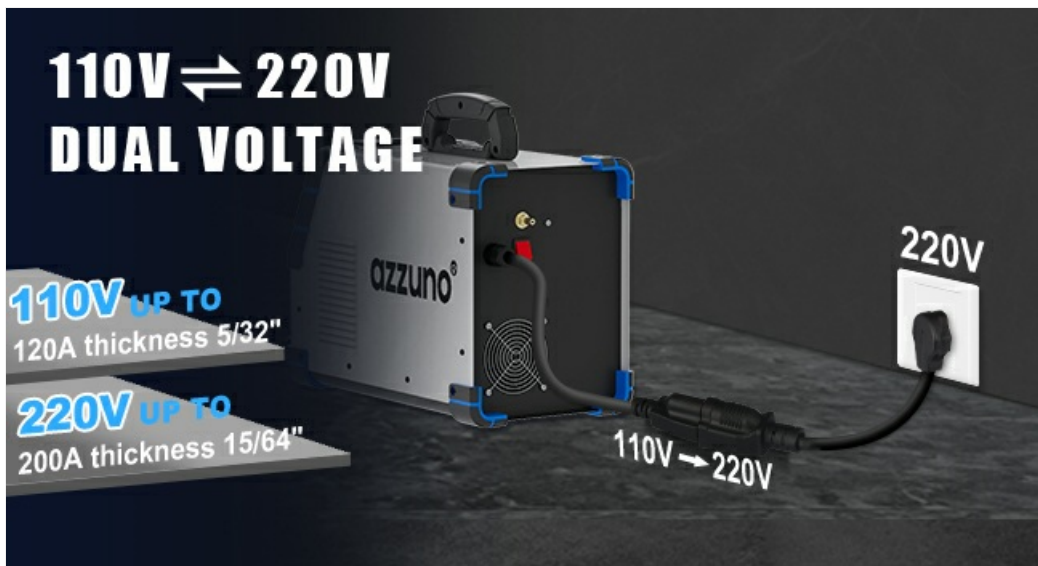
Image: A graphic demonstrating the dual voltage capability of the welder, showing connections for both 110V and 220V power sources and their respective welding capacities.