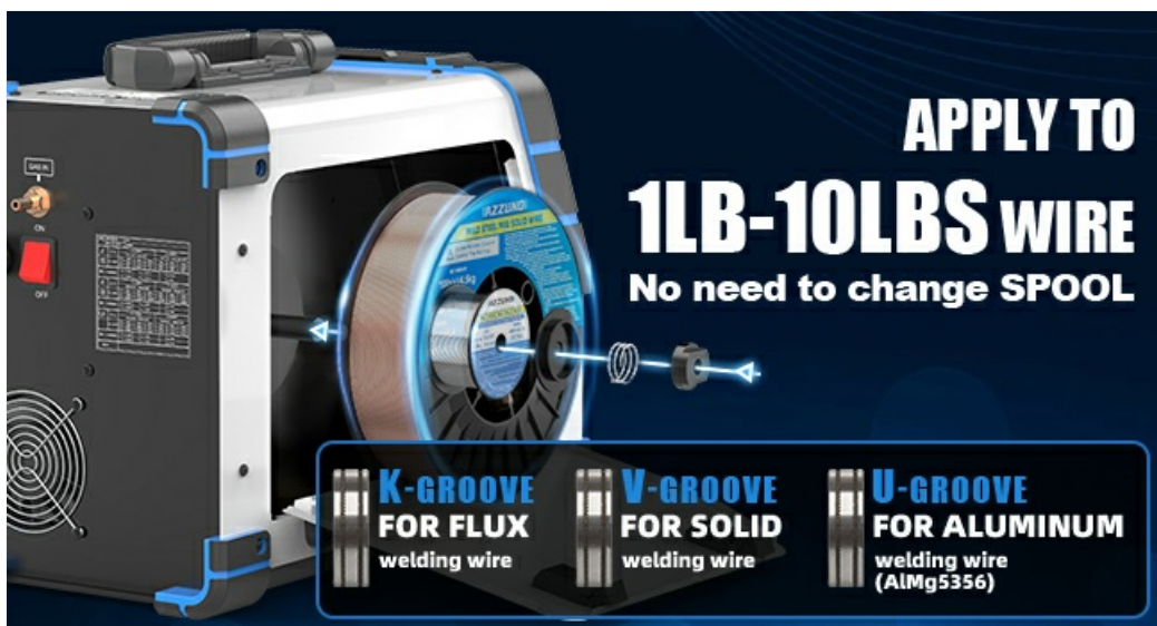
Image: An illustration of how to install a welding wire spool (1lb-10lbs) into the welder, along with a visual guide to selecting the correct K-groove, V-groove, or U-groove drive roller for different wire types.