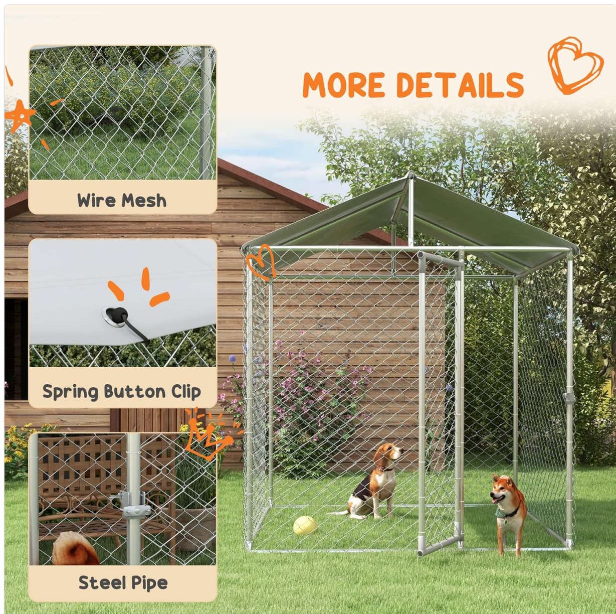
Image 4.1: Details of the kennel's construction, highlighting the wire mesh, spring button clips for the cover, and galvanized steel pipes.

For detailed visual guidance, refer to the diagrams and illustrations provided in the product packaging or on the manufacturer's website.