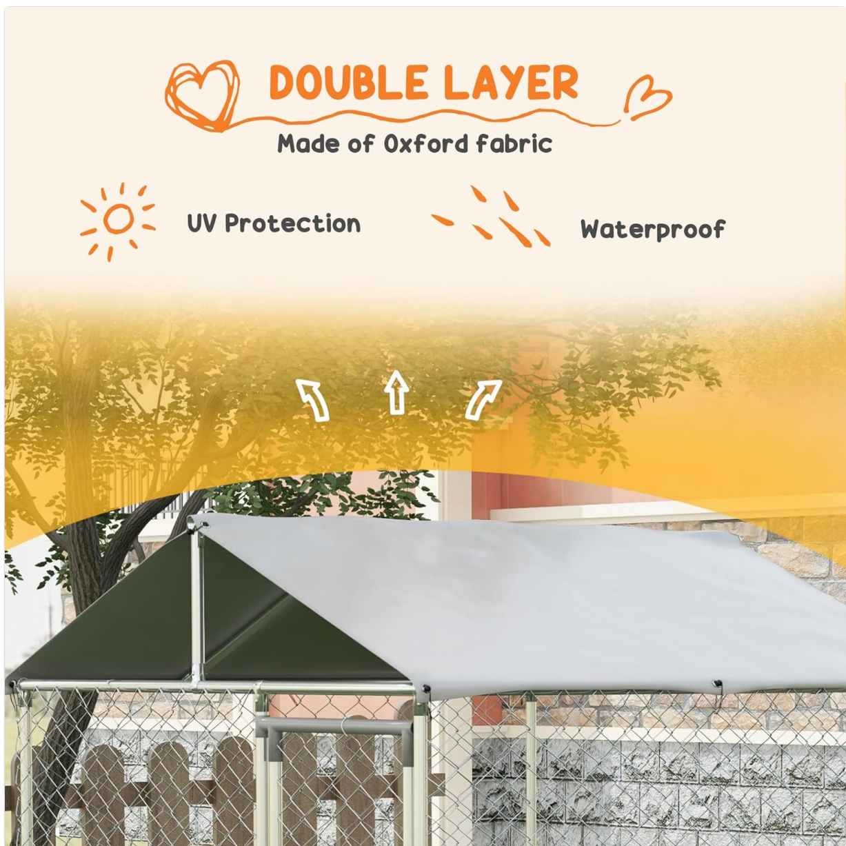
Image 6.1: Illustrates the double-layer Oxford fabric roof, emphasizing its UV protection and waterproof features, which are key for maintenance.