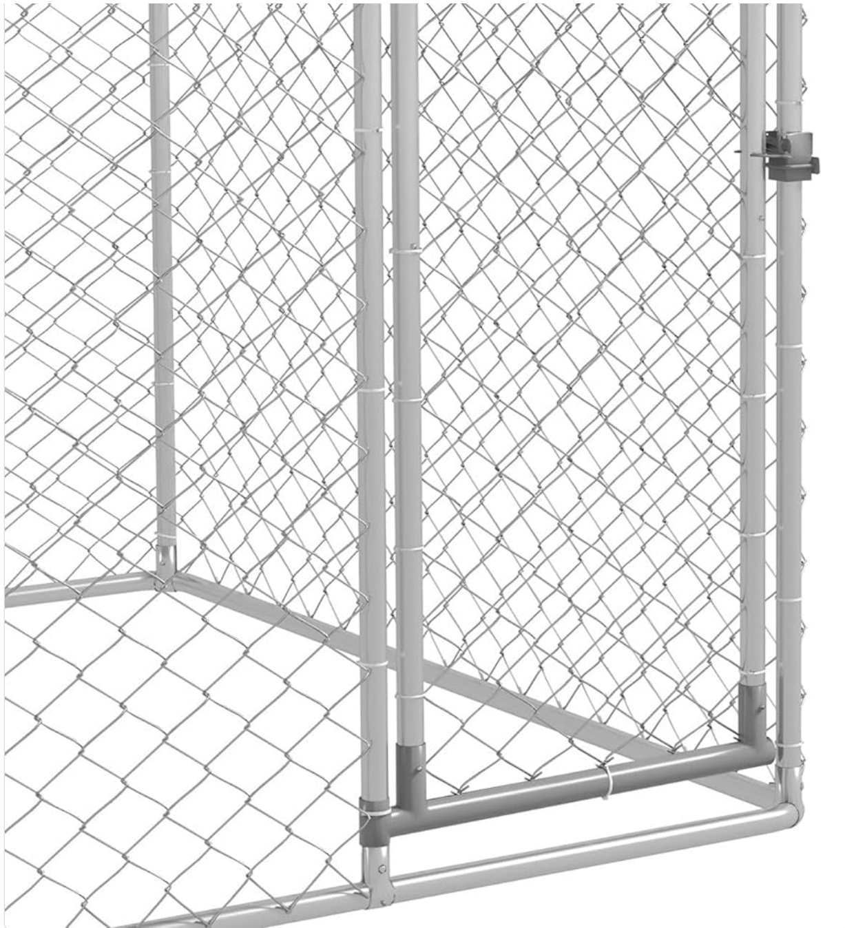
Image 5.2: A detailed view of the door and its secure latch, emphasizing the safety feature.