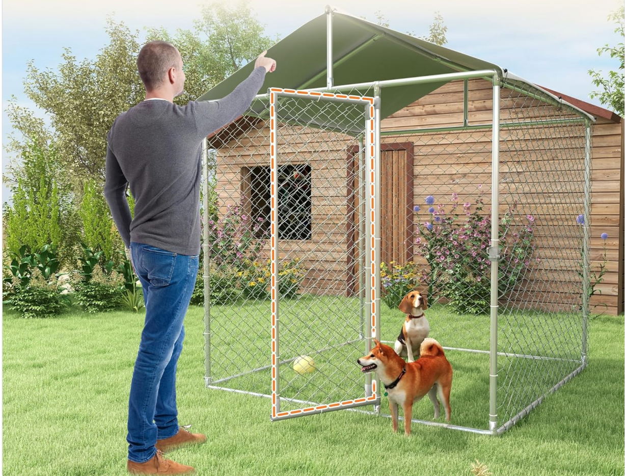
Image 5.1: Demonstrates the walk-in door feature, allowing easy entry and exit for pet owners to interact with their pets.

It allows pet parents to enter in and feed pets