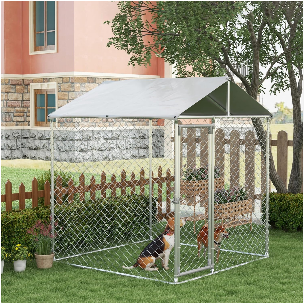
Image 1.1: Fully assembled PawHut Outdoor Dog Kennel with two dogs inside, situated in a grassy backyard.