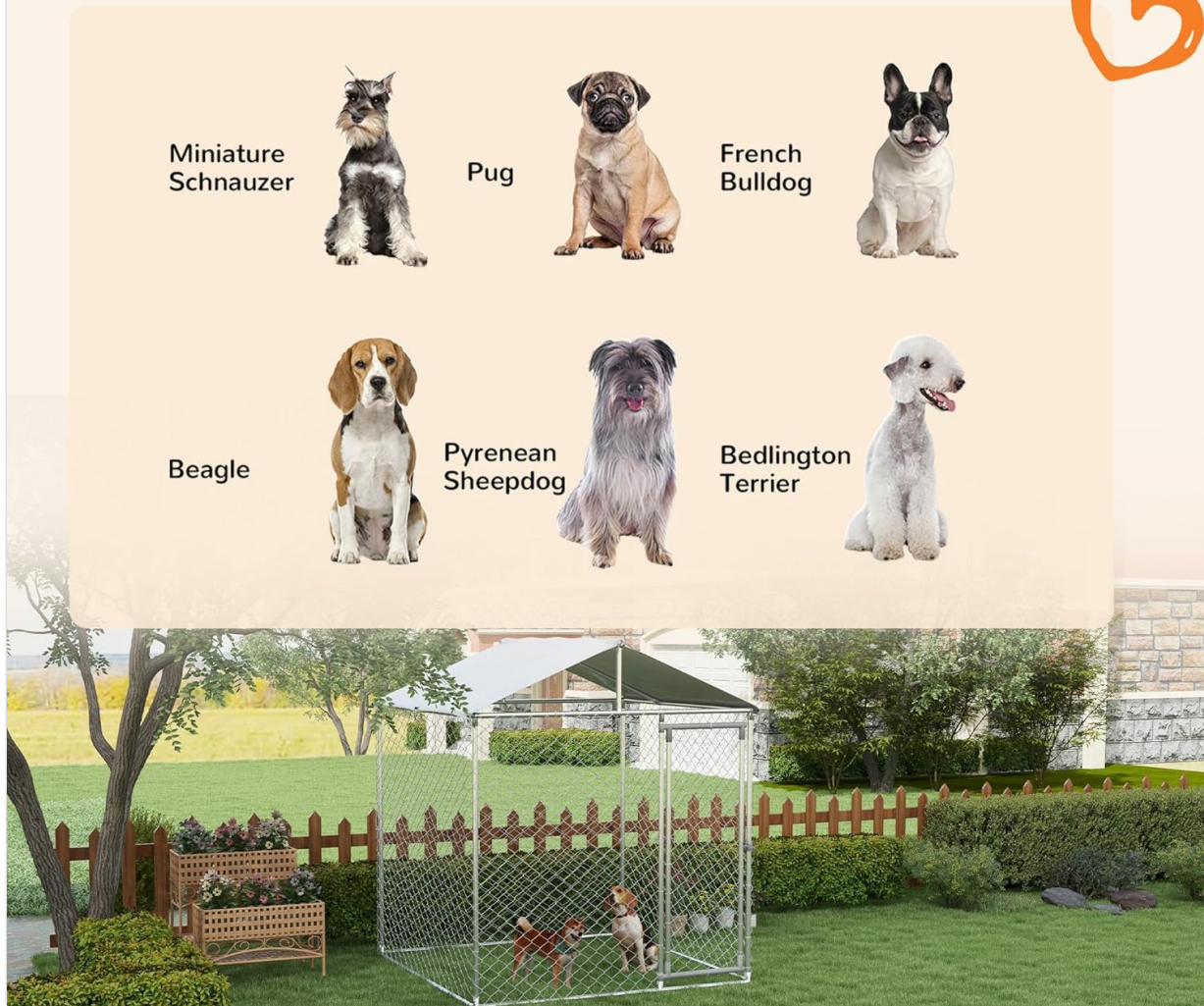
Image 3.2: Visual guide indicating the kennel's suitability for various small and medium dog breeds.