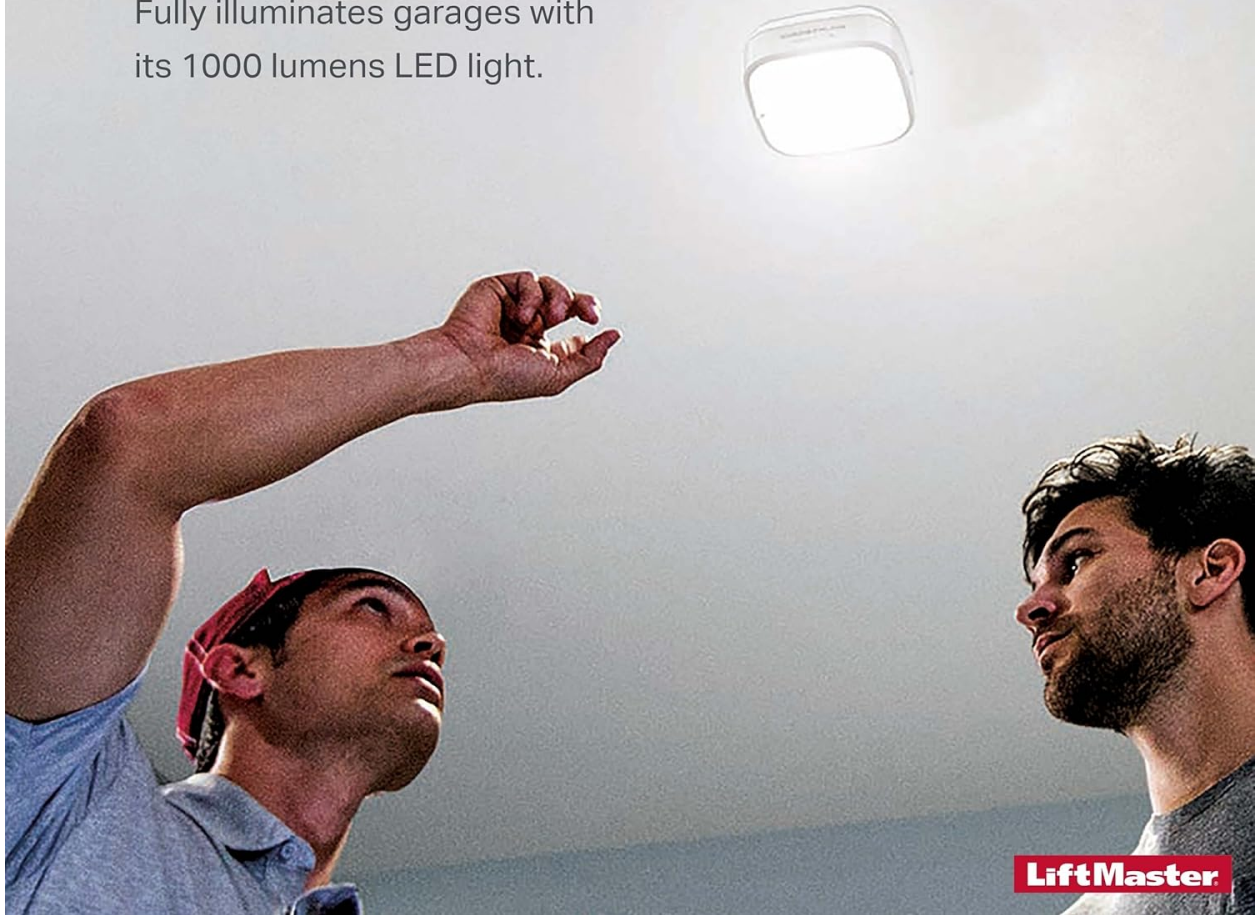
Figure 4: The MyQ Smart LED Garage Light provides bright illumination for your garage.

Fully illuminates garages with its 1000 lumens LED light.