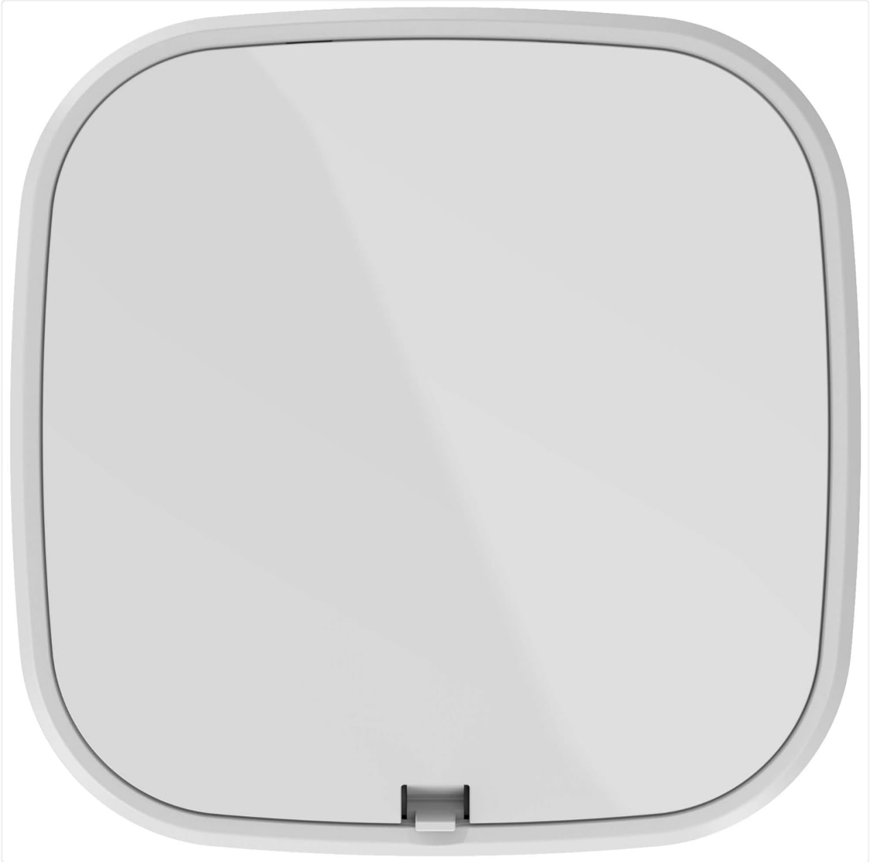
Figure 1: Top-down view of the LiftMaster MyQ Smart LED Garage Light (Model 837LM).

The LiftMaster MyQ Smart LED Garage Light (Model 837LM) is designed to provide efficient and smart lighting for your garage. It integrates with the MyQ system for enhanced control and automation.