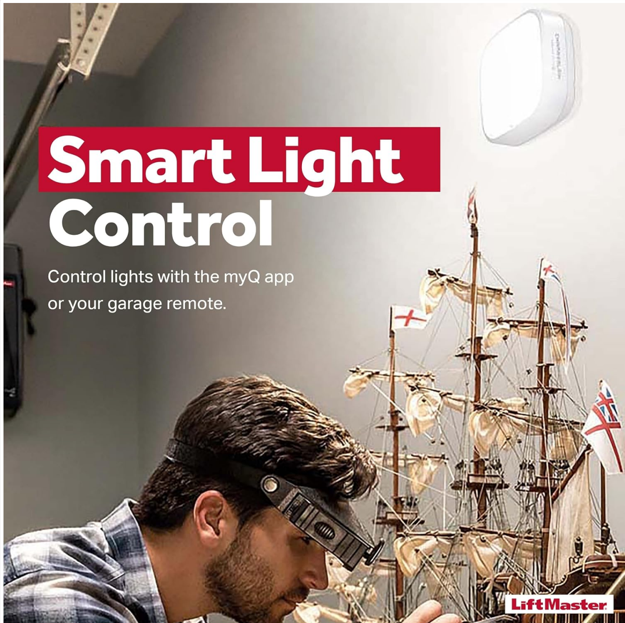
Figure 5: Control your light with the MyQ app or your garage remote.