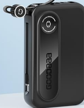
Image: Illustration of the power bank's high-speed USB-C two-way charging capability.