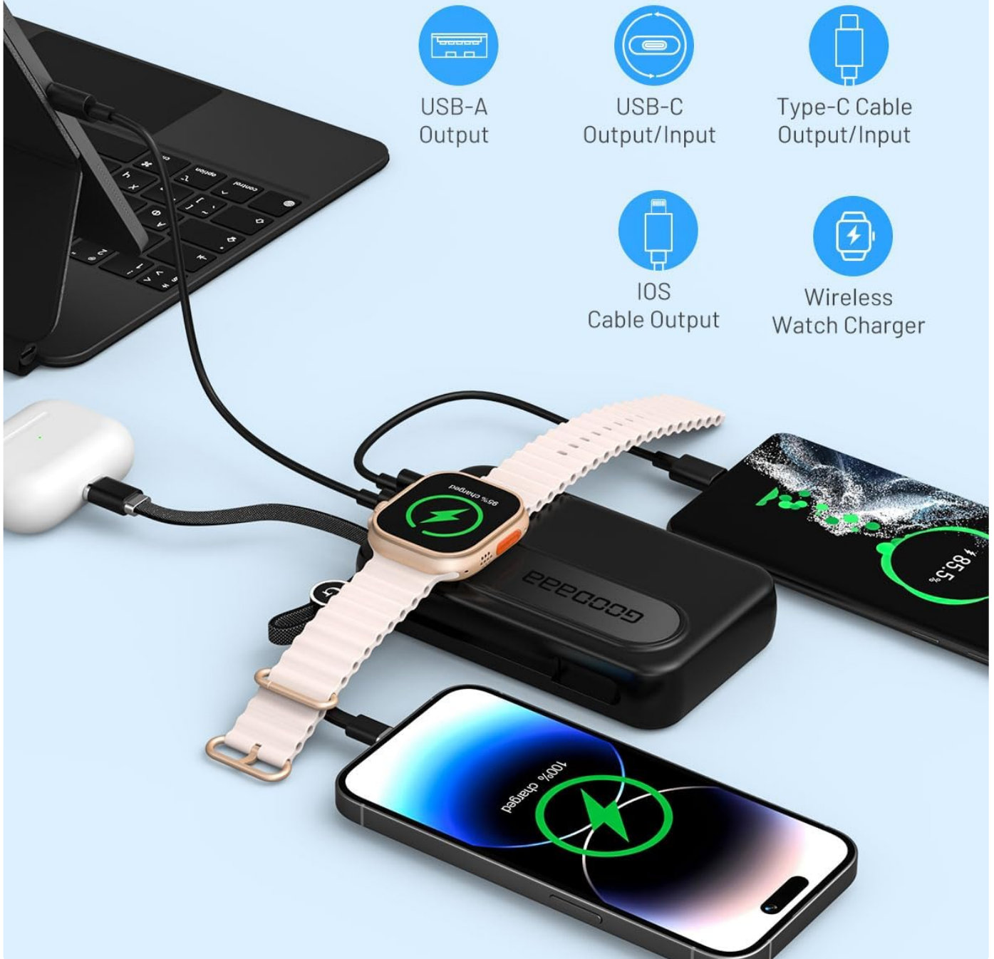
Image: The power bank charging multiple devices at once, showcasing its versatility.