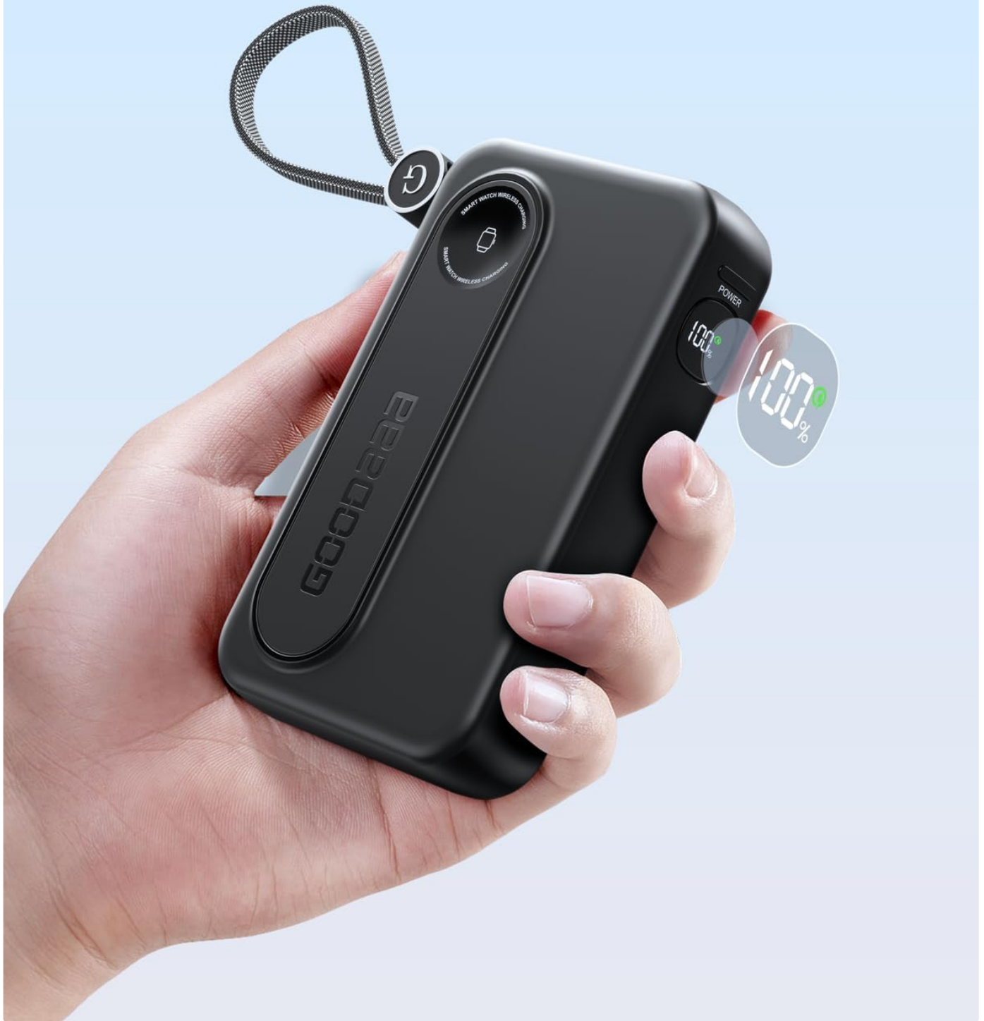
Image: The power bank easily fitting into a backpack pocket, emphasizing its portable design.