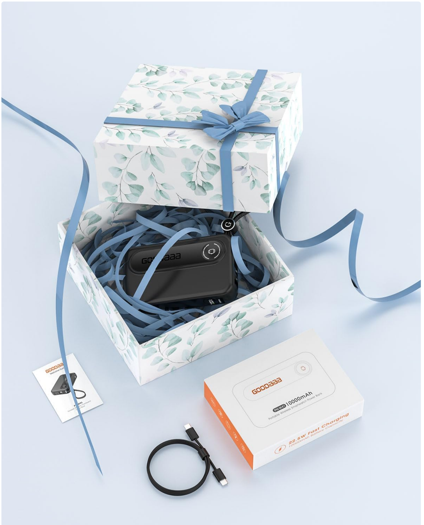
Image: The GOODaaa 10000mAh Power Bank, USB-A to USB-C cable, and user manual as packaged in the box.