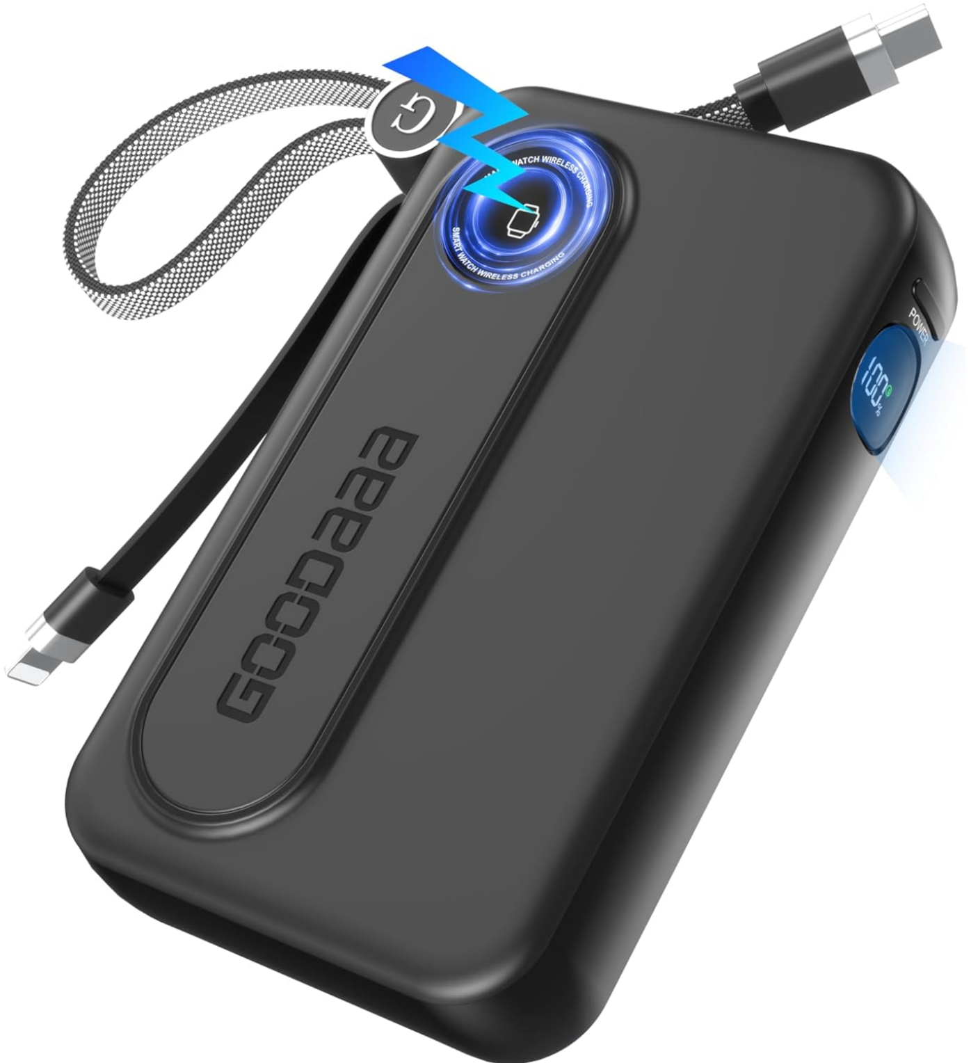
Image: The GOODaaa Power Bank, highlighting its sleek design and built-in features.