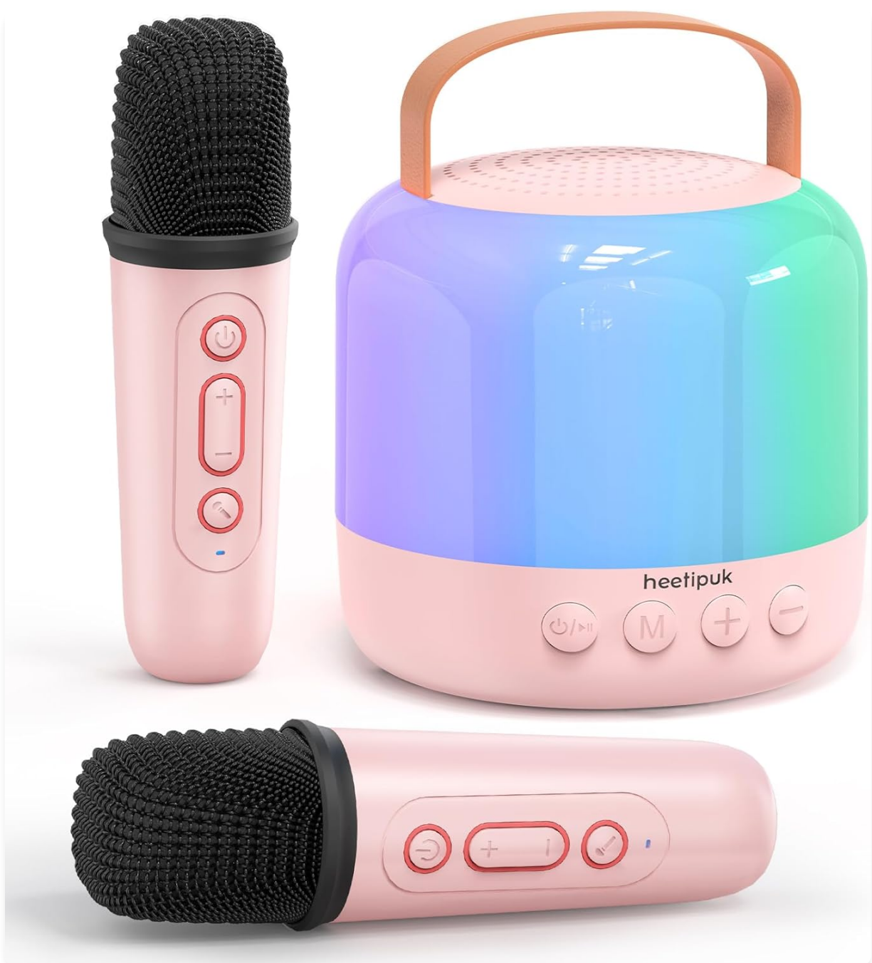
Image 1.1: The heetipuk Y6 Mini Karaoke Machine, featuring the main speaker unit and two wireless microphones.