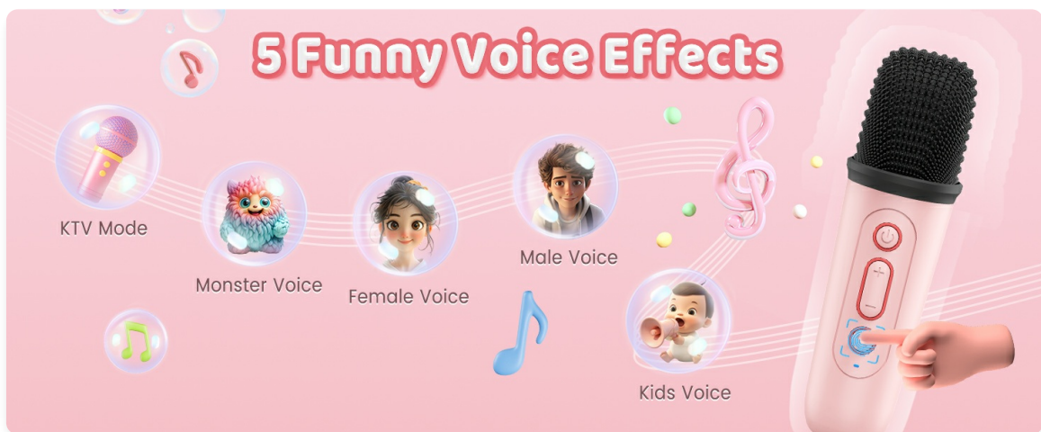
Image 5.2: The five distinct voice-changing effects available on the microphones.