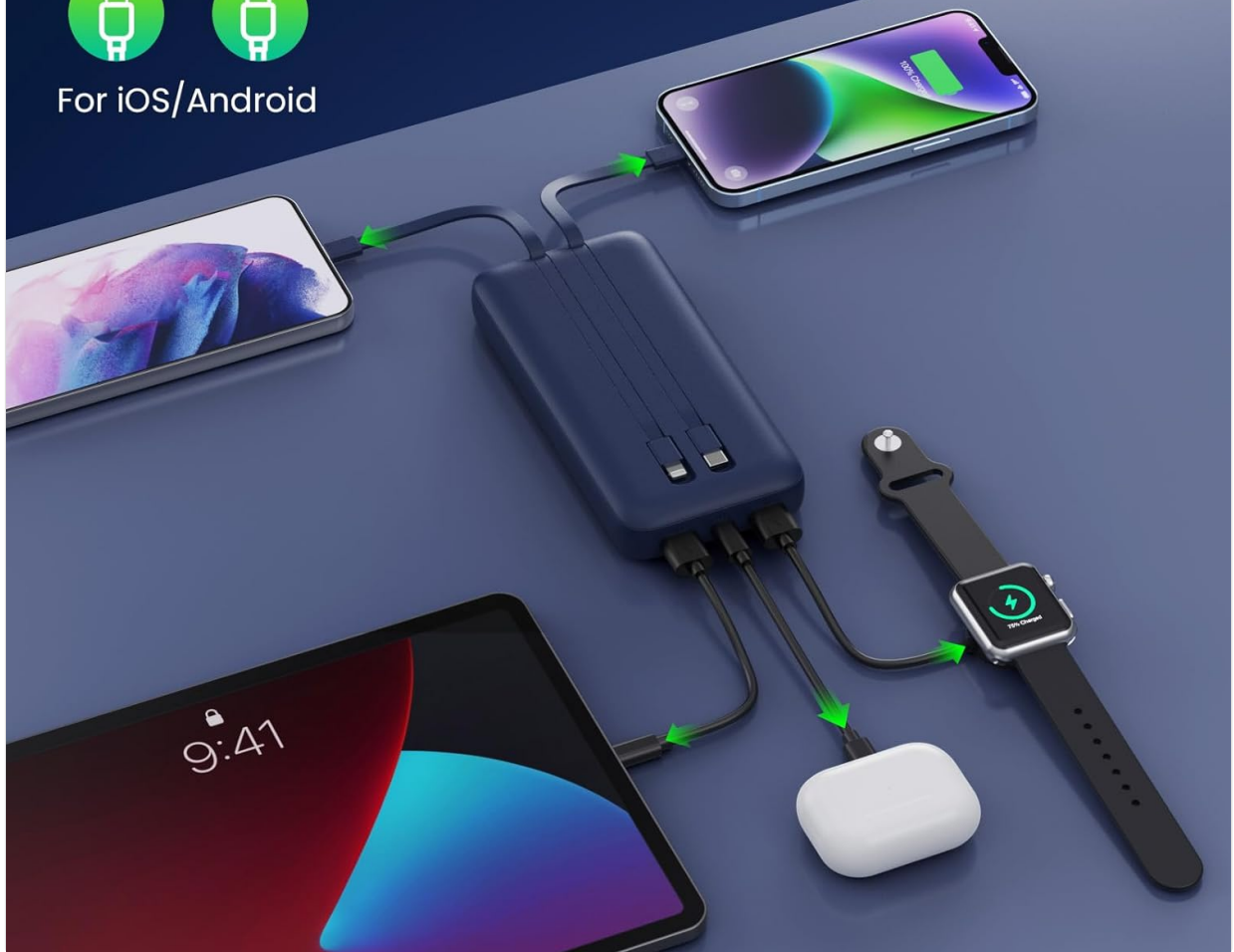
Image: The Pxwaxy power bank demonstrating its ability to charge up to five devices concurrently using its various ports and built-in cables.