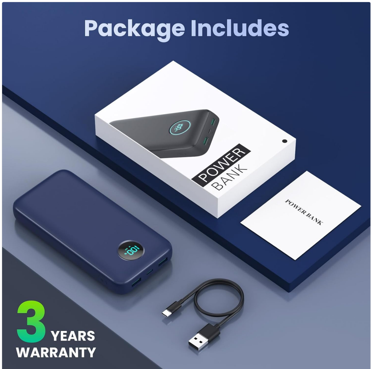
Image: The product package, including the power bank, a USB-C charging cable, and the user manual, clearly indicating a 3-year warranty.

The Pwxaxy 40,800mAh Portable Power Bank comes with a 3-year warranty from the date of purchase, covering manufacturing defects. Please retain your proof of purchase for warranty claims.