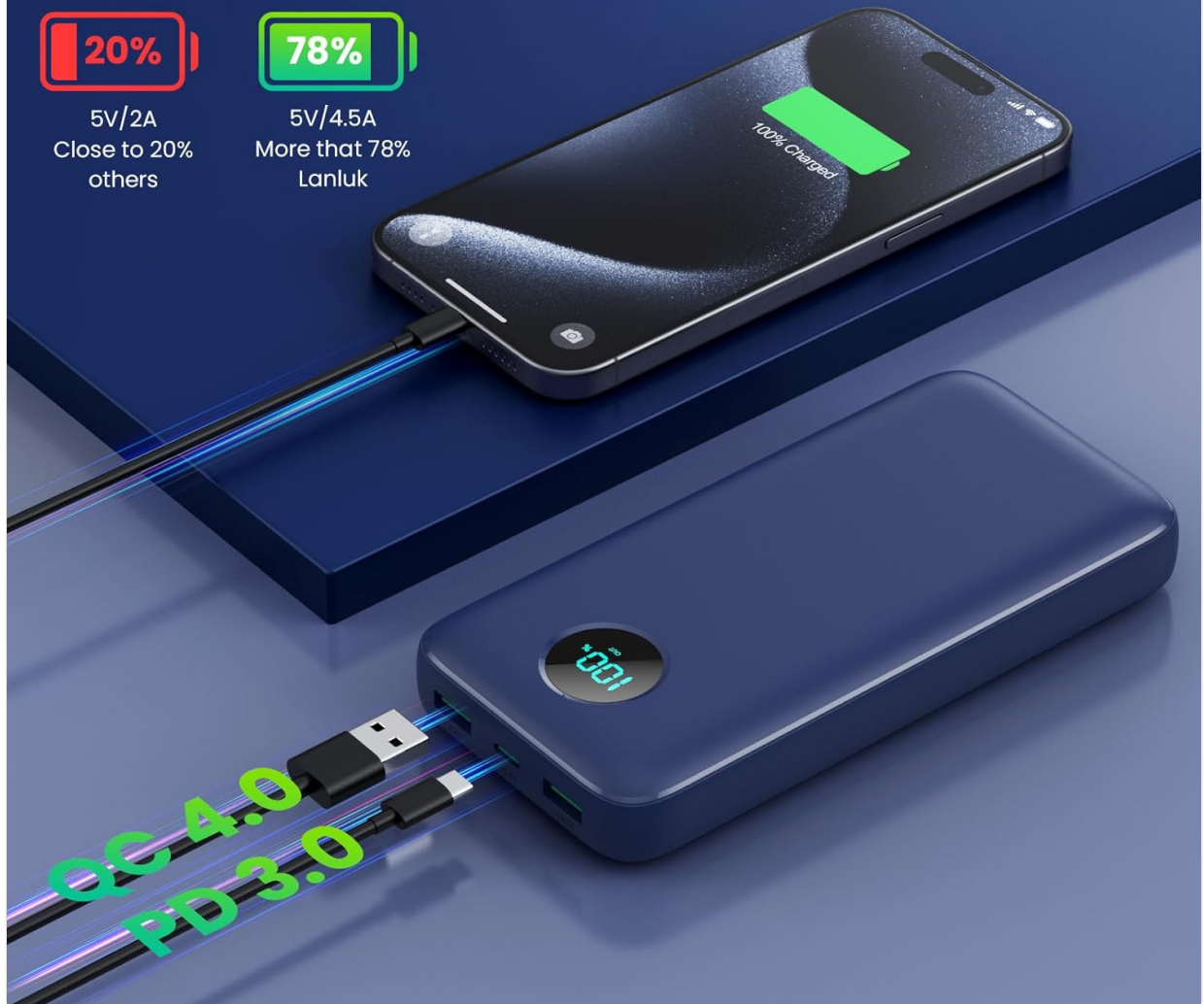
Image: Illustration highlighting the 25W high-speed charging capability of the power bank, showing a phone charging rapidly.