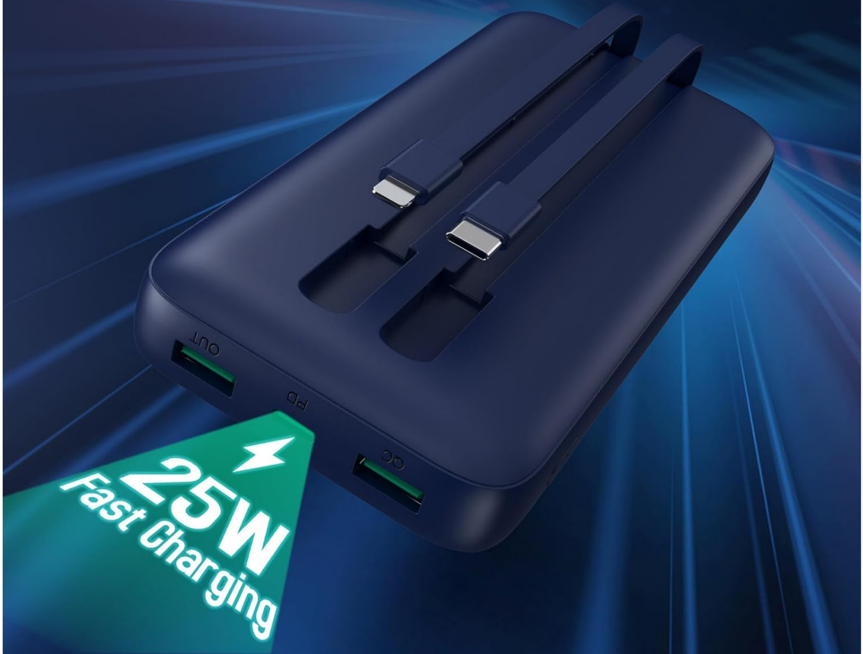
Image: The power bank displaying its built-in USB-C and iOS (Lightning) charging cables, emphasizing convenience and 25W fast charging.

Built-in 2 Charging Cables NO need to carry charging cables when going out