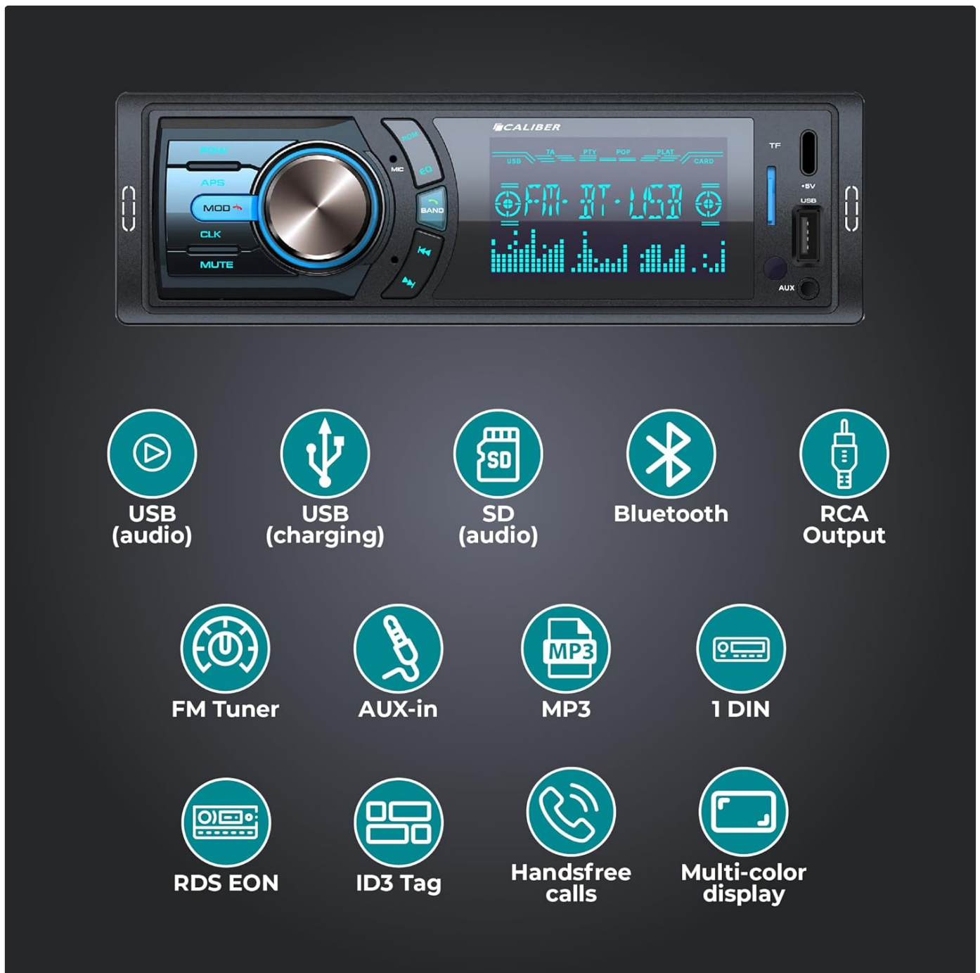
Figure 2.2: Visual representation of the main features and connectivity options of the Caliber Autoradio.