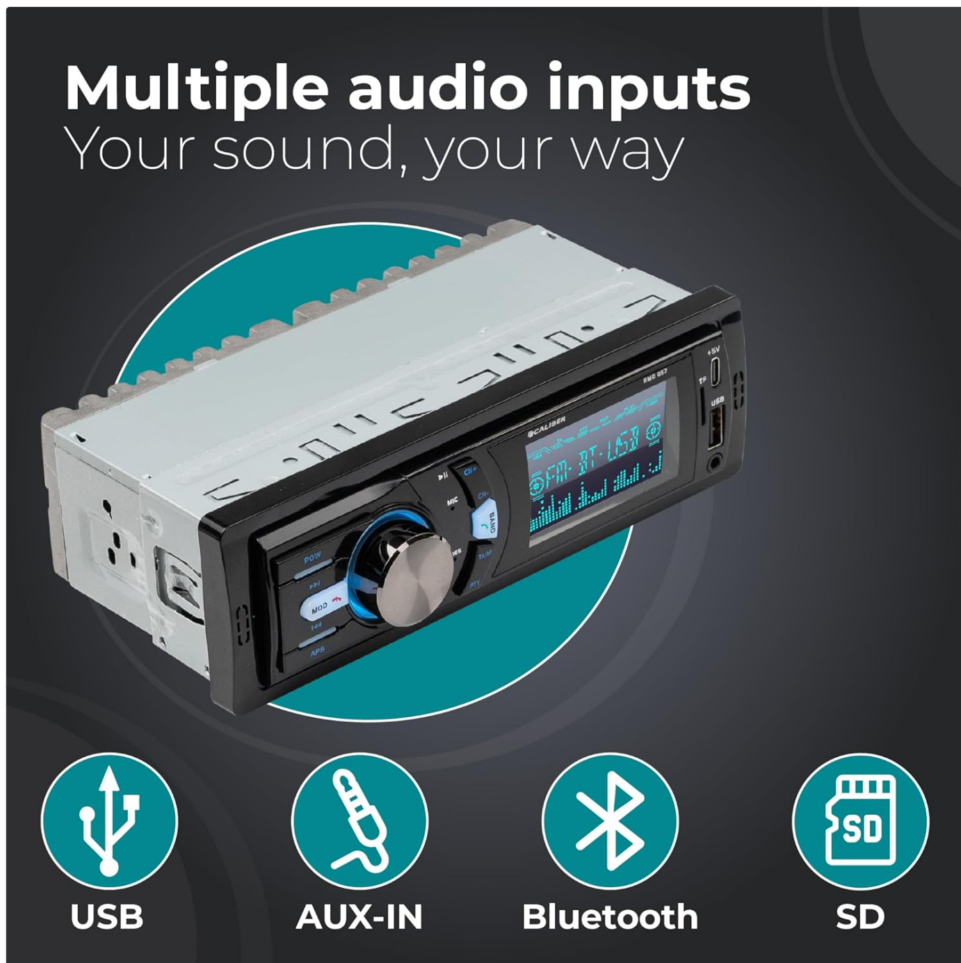
Figure 3.2: The compact 1DIN design of the Caliber Autoradio, suitable for standard car stereo slots.

Slide the metal mounting sleeve into the dashboard opening. Bend the tabs outward to secure it. Insert the radio into the sleeve until it locks into place.