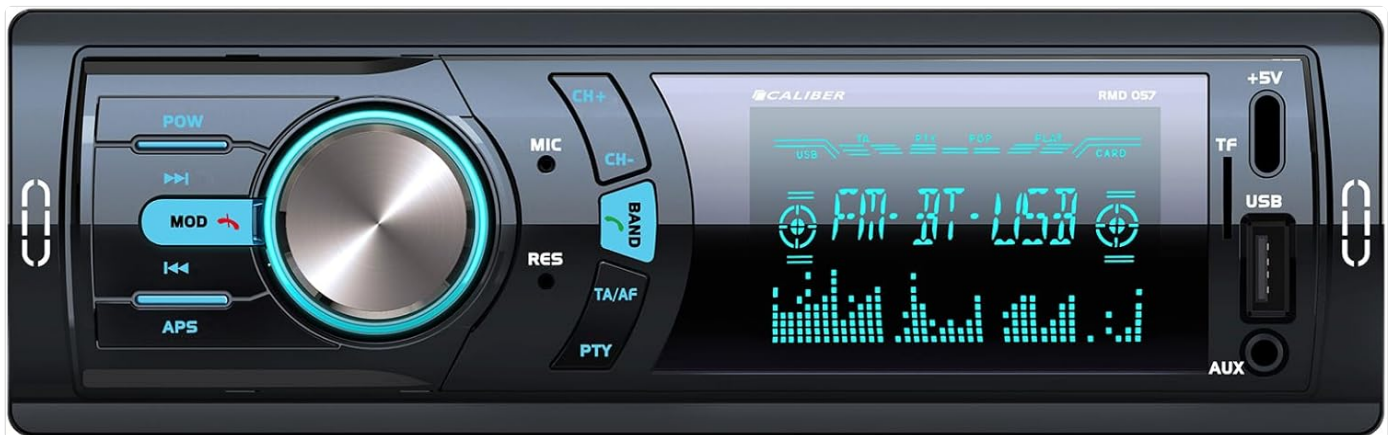
Figure 2.1: Front panel of the Caliber Autoradio RMD057-FBA, showing the central rotary knob, various control buttons, USB port, Micro SD slot, and AUX input.

The Caliber Autoradio RMD057-FBA is a versatile 1DIN car stereo system designed to enhance your in-car audio experience with modern connectivity options.