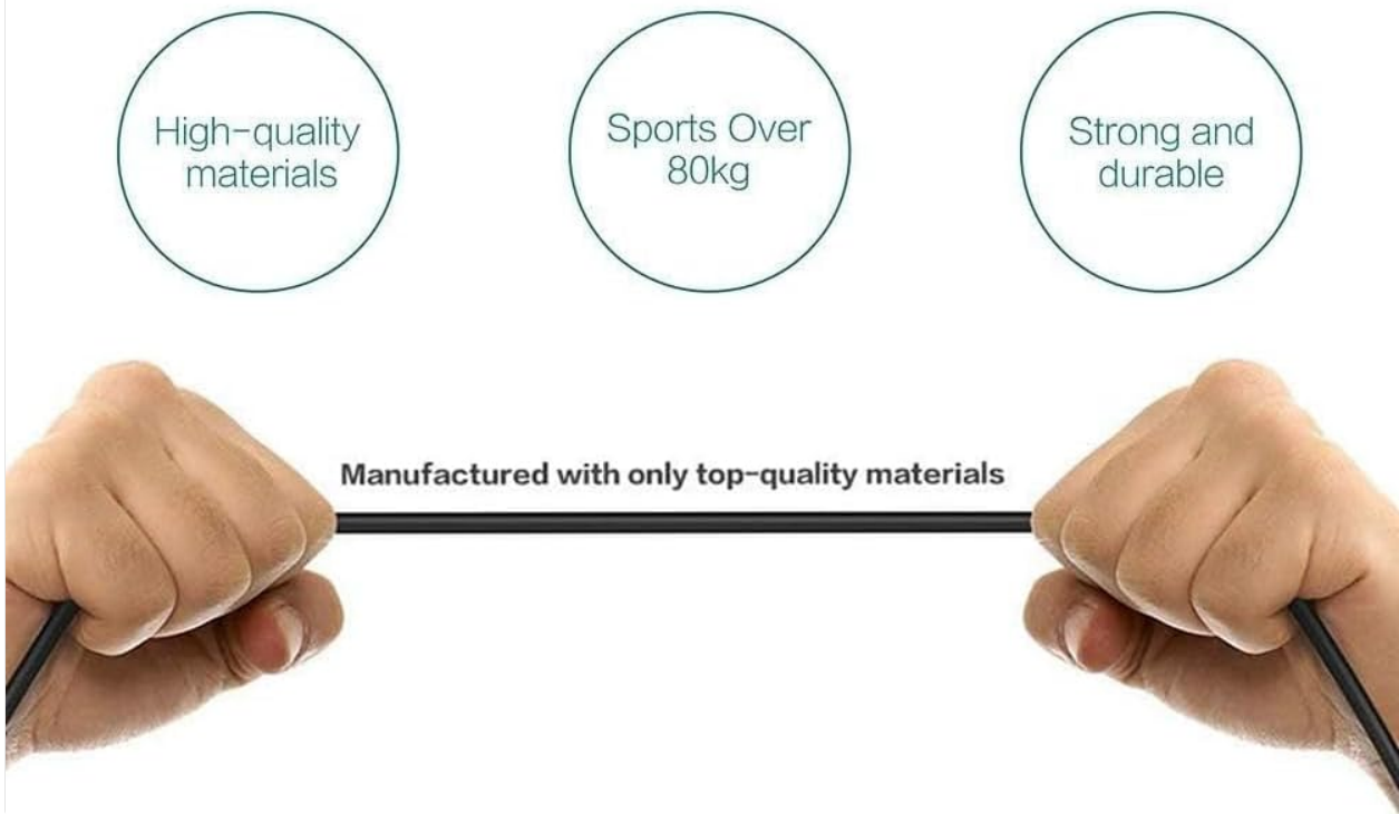
Image: Demonstration of the cable's durability and robust construction.