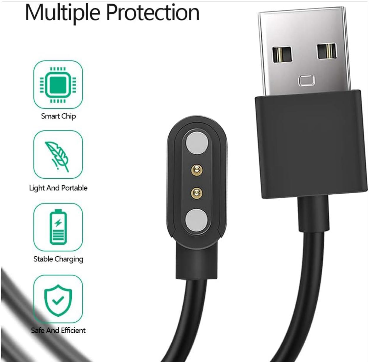
Image: Overview of the charger's safety and efficiency features, such as smart chip and stable charging.