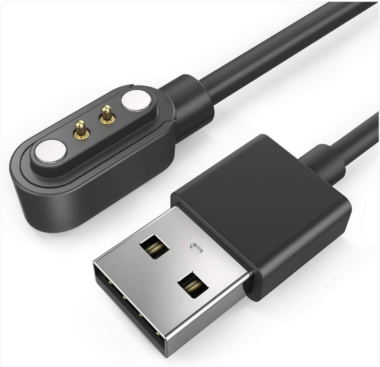
Image: Detailed view of the magnetic charging interface and the USB-A connector of the cable.