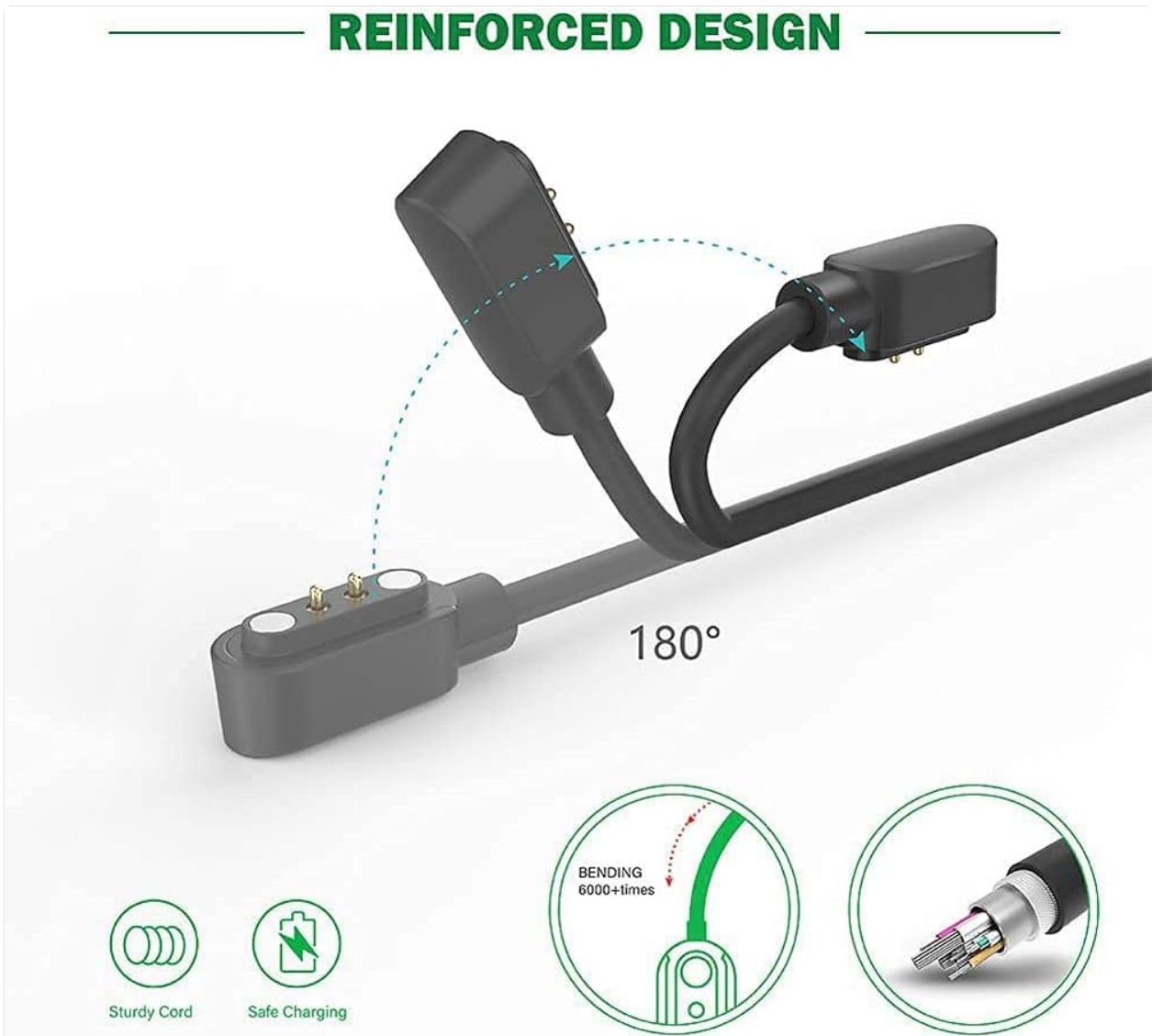
Image: Visual representation of the cable's reinforced design, highlighting its bending resistance.