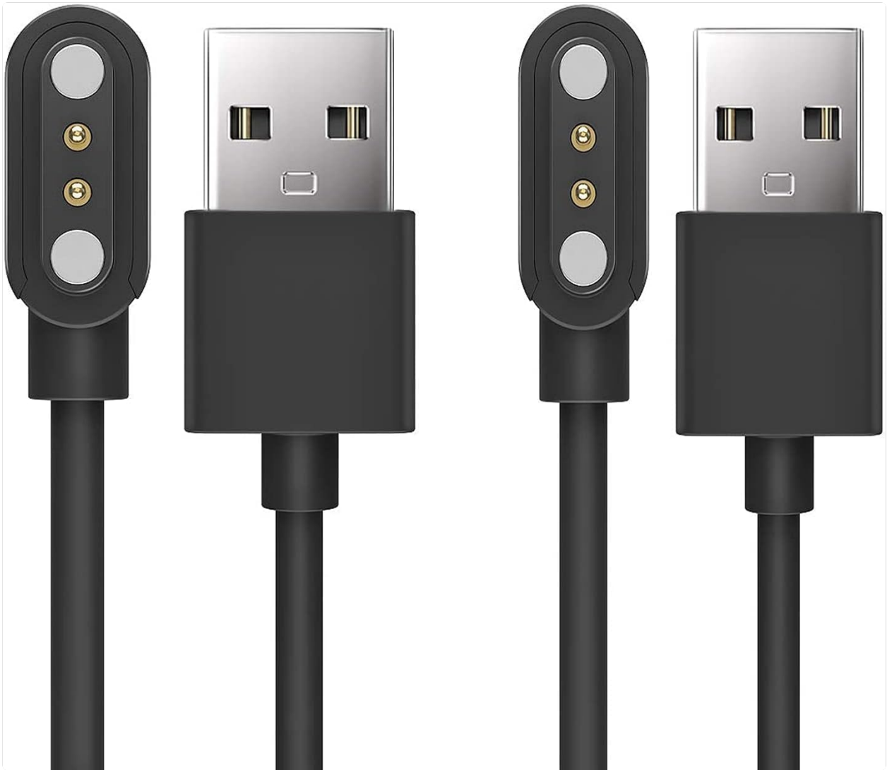
Image: Two E ECSEM magnetic USB charging cables, illustrating the magnetic contact points and the USB-A connector.