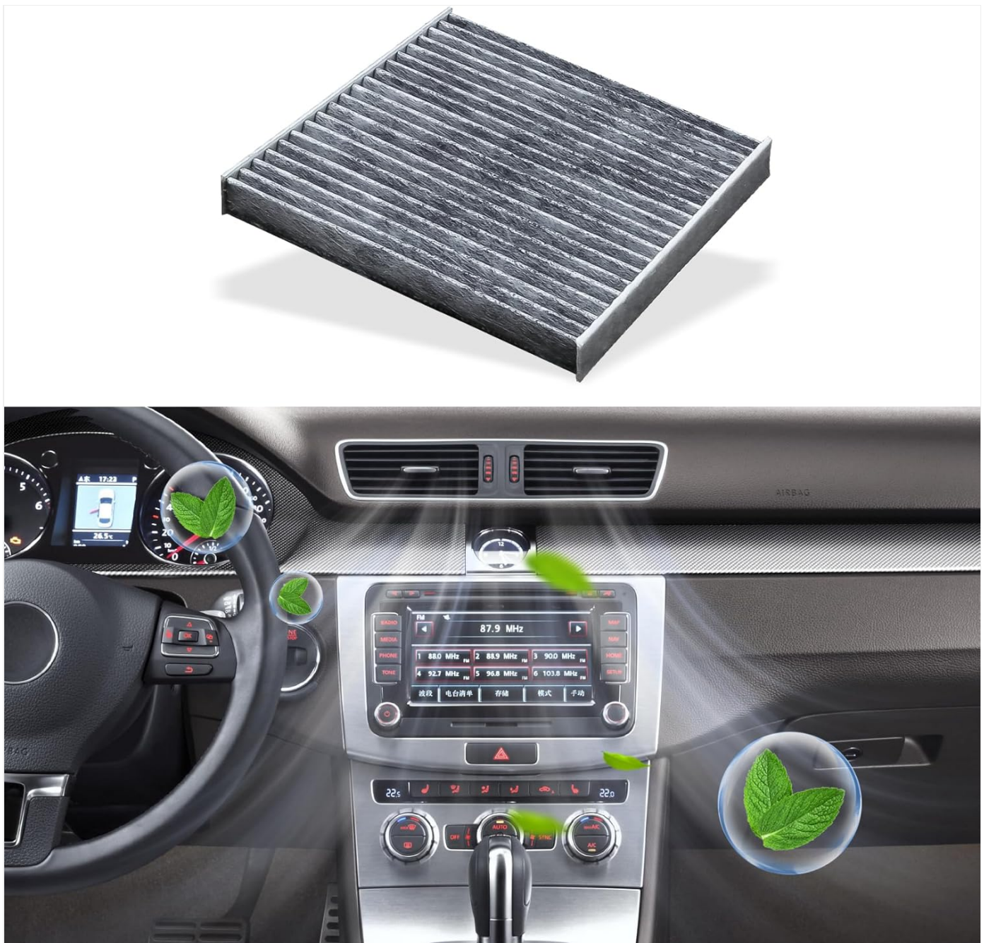
Image 1: Tecledsn Cabin Air Filter and a vehicle interior illustrating improved air circulation.