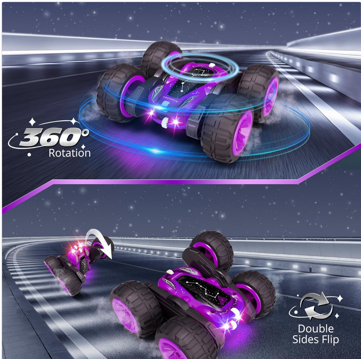
Figure 4: Demonstrating 360° rotation and double-sided flip capabilities.