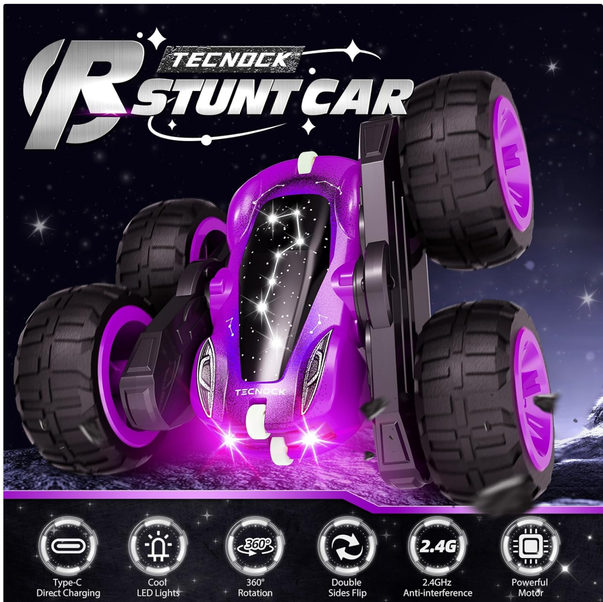
Figure 1: Tecnock S8915D Remote Control Stunt Car (Purple variant shown).