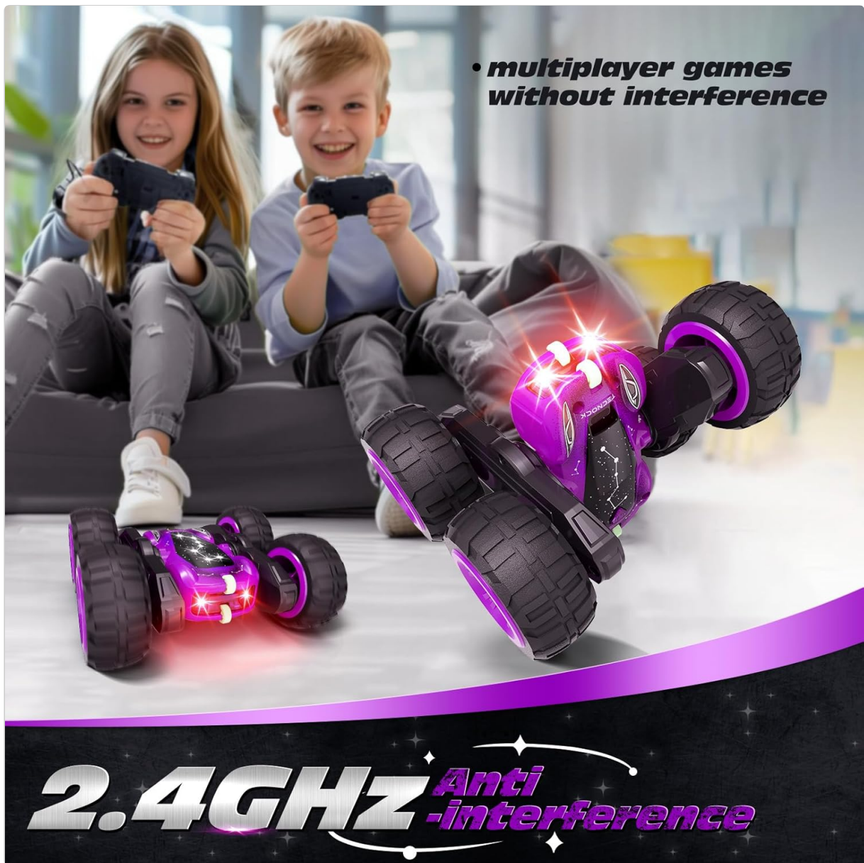
Figure 6: Multiple Tecnock RC cars can be operated simultaneously without interference.

Your browser does not support the video tag.