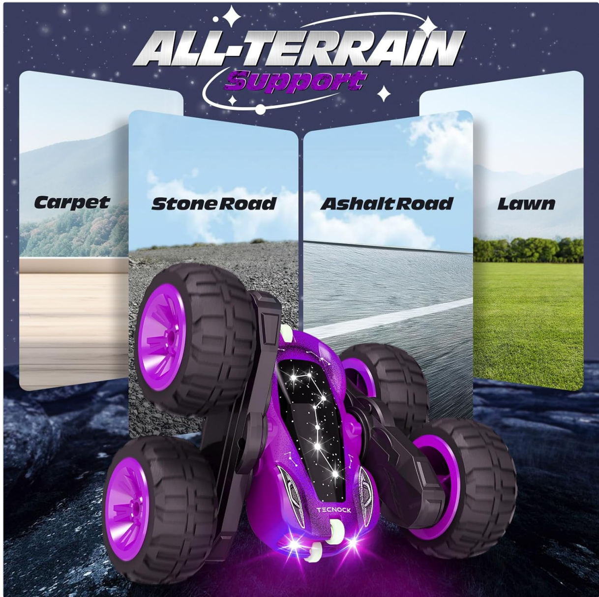
Figure 5: The RC car is capable of operating on various terrains.