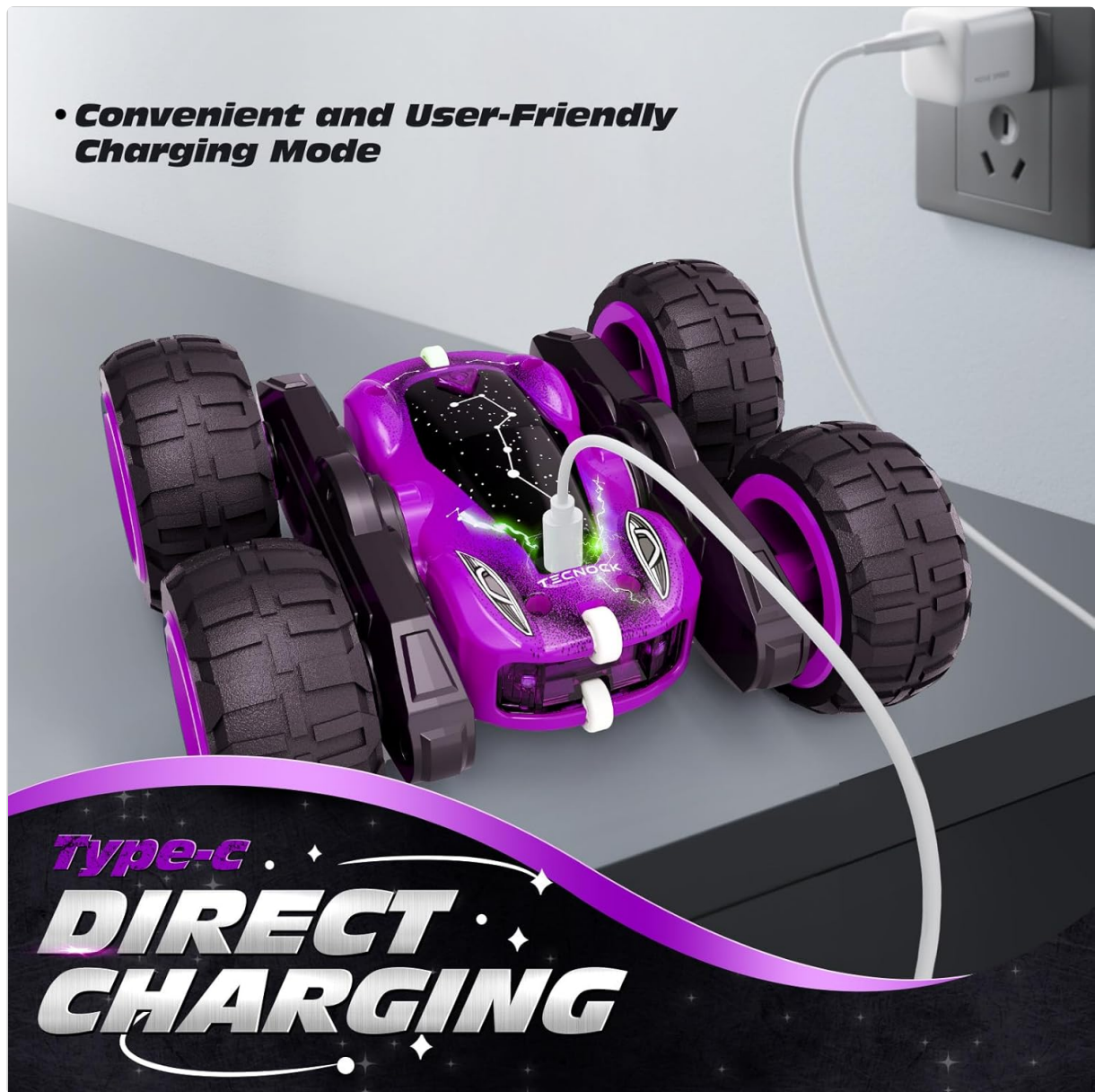
Figure 3: Connecting the USB-C charging cable to the RC car.