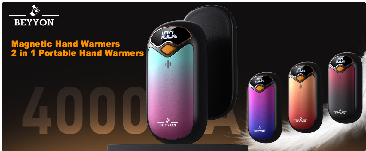
Image: The magnetic feature of the hand warmers, demonstrating how they can snap together or be used separately.