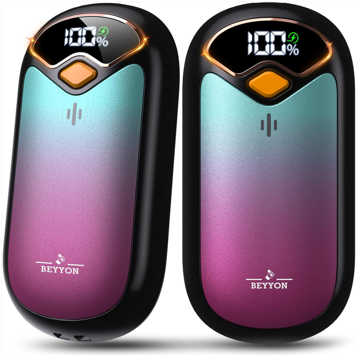
Image: Two BEYYON rechargeable hand warmers, Aurora(Mini) color, displaying their LED screens and magnetic connection points.