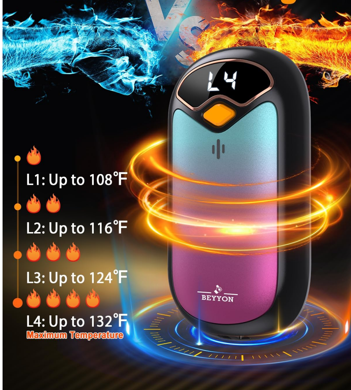
Image: Visual representation of the quick heating capability and the temperature ranges for each of the four heat settings.