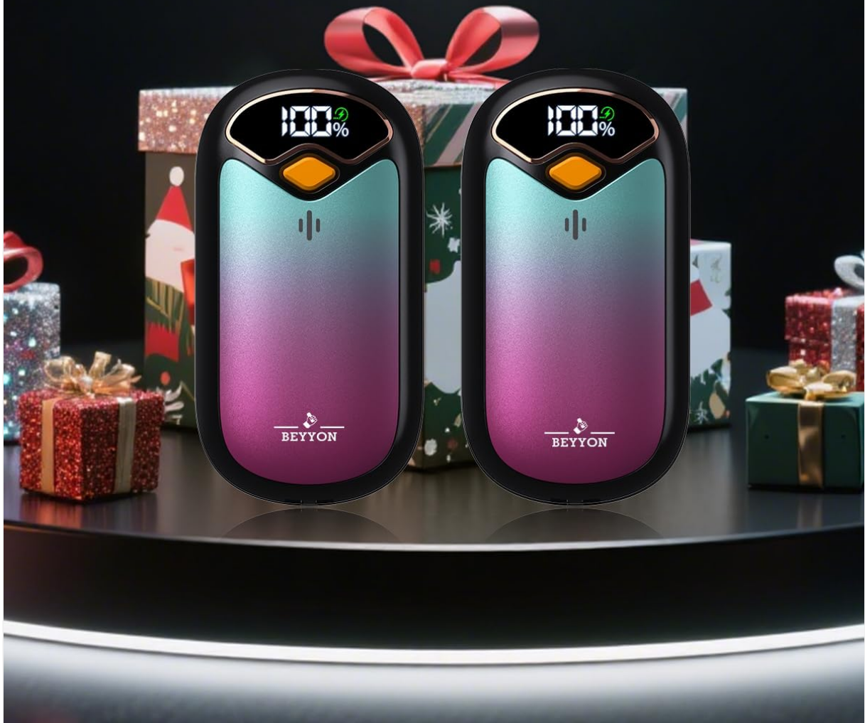
Image: The complete package contents of the BEYYON hand warmers, neatly arranged.