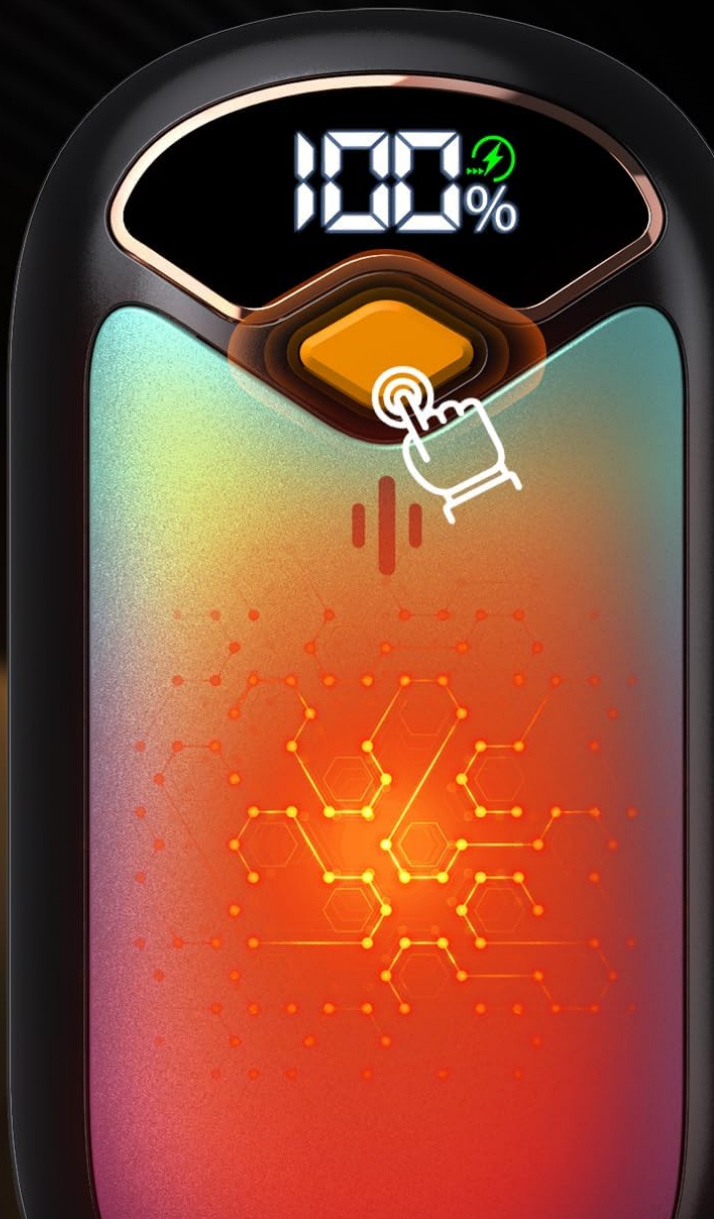
Image: A detailed view of the LED display, indicating battery level and the main control button.