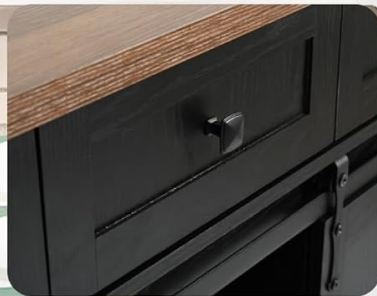
3 Large Drawers

Overview of the kitchen island's storage capabilities, including adjustable shelves behind sliding barn doors and three spacious drawers.