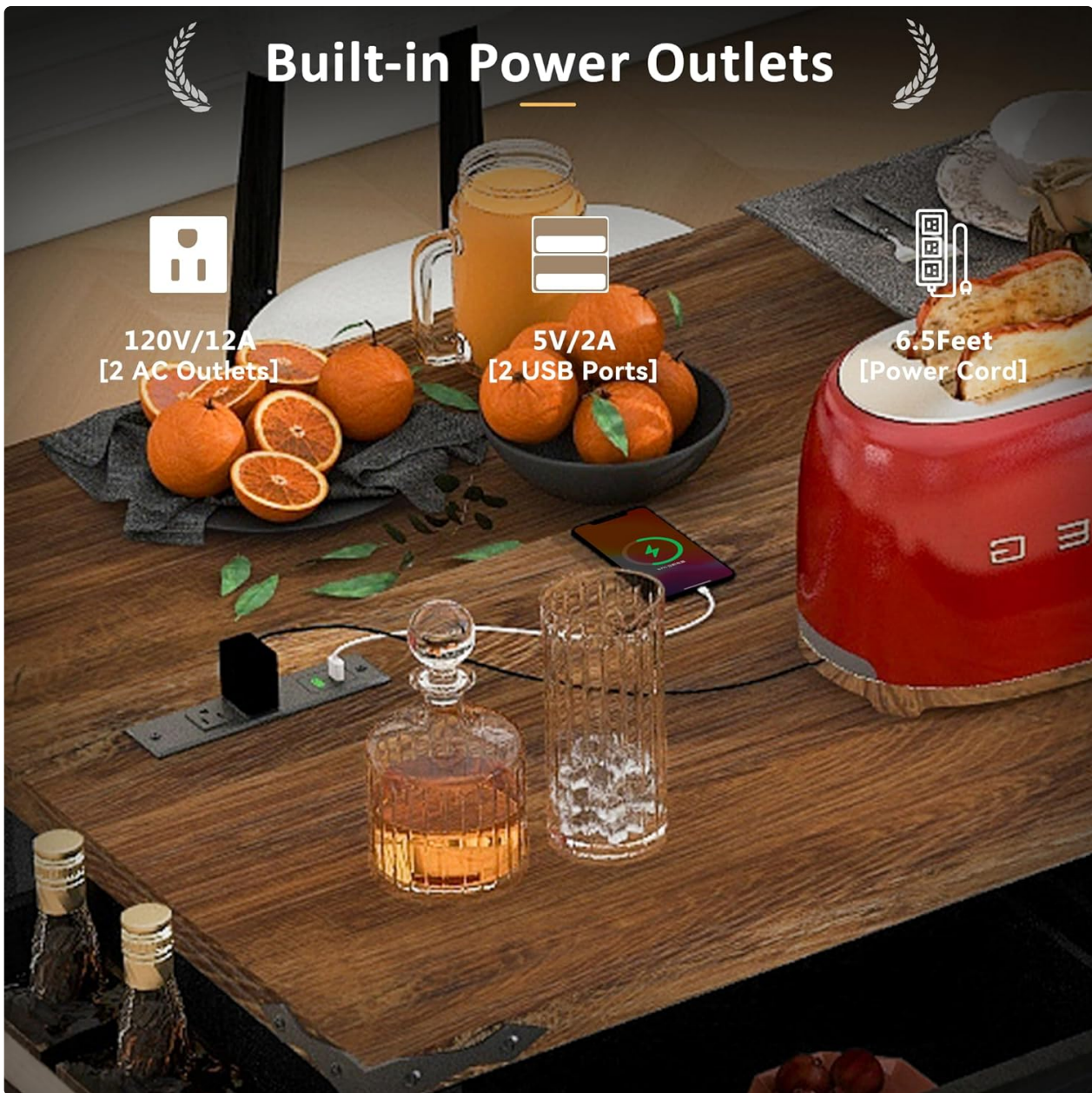
A close-up of the built-in power strip, featuring two AC outlets and two USB ports for convenient appliance use.