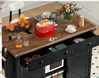
47" W Countertop