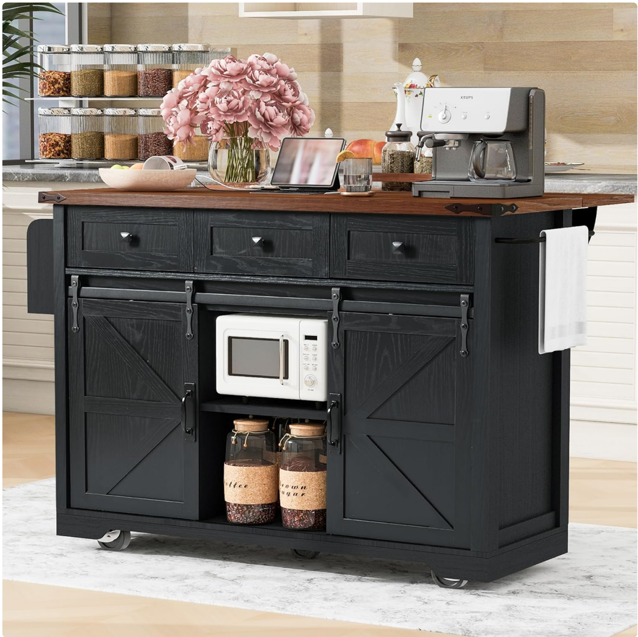
The cloblane 53.7 inch Mobile Kitchen Island, showcasing its design and functionality with the drop leaf extended.