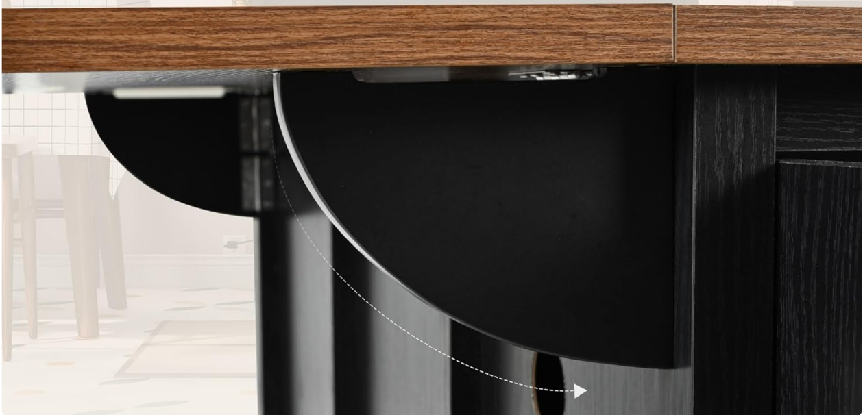
Diagram demonstrating how the drop leaf countertop can be extended to increase workspace.