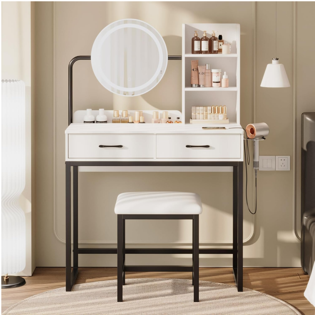
Image: The Dowinx Vanity Desk, featuring a white desktop, black metal frame, LED lighted mirror, and a matching white stool.