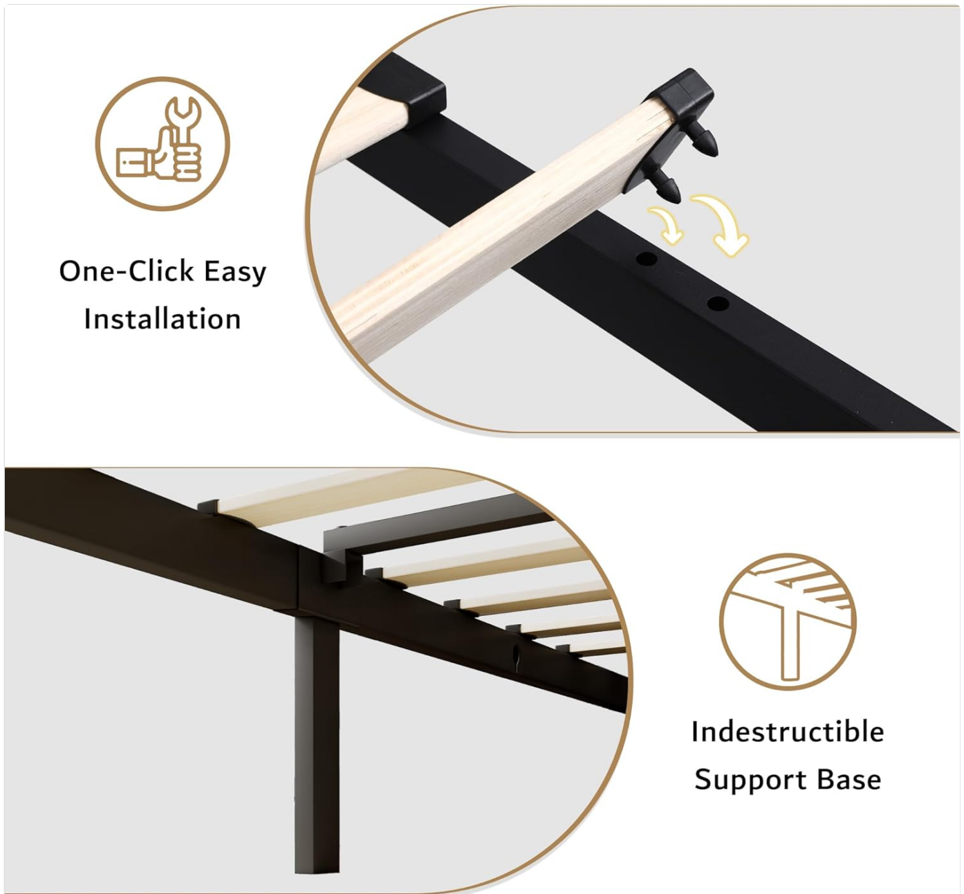
Figure 1: Illustration of the one-click easy installation for slats and the indestructible support base.