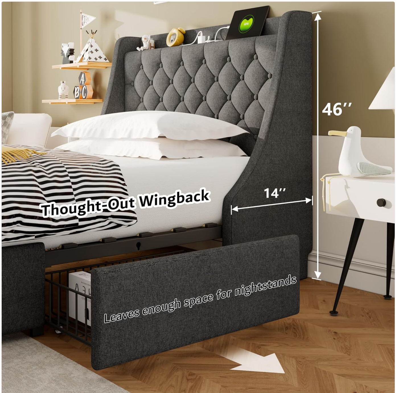
Figure 5: Thought-out wingback design leaving space for nightstands.