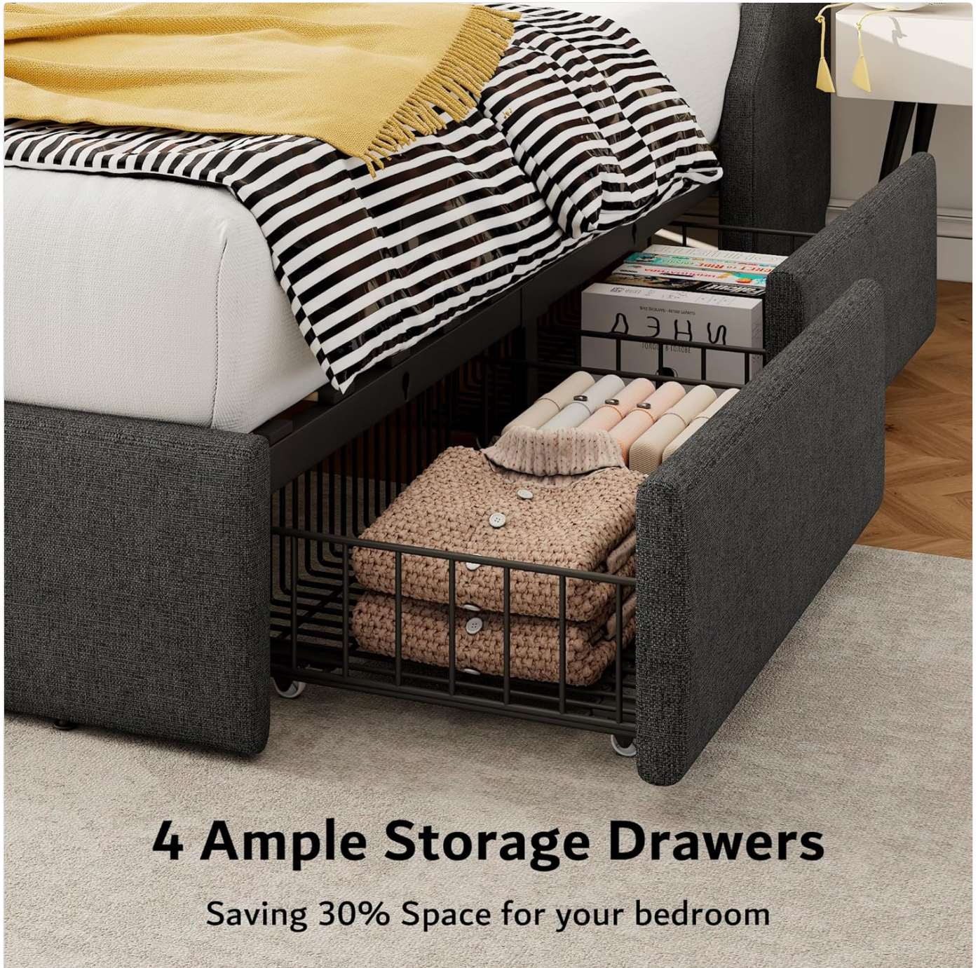
Figure 2: Four ample storage drawers for optimizing bedroom space.