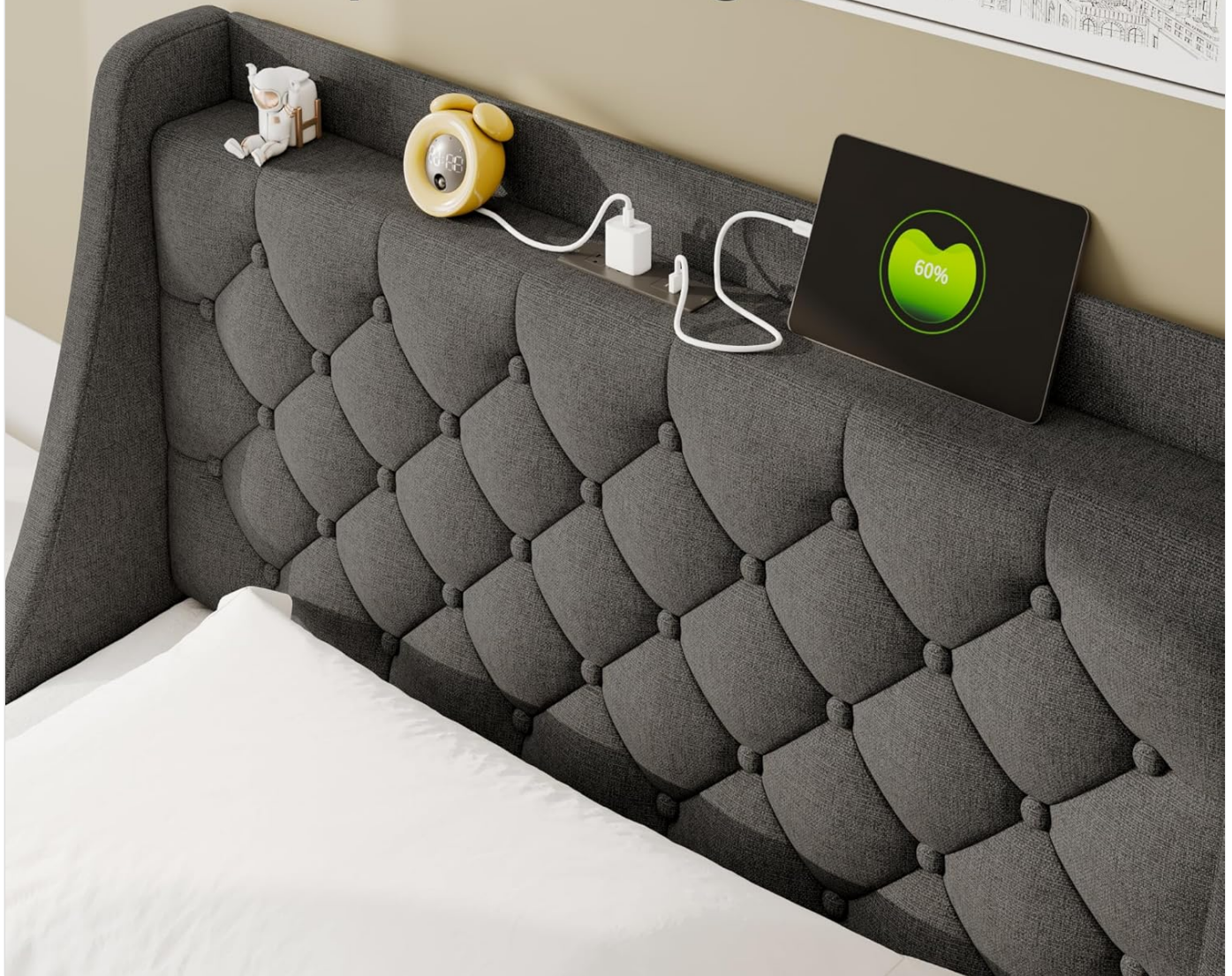
Figure 3: Fast charging Type-C and outlets integrated into the headboard.