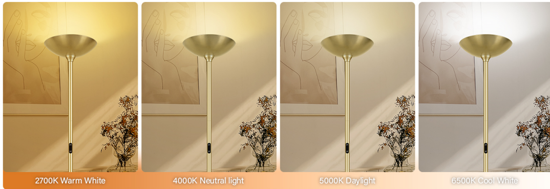
Image 6.8: The lamp demonstrating the stepless color temperature feature, transitioning from 2700K Warm White to 6500K Cool White.