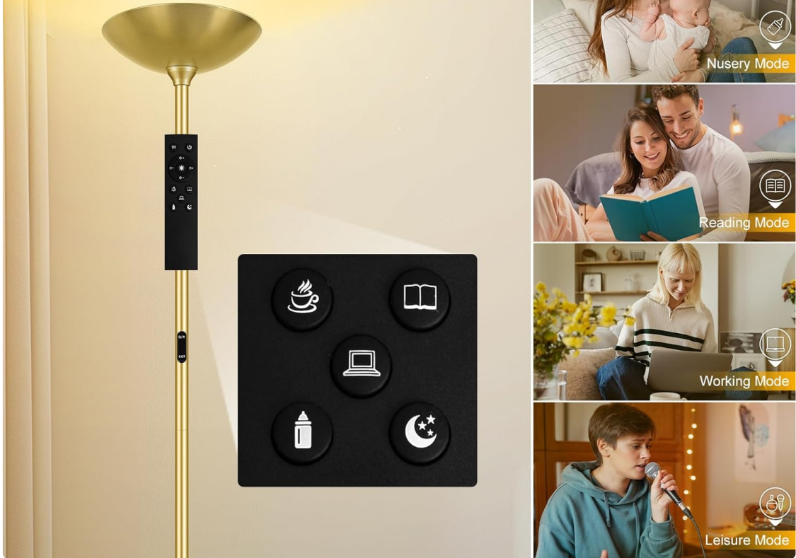
Image 6.3: An illustration of the five distinct lighting modes available, each represented by a unique symbol on the remote control.