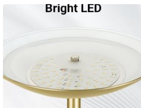
Image 4.2: A close-up view of the integrated bright LED panel within the lamp head.