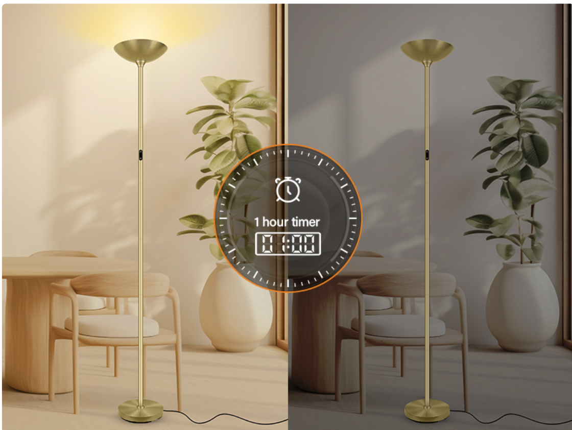
Image 6.5: The lamp shown with an overlay indicating the activation of the 1-hour timer function.