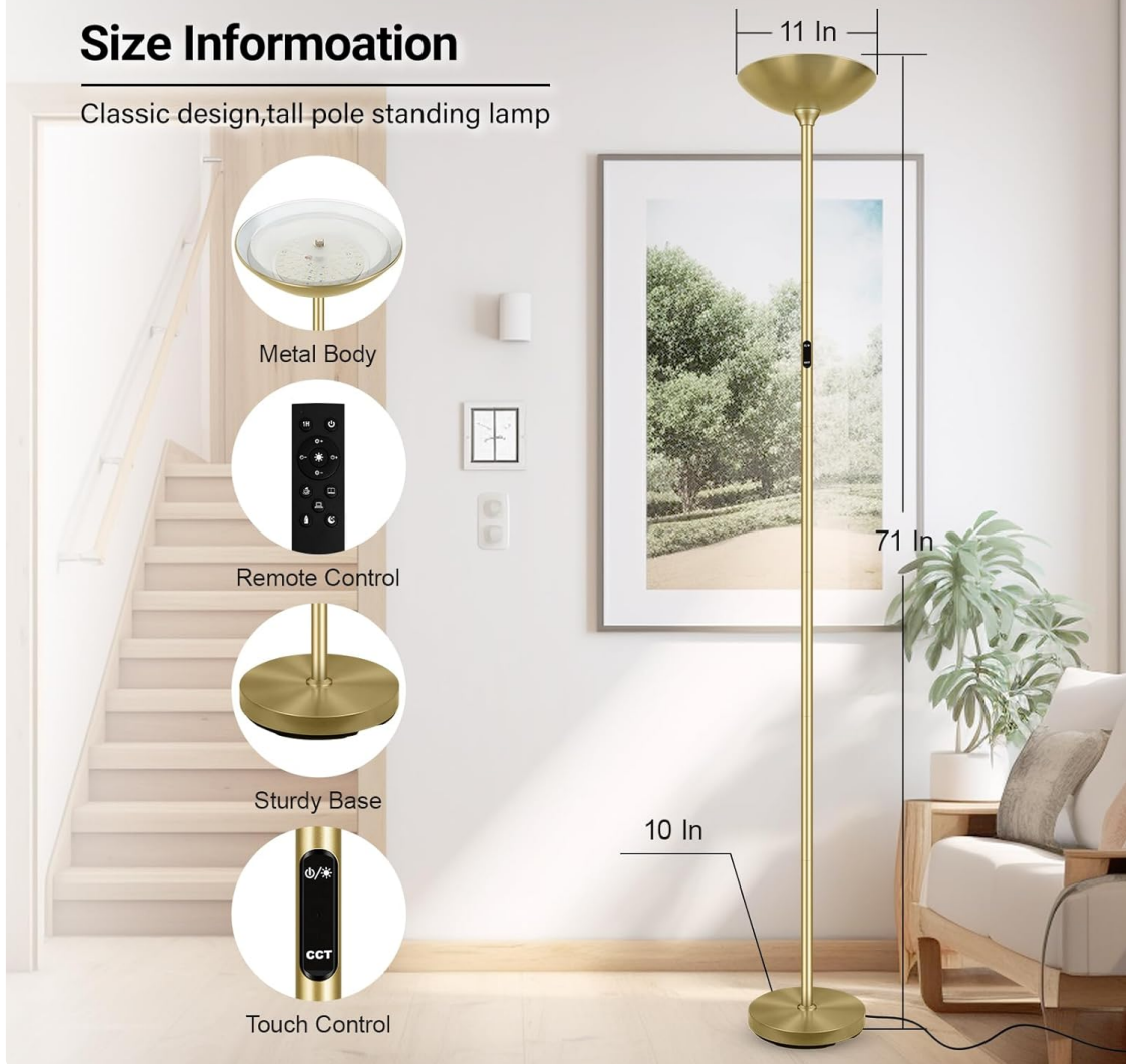
Image 4.1: An illustration detailing the lamp's dimensions (71 inches tall, 10-11 inches head/base diameter) and highlighting its metal body, remote control, sturdy base, and touch control features.