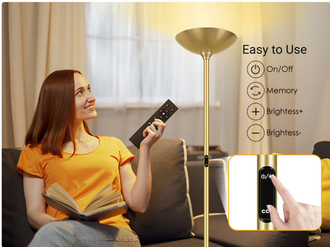
Image 6.2: A user demonstrating the use of both the remote control and the touch control panel on the lamp.