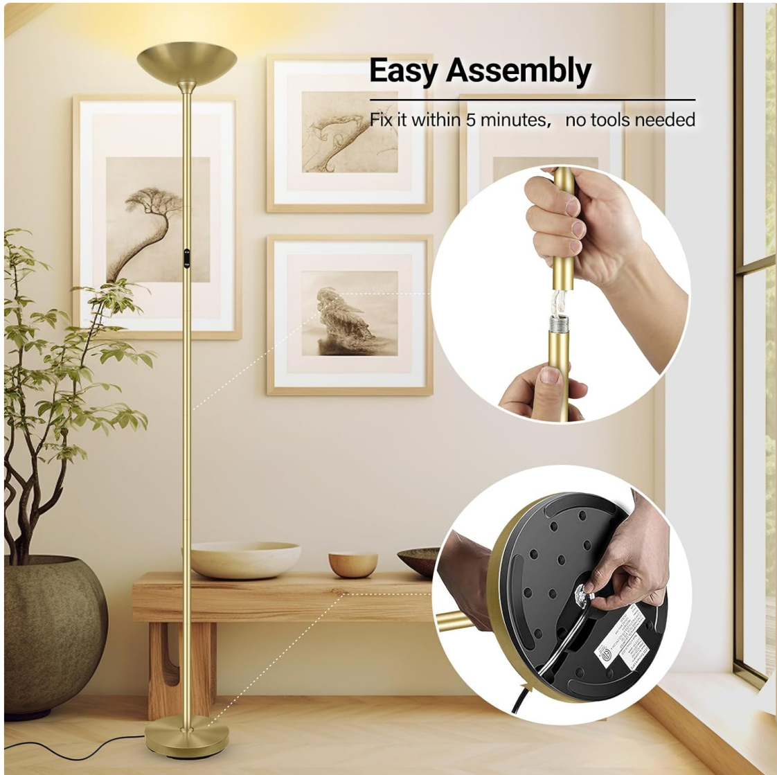
Image 5.1: Visual guide demonstrating the simple assembly process, including connecting pole sections and securing the base.