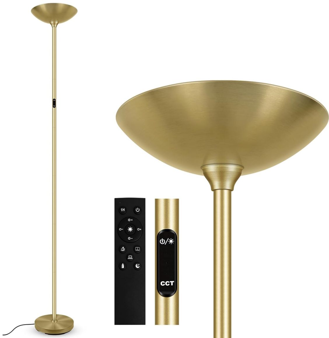
Image 1.1: The BoostArea Dimmable Floor Lamp in gold, showcasing its sleek design and included remote control.