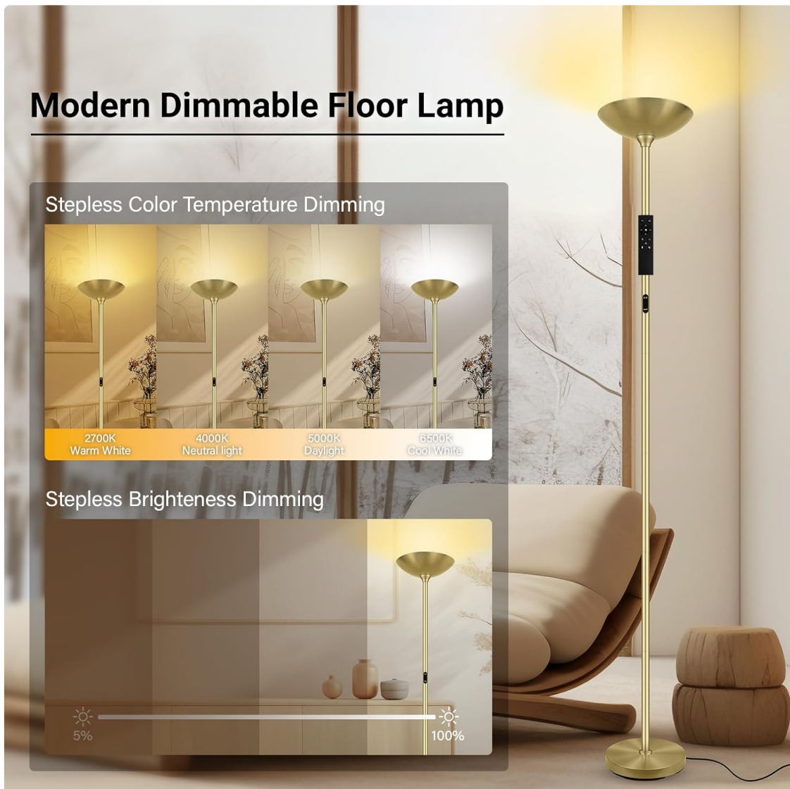
Image 6.7: A graphic illustrating the range of stepless color temperature adjustments from 2700K (Warm White) to 6500K (Cool White), and stepless brightness dimming from 5% to 100%.

The lamp offers continuous adjustment for both brightness and color temperature, allowing for precise customization of your lighting environment.