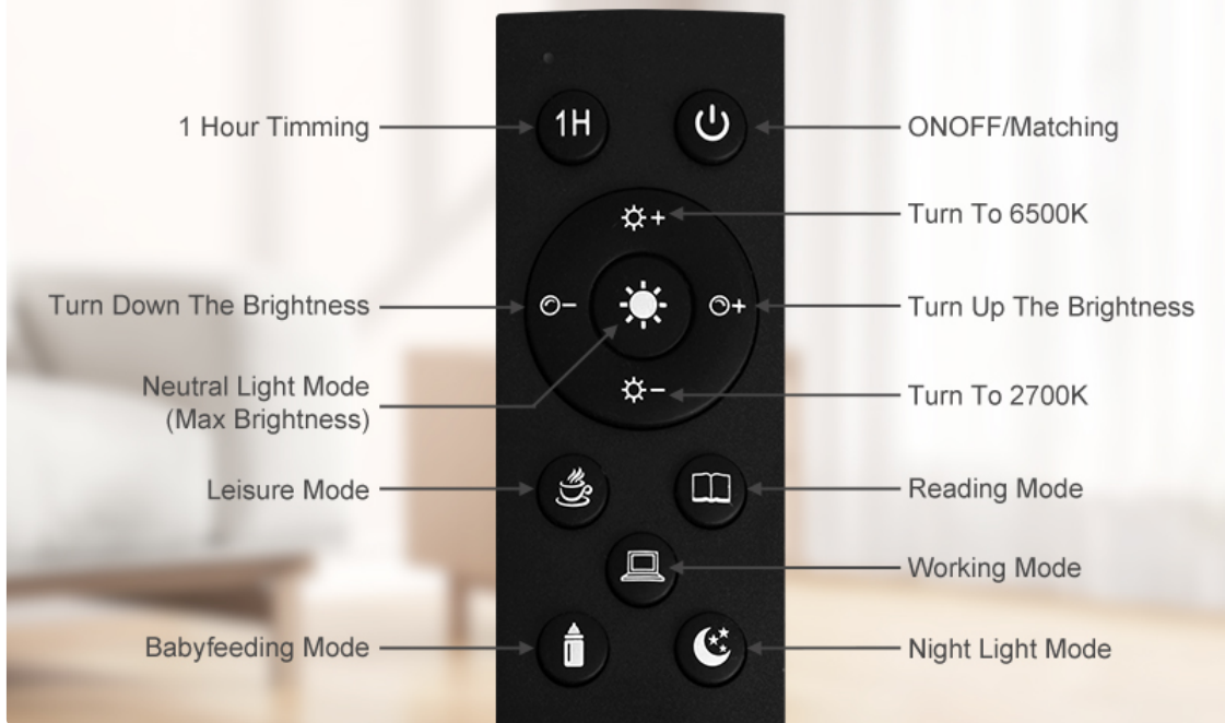
Image 6.4: A comprehensive diagram labeling each button on the remote control and its corresponding function, including 1-hour timing, ON/OFF/Matching, brightness adjustment, color temperature presets, and various lighting modes.