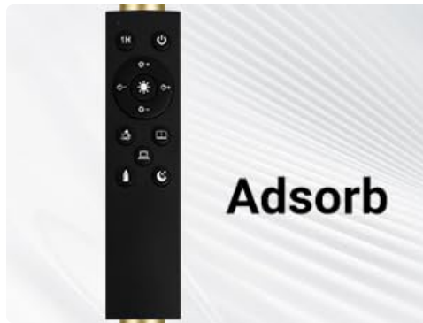
Image 6.6: The remote control shown magnetically adhering to the lamp pole for convenient storage.