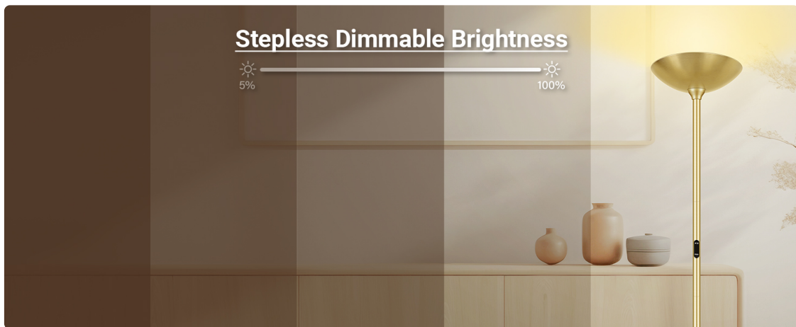
Image 6.9: The lamp illustrating the stepless dimmable brightness feature, ranging from 5% to 100% illumination.