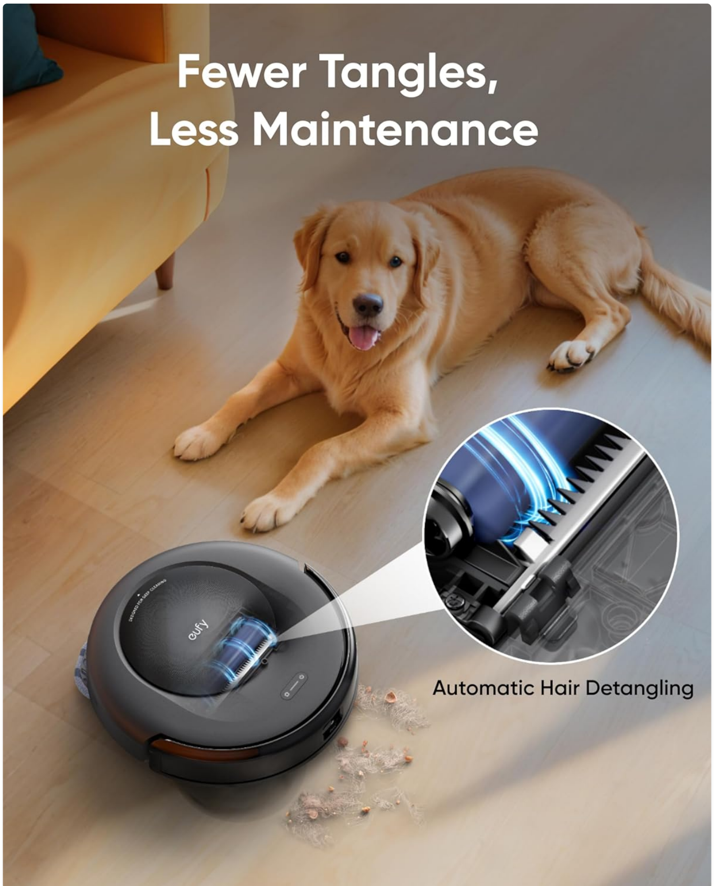
Automatic Hair Detangling

Image: The eufy Robot Vacuum Omni C20 with a golden retriever, illustrating the automatic hair detangling feature of the Pro-Detangle Comb.