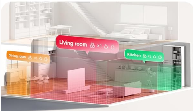
Personalised Cleaning Modes

Control your C20 with the eufy app for maximum flexibility