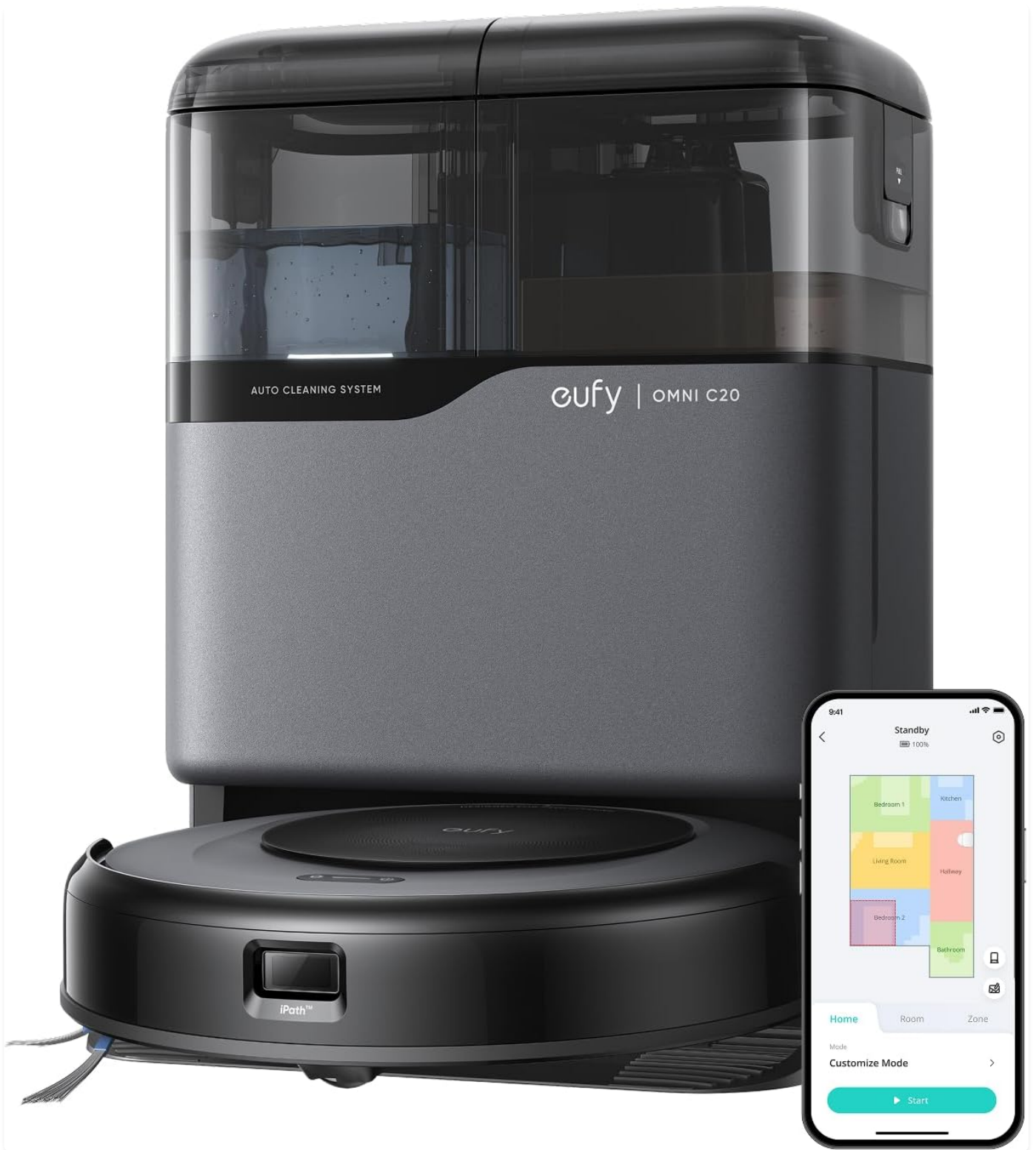
Image: The eufy Robot Vacuum Omni C20 with its All-in-One Station and a smartphone displaying the control app interface.