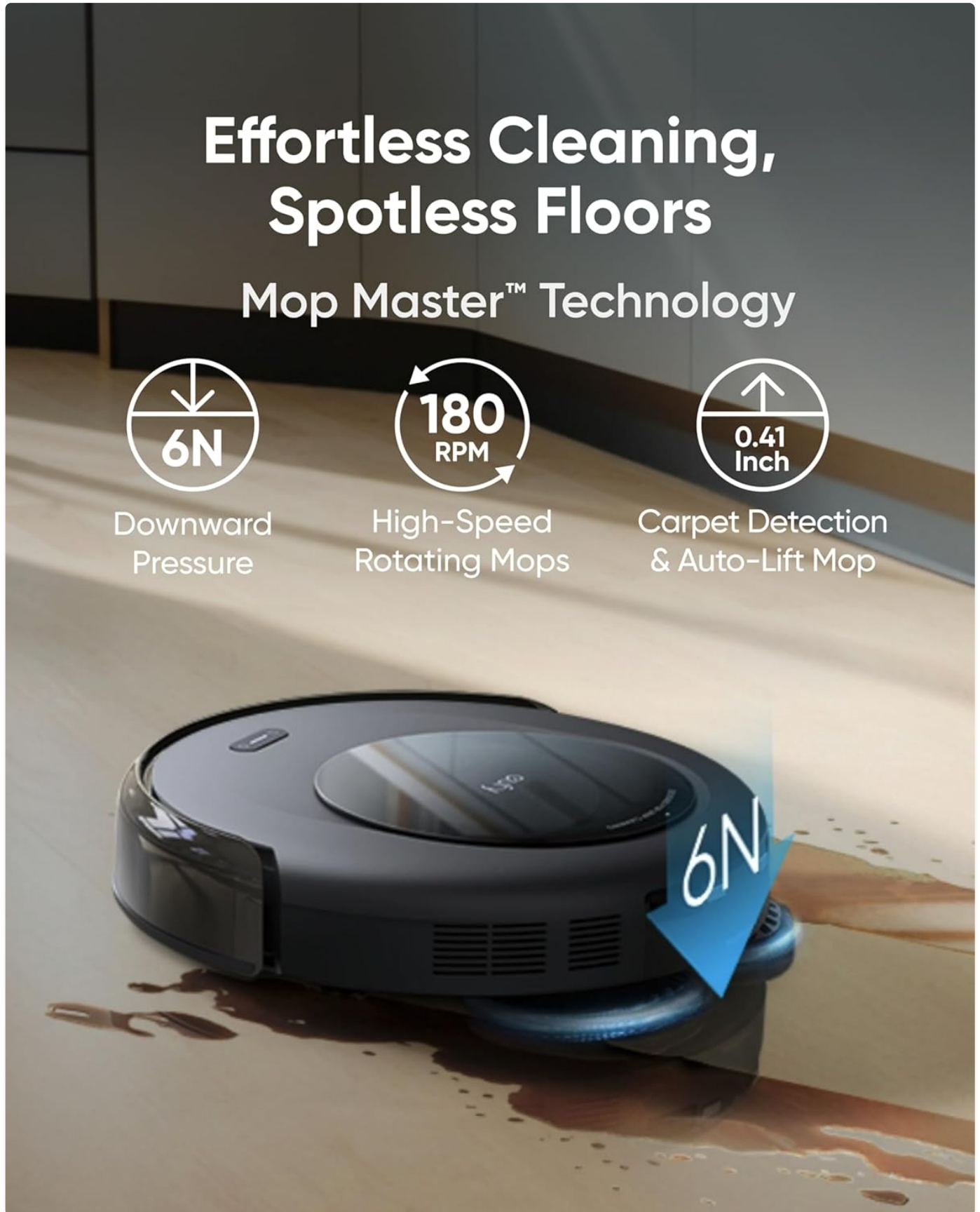
Image: Visual representation of Mop Master Technology with icons for Downward Pressure, High-Speed Rotating Mops, and Carpet Detection & Auto-Lift Mop.