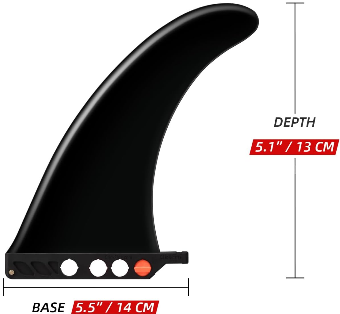
Image 5: Diagram illustrating the base and depth dimensions of the THURSO SURF SUP Click Fin.