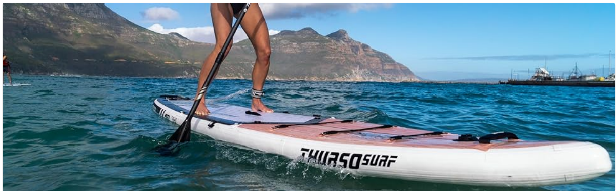
Image 4: A paddleboarder enjoying the water, demonstrating the fin in use for stability and tracking.