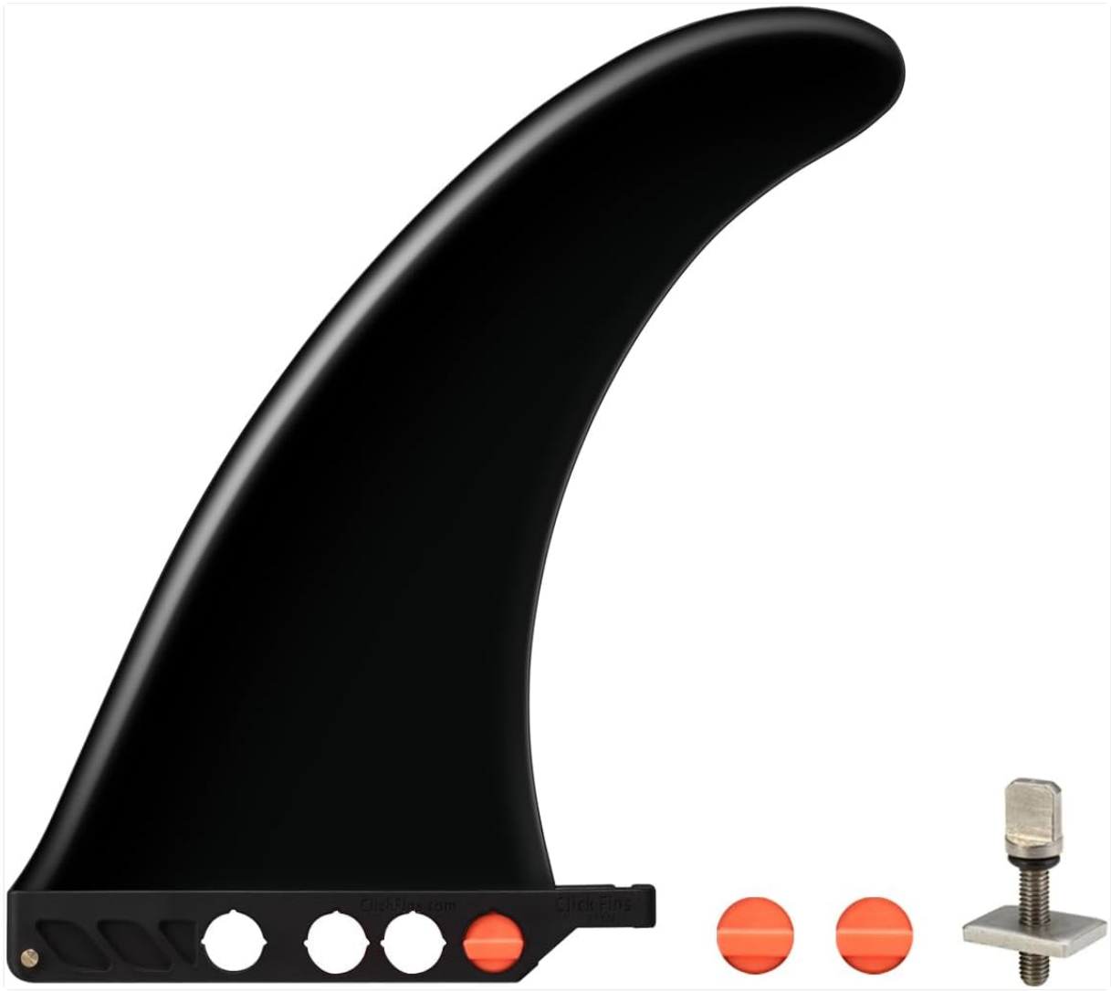
Image 1: The THURSO SURF SUP Click Fin, showing its design and the integrated retention mechanism.