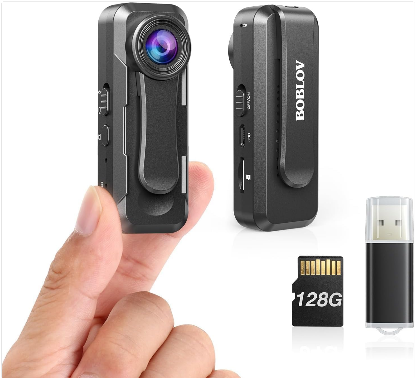
Image: The BOBLOV W1 Body Camera, showcasing its compact size, along with the included 128GB microSD card and USB card reader.