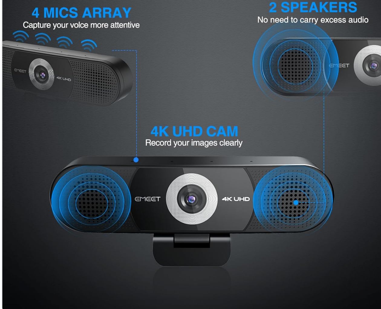
Figure 2.2: All-in-One Video Conferencing Solution. This diagram illustrates the integrated 4-microphone array, 2 speakers, and 4K UHD camera within the EMEET C980 PRO.