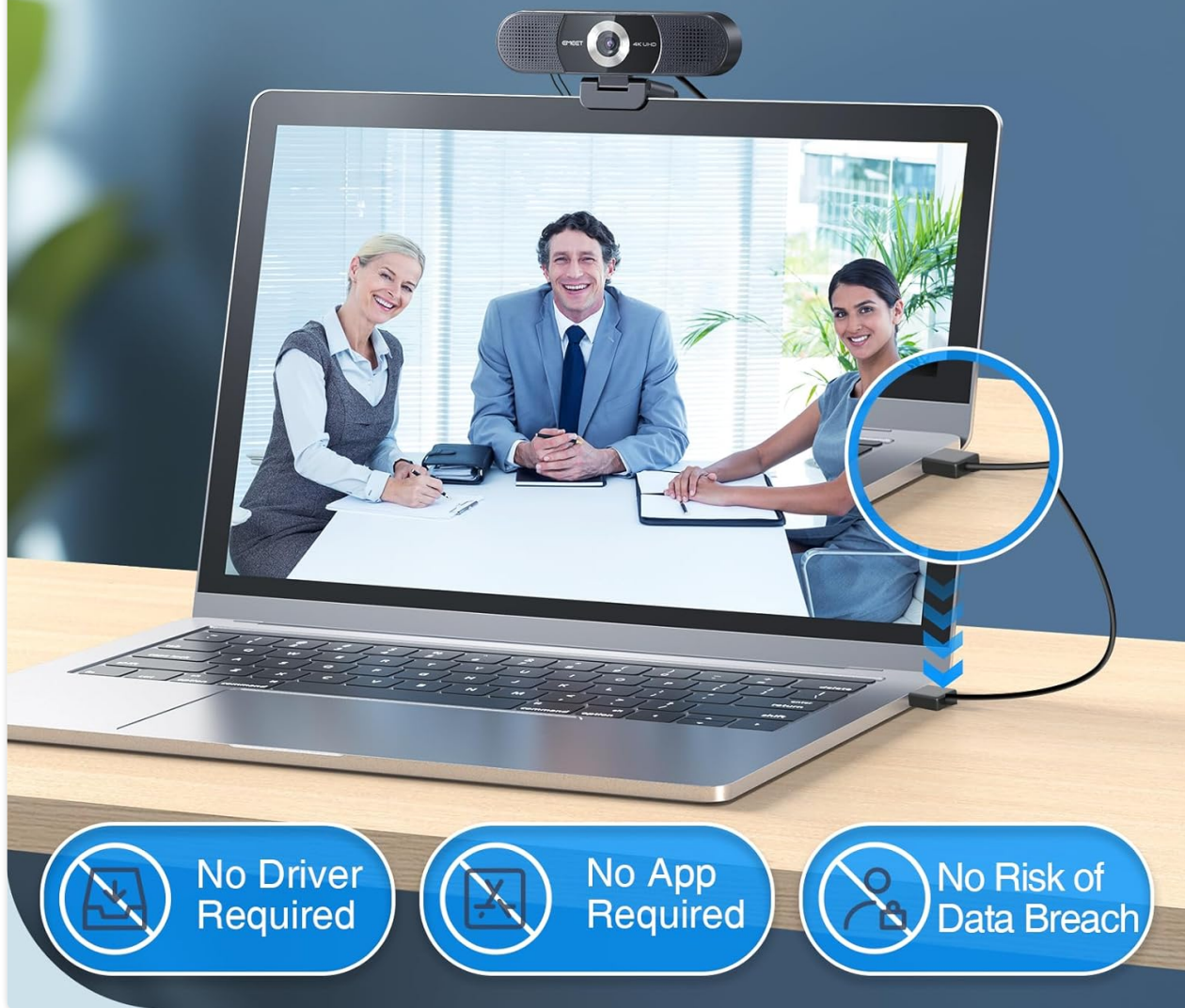
Figure 3.1: Flexible Multi-angle Shooting. The webcam is shown mounted on a laptop, demonstrating its adjustable stand for various viewing angles.