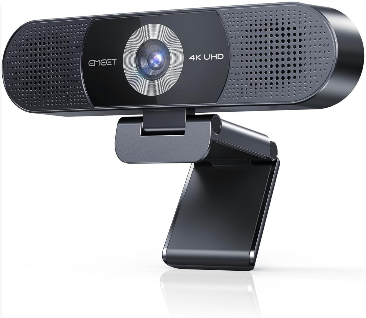
Figure 2.1: EMEET C980 PRO 4K Webcam, showcasing its sleek design and integrated components.