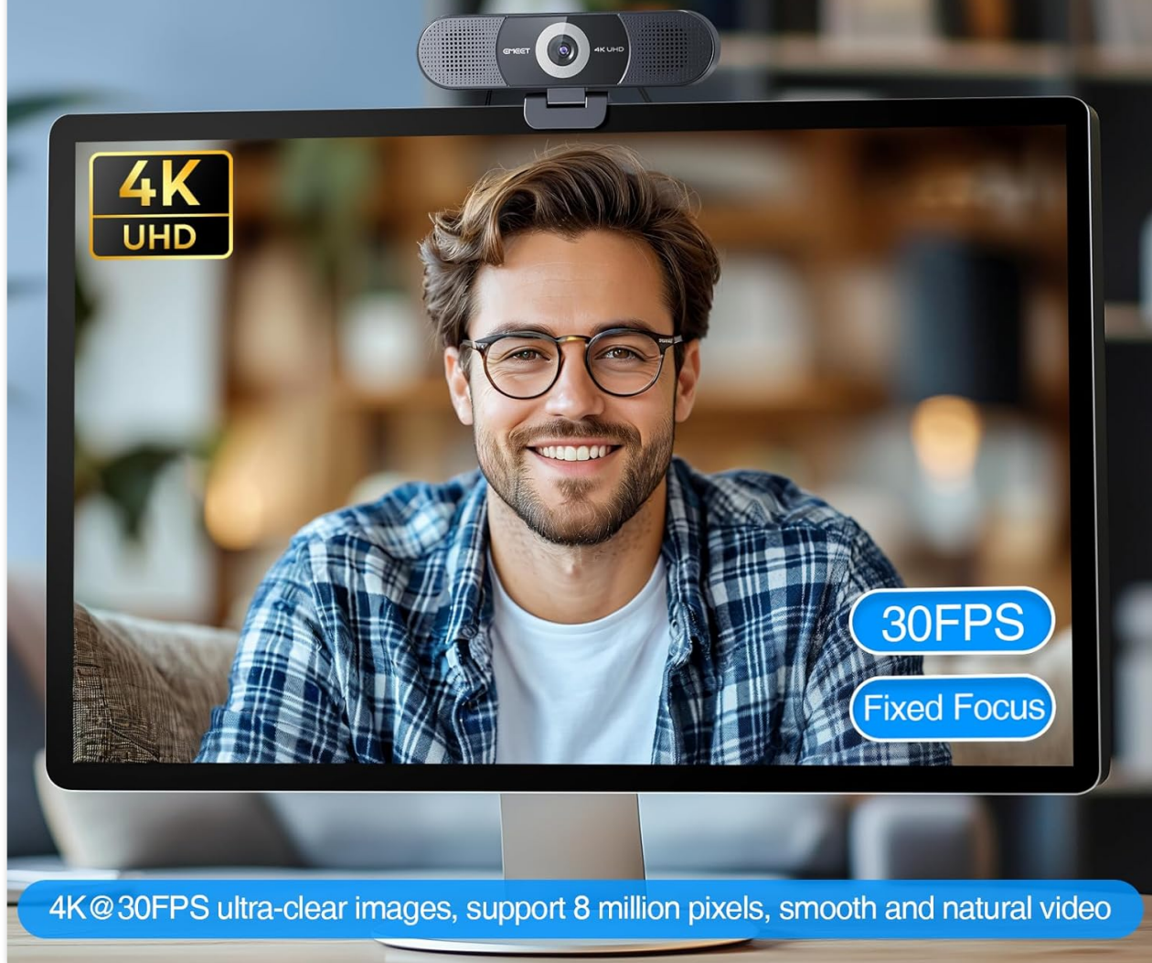
Figure 2.3: Crystal Clear 4K Experience. The image shows a user enjoying a clear video call, highlighting the 4K resolution at 30 frames per second with fixed focus.