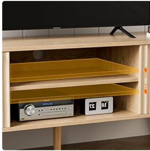
Image: Detail of the adjustable shelf, illustrating its three height options for flexible storage.