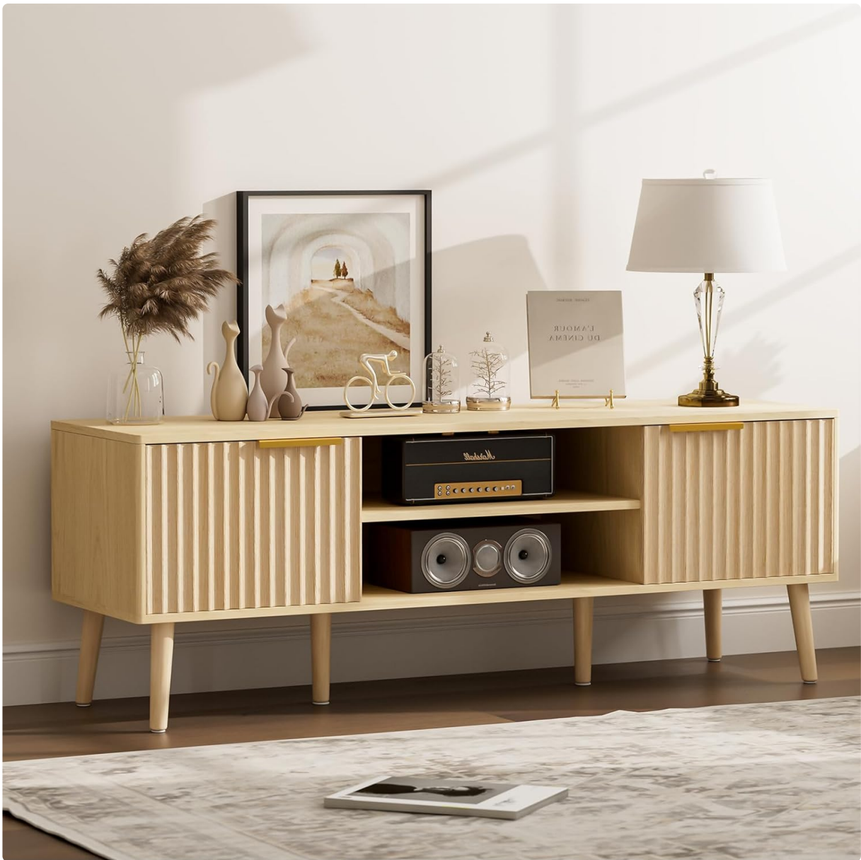
Image: The LCRBOL TV Stand in an oak finish, showcasing its fluted door cabinets and central open shelves, suitable for various living room setups.