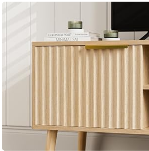
Image: A close-up view of the cabinet door, highlighting its unique waveform texture.