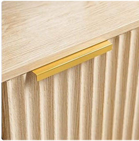
Image: A close-up demonstrating the smooth, curved corner design of the TV stand.