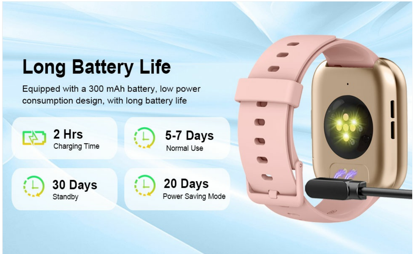
Image: Smart watch connected to its magnetic charging cable, illustrating the charging process and battery life.

Before first use, fully charge your Cillso T80 Smart Watch. Connect the provided charging cable to the magnetic charging points on the back of the watch and plug the USB end into a compatible power adapter (not included). A full charge typically takes approximately 1.5 to 2 hours.