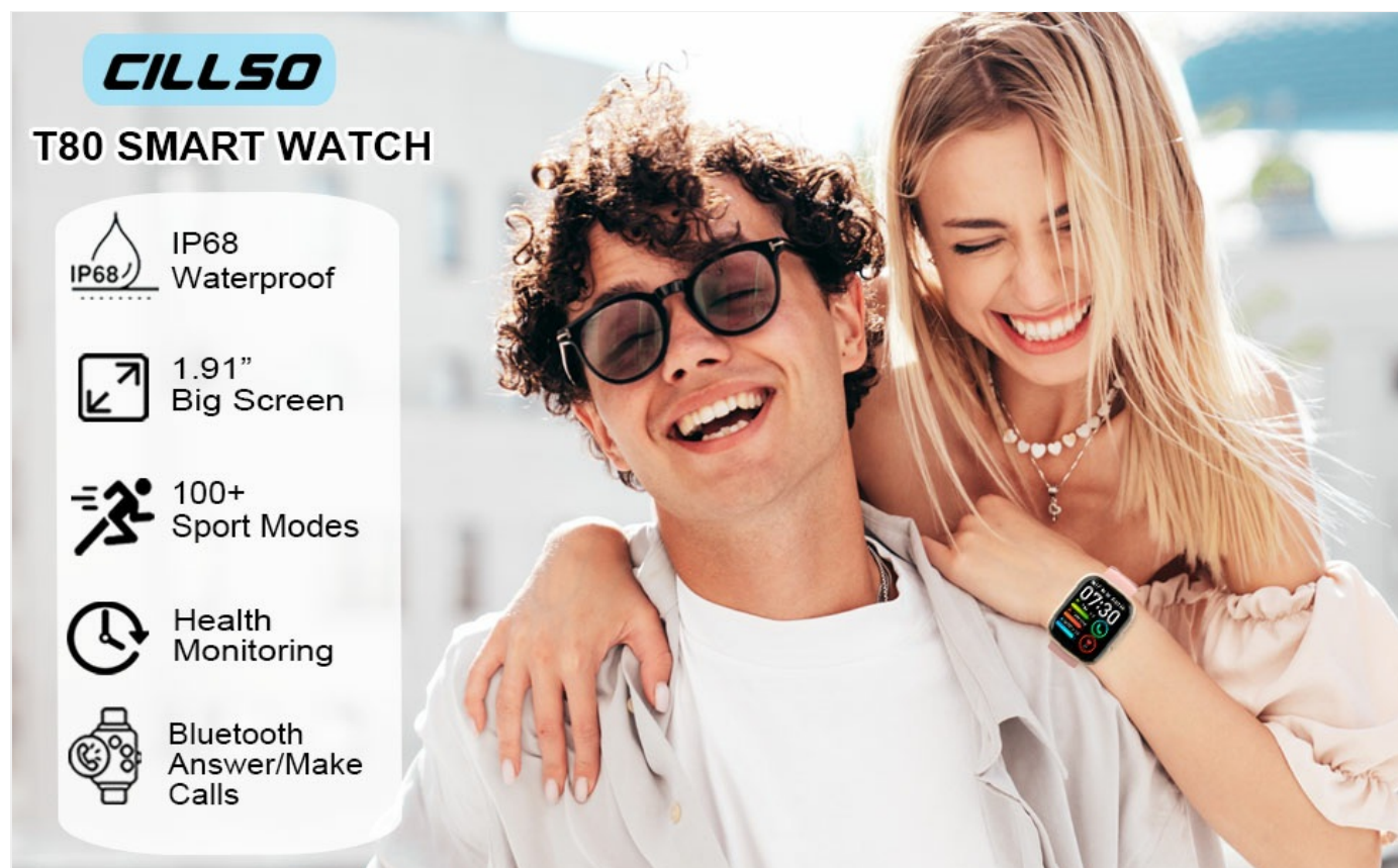
Image: Cillso T80 Smart Watch highlighting its main features including IP68 waterproofing, large screen, sport modes, health monitoring, and Bluetooth call functionality.

The Cillso T80 Smart Watch is a versatile wearable device designed for both men and women, offering a comprehensive suite of features for communication, fitness tracking, and health monitoring. With its 1.95-inch display and robust IP68 waterproof rating, it is suitable for various daily activities and sports. This manual provides detailed instructions for setting up, operating, and maintaining your smart watch.