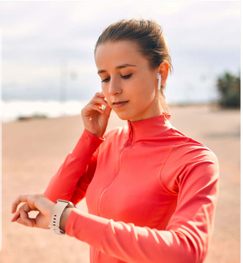
Image: User demonstrating the answer/make call feature on the smart watch.