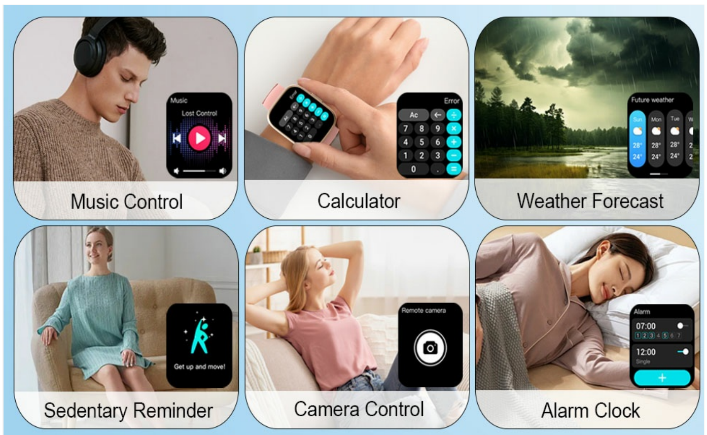
Image: Overview of additional smart watch functions including music control, calculator, weather, sedentary reminders, camera control, and alarm clock.