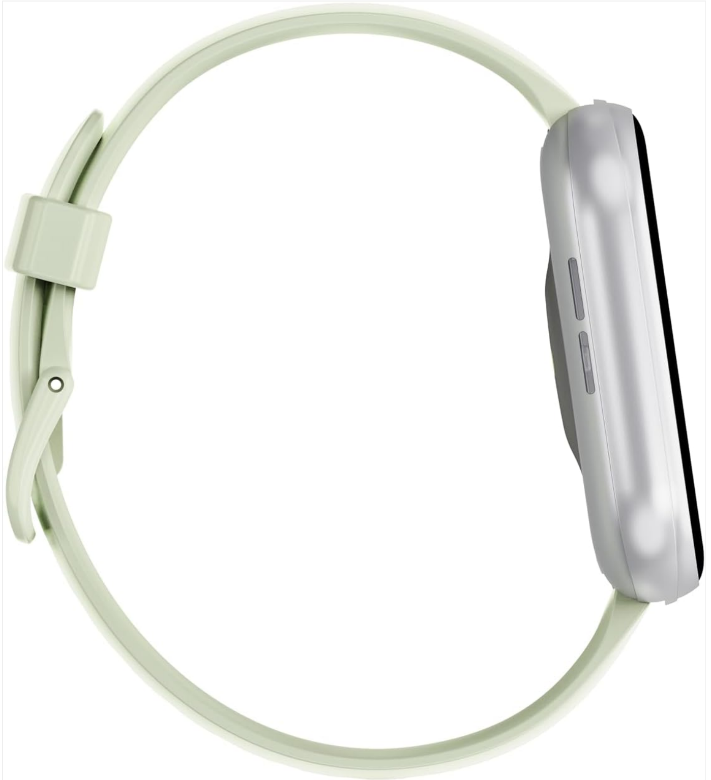
Side view showing the control buttons.