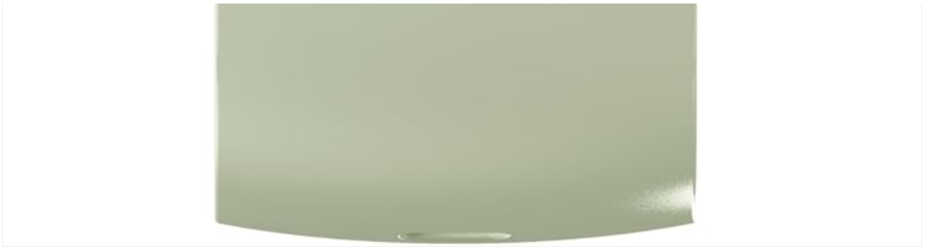
Front view of the watch display.