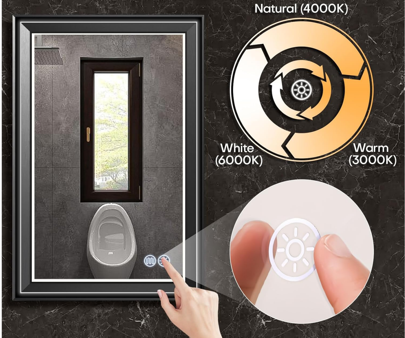
Image: Illustration of the mirror displaying different light colors: Warm (3000K), Natural (4000K), and White (6000K), with a finger touching the control button to adjust the color temperature.

Short touch to adjust color temperature.