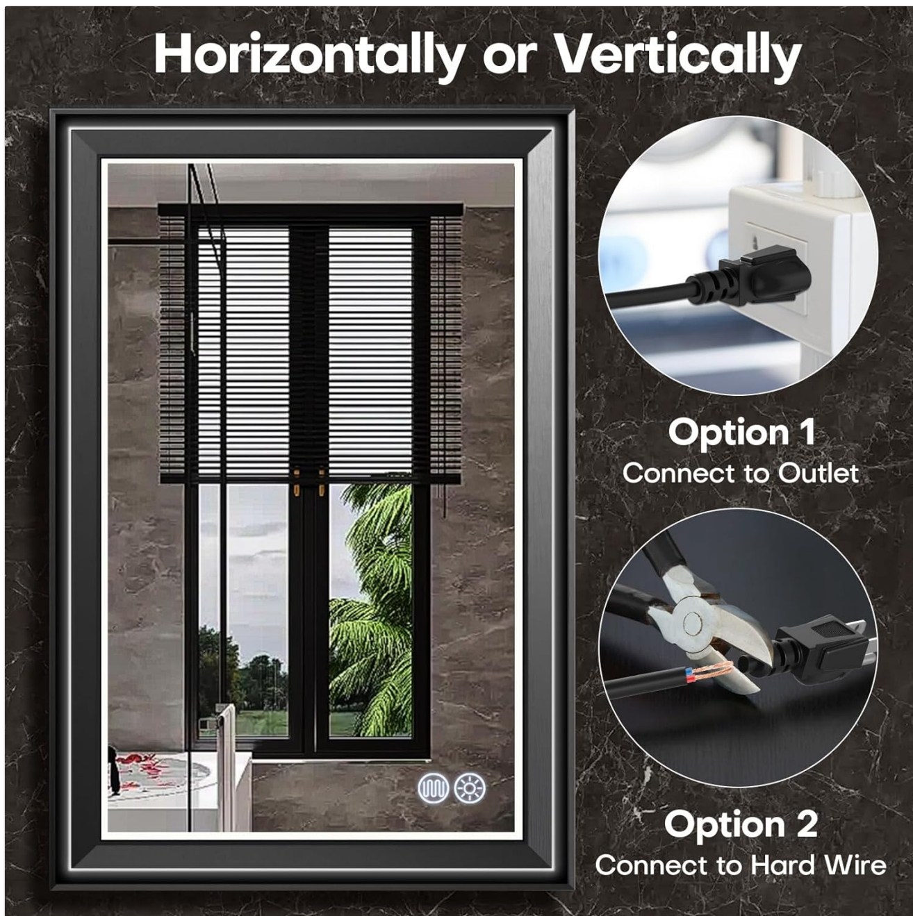
Image: Diagram illustrating the two power connection options: plugging into an outlet or hard-wiring by connecting to existing electrical wires, along with the mirror's ability to be mounted horizontally or vertically.