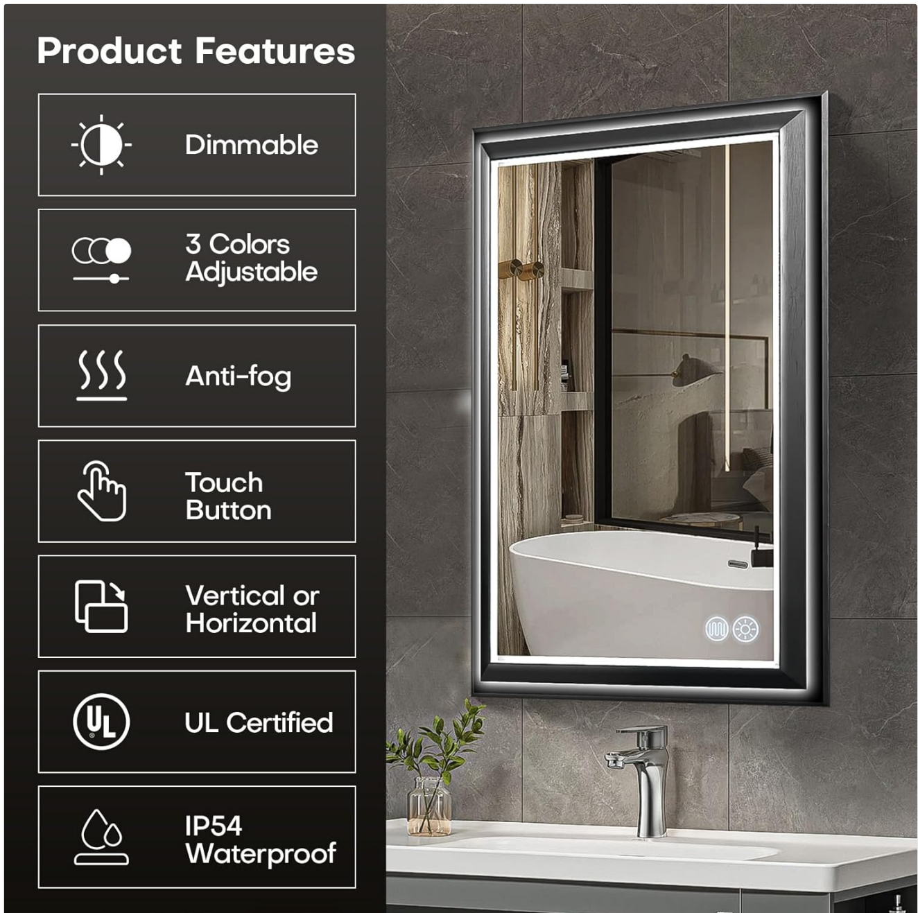
Image: Overview of the Memobarco LED Bathroom Mirror's key features, including dimmable lighting, 3 adjustable colors, anti-fog, touch button controls, vertical or horizontal mounting, UL certification, and IP54 waterproof rating.