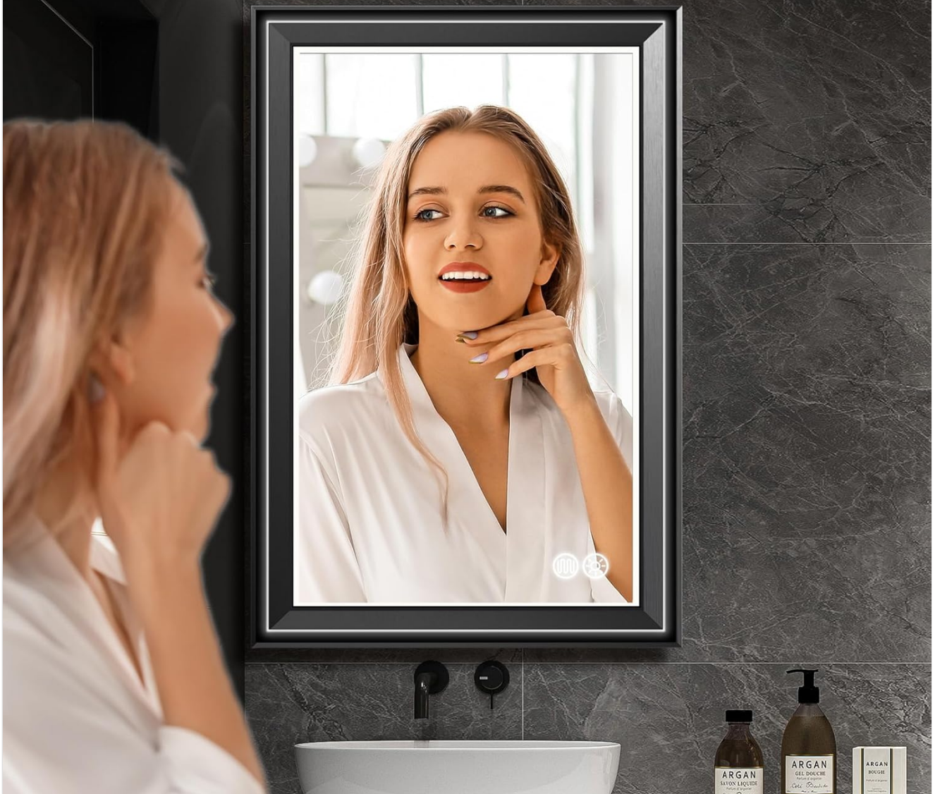
Image: A woman looking into the mirror, which is clear, with text indicating "One Touch to Anti-fog, Brighter and Clearer." The anti-fog button icon is visible on the mirror surface.