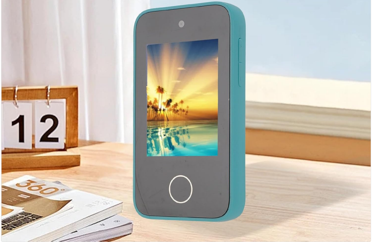
Image: The Sanpyl Digital Camera in a teal color, showing a vibrant image on its screen, highlighting its dual camera and autofocus capabilities.