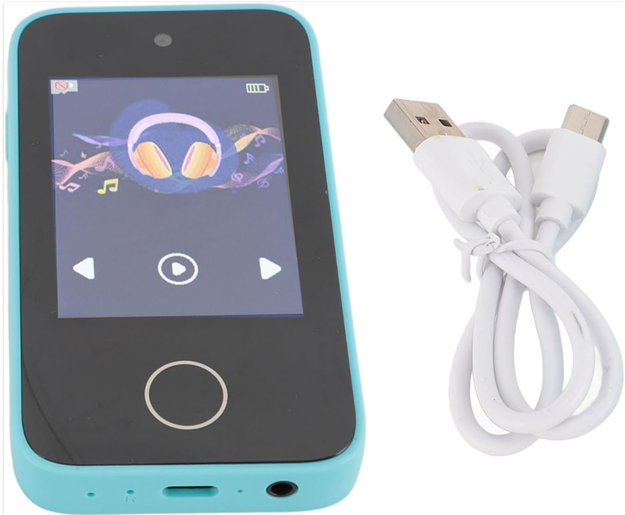
Image: The Sanpyl Digital Camera shown with its USB charging cable, illustrating the charging connection.

The camera comes with a built-in lithium-ion battery. Before first use, fully charge the camera using the provided charging data cable. Connect the cable to the camera's charging port and the other end to a USB power adapter (not included) or a computer USB port.