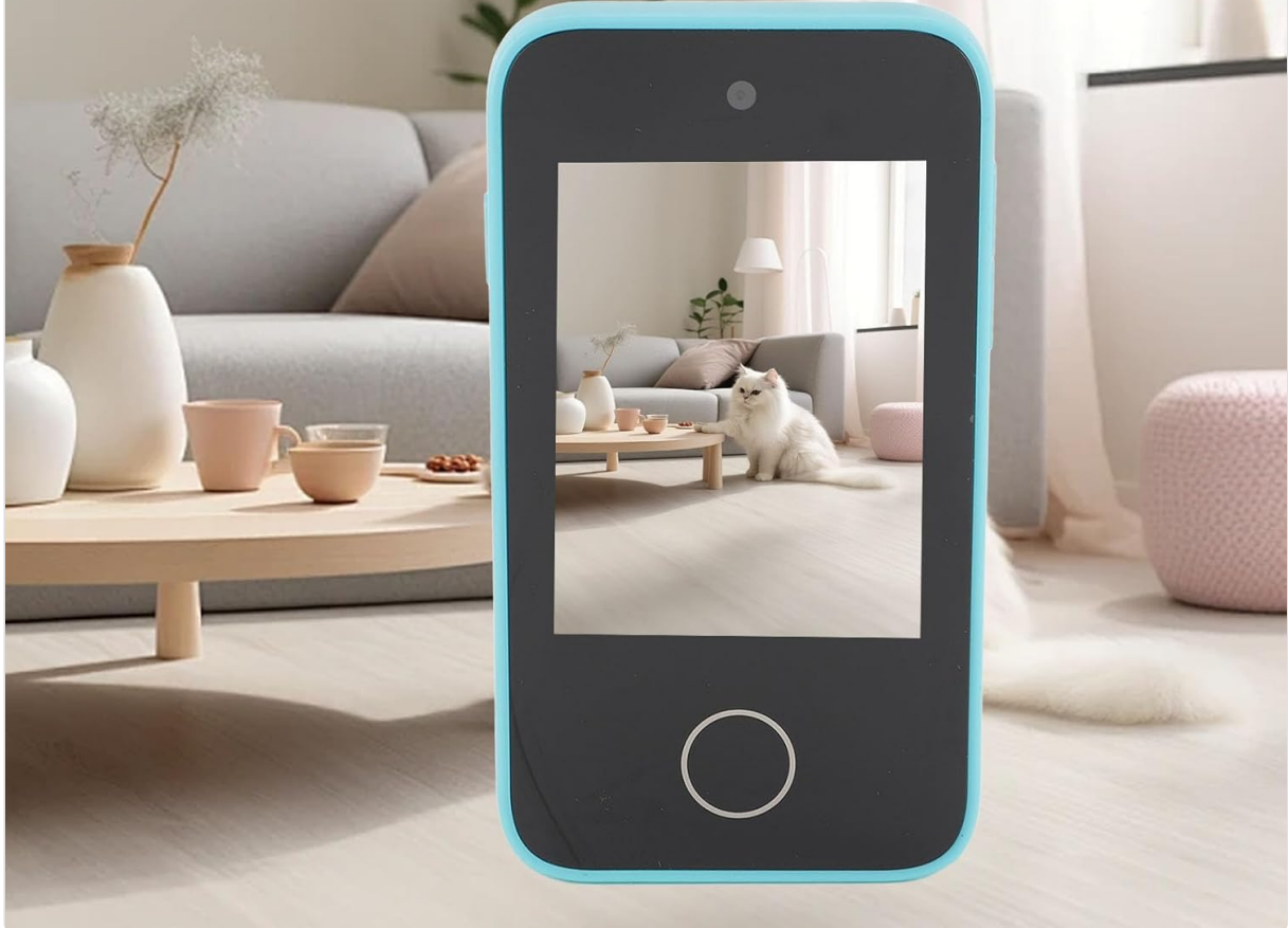
Image: The Sanpyl Digital Camera displaying a photo of a cat, with text overlays indicating its maximum image resolution of 48MP and maximum video resolution of 1080P.

Maximum Image Resolution: 48MP Maximum Video Resolution: 1080P