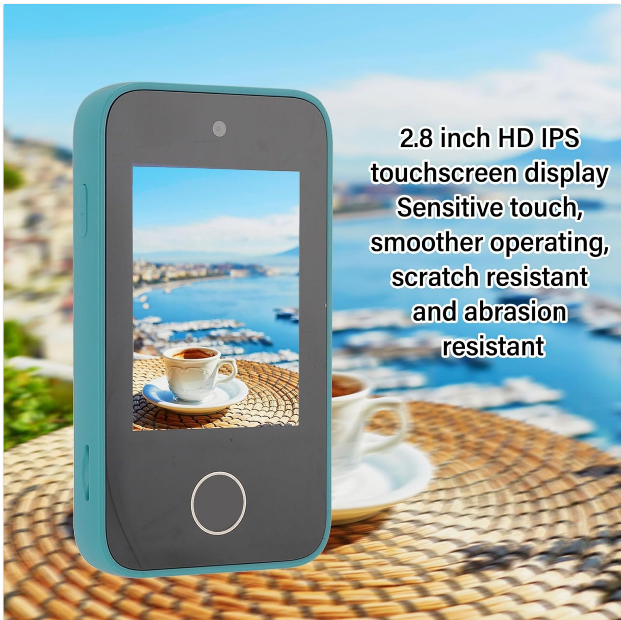
Image: The Sanpyl Digital Camera showcasing its 2.8-inch HD IPS touchscreen display with a scenic view, emphasizing its sensitive touch and scratch-resistant features.