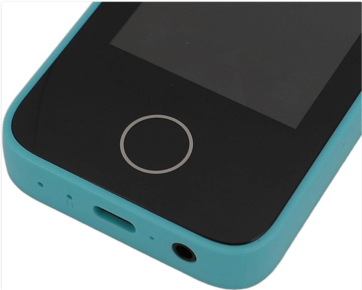
Image: A close-up view of the camera's bottom edge, showing the USB port and the slot for a Micro SD card.