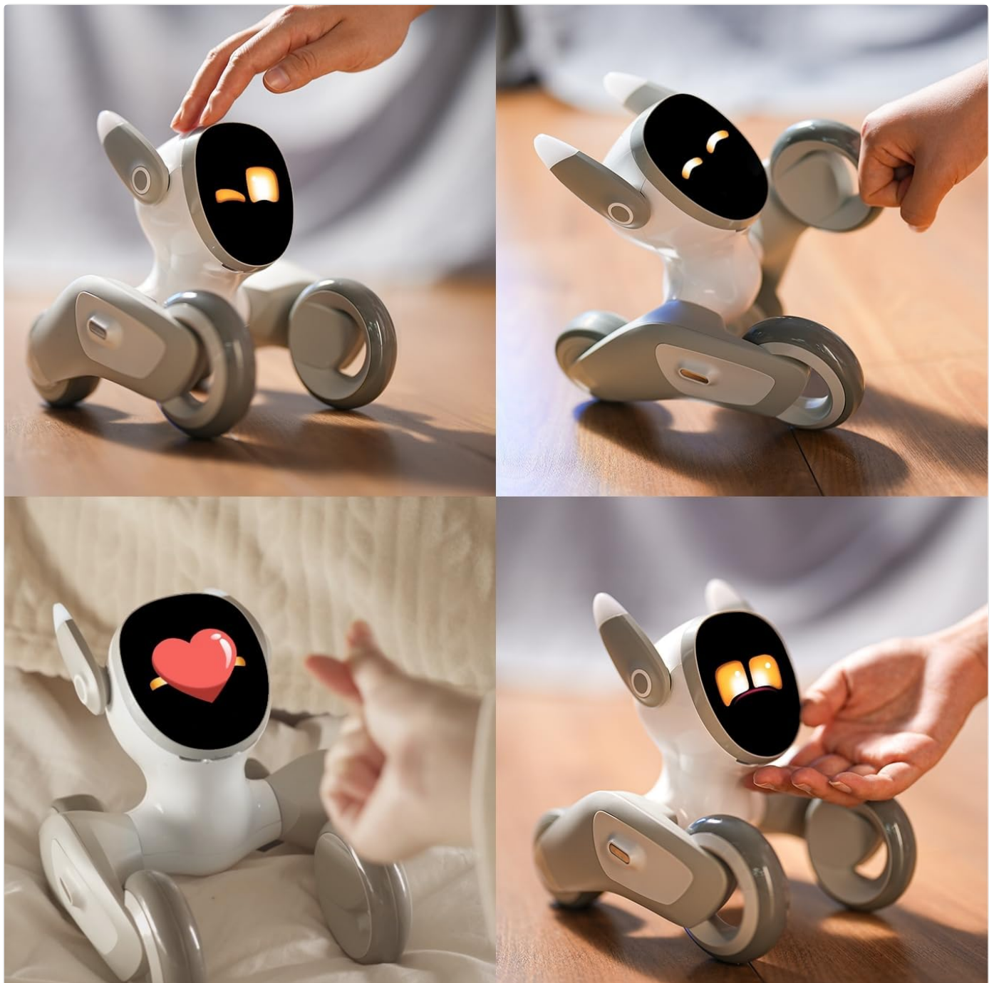
Figure 3: Loona interacting via voice commands.

For a comprehensive list of voice commands, refer to the "Home > AI & Talk > See More" section within the Loona app.