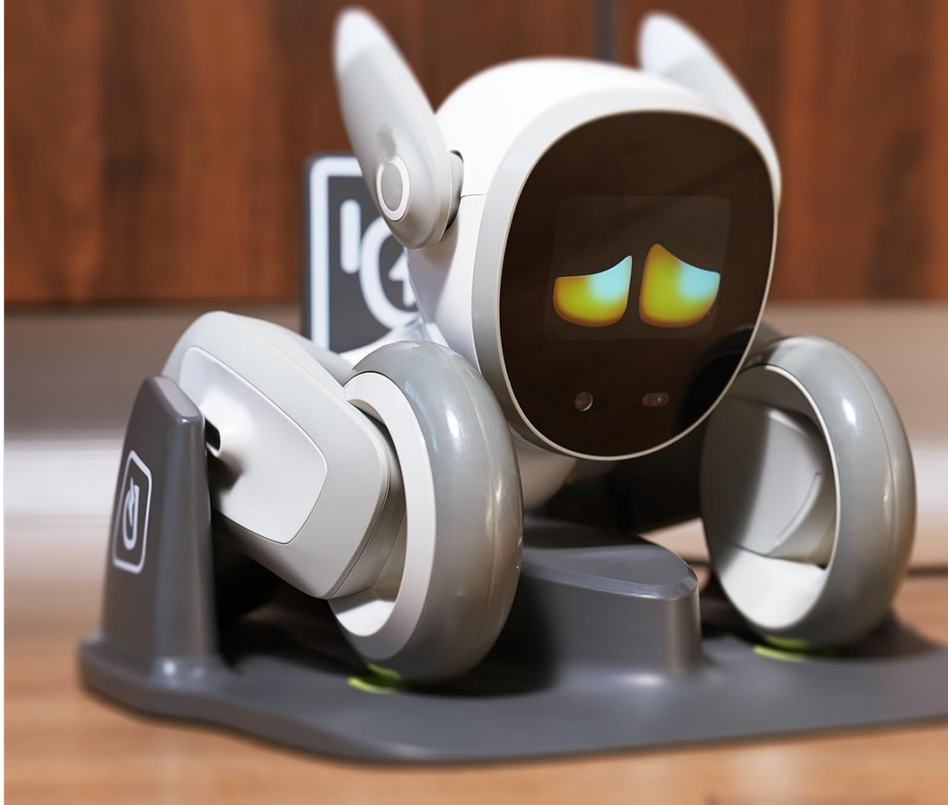
Figure 2: Loona robot positioned on its charging dock.

Loona will automatically return to its charging dock when its battery is low. A full charge typically takes approximately 2.5 hours. For optimal performance, ensure Loona's camera and ToF depth sensor surfaces are clean and that Loona operates in a well-lit environment.