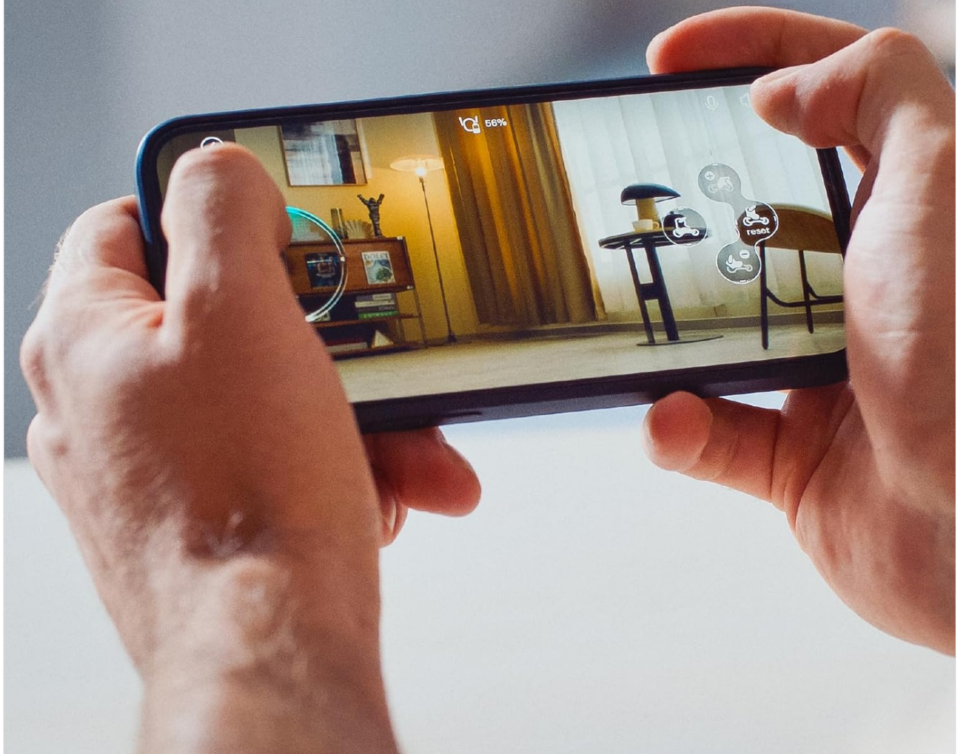
Figure 6: Remote assistance and home monitoring via the Loona app.