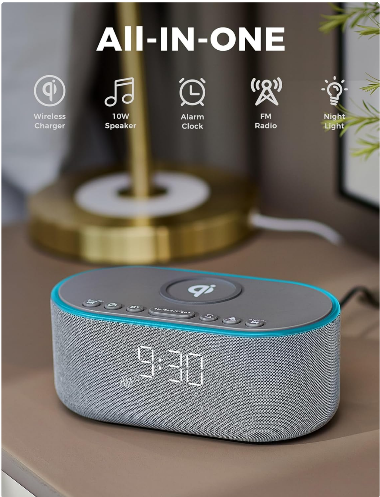
Image: The Odokee UE268 device highlighting its multiple integrated features.