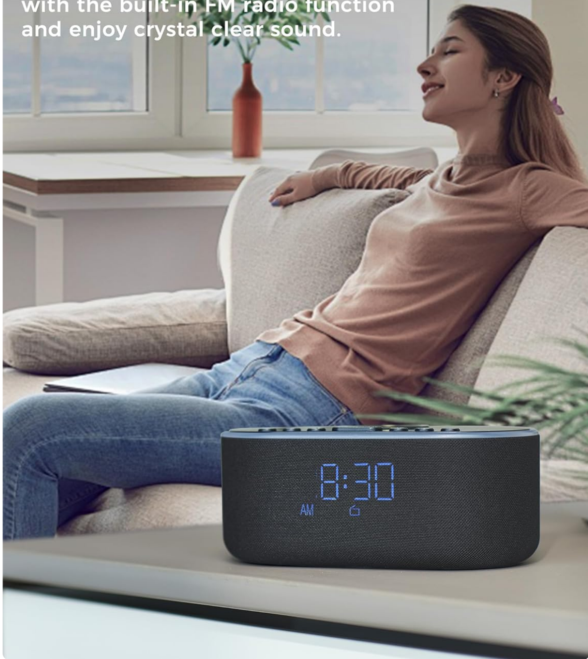
Figure 4: Enjoying FM radio with the alarm clock.

Discover your favorite stations with the built-in FM radio function and enjoy crystal clear sound.