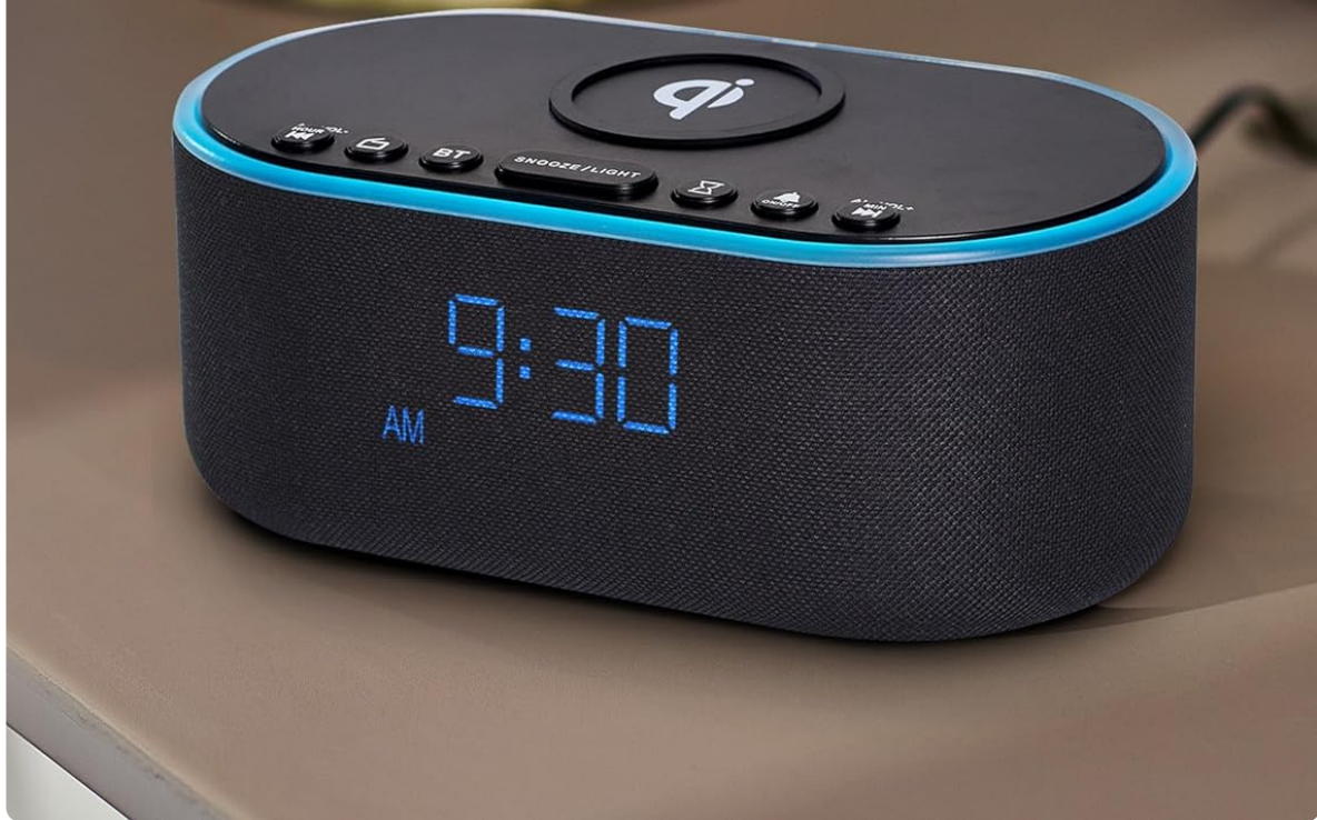
Figure 1: All-in-One Bedside Speaker - Combining essential functions for your convenience.