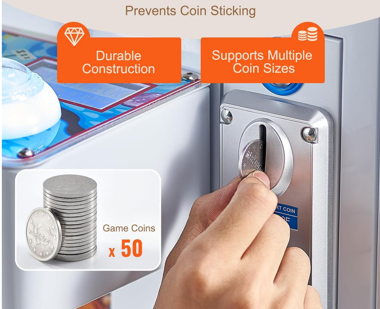
Figure 3: Inserting a game coin.