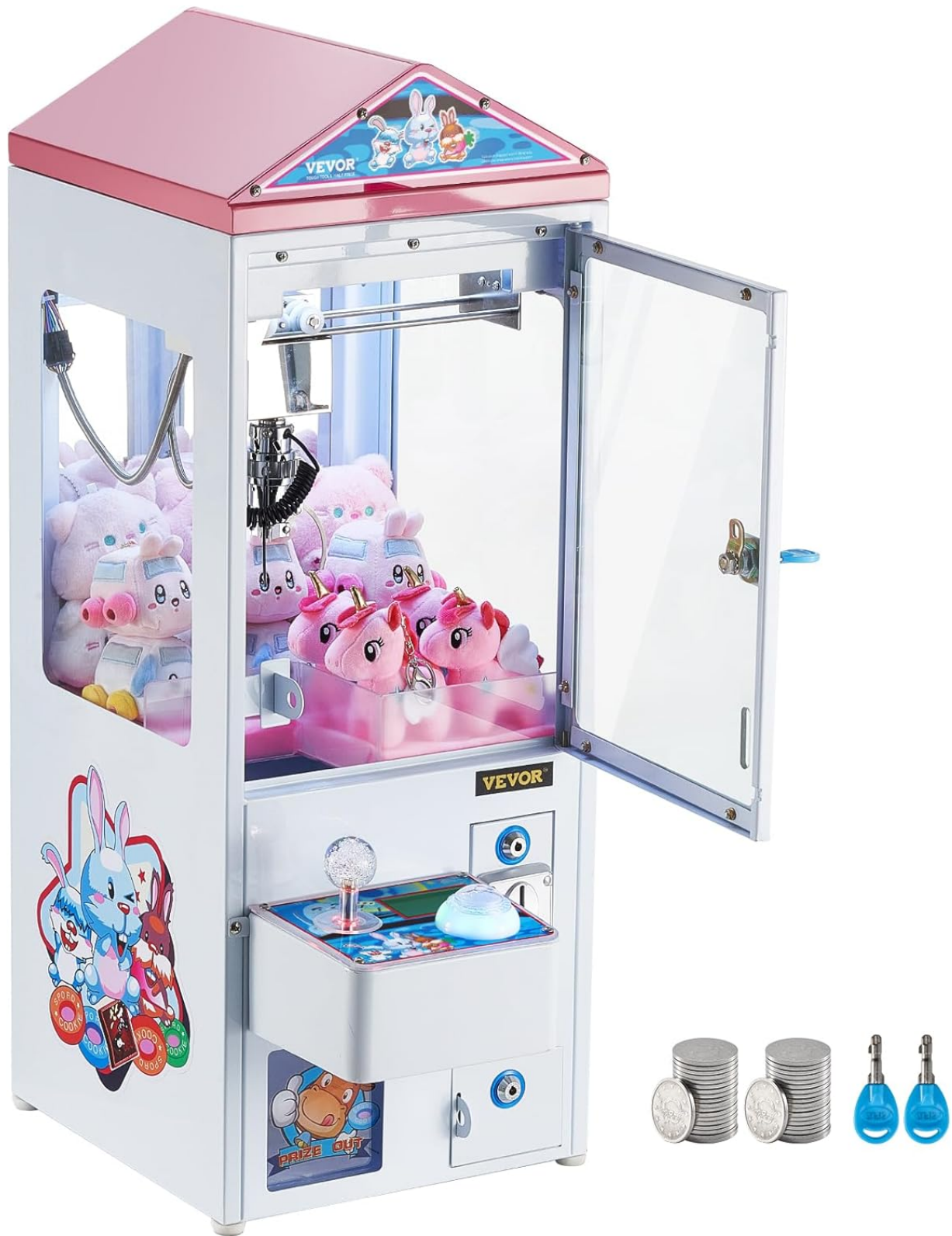
Figure 1: VEVOR Claw Machine Model S-01.