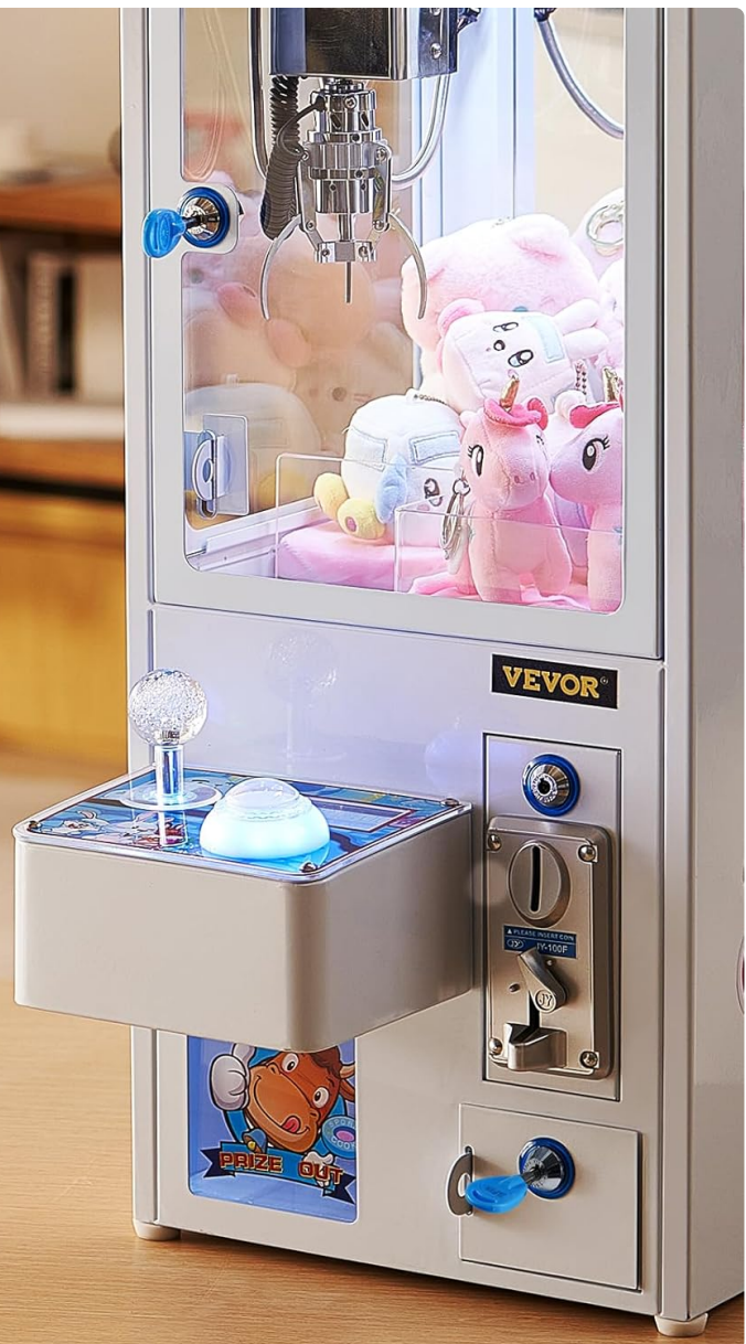
Figure 7: Column Lock Mechanism and Prize Drawer.