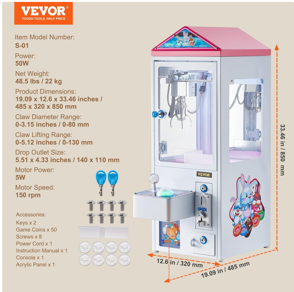
Figure 8: Product Specifications.

Detailed technical specifications for the VEVOR Claw Machine Model S-01.