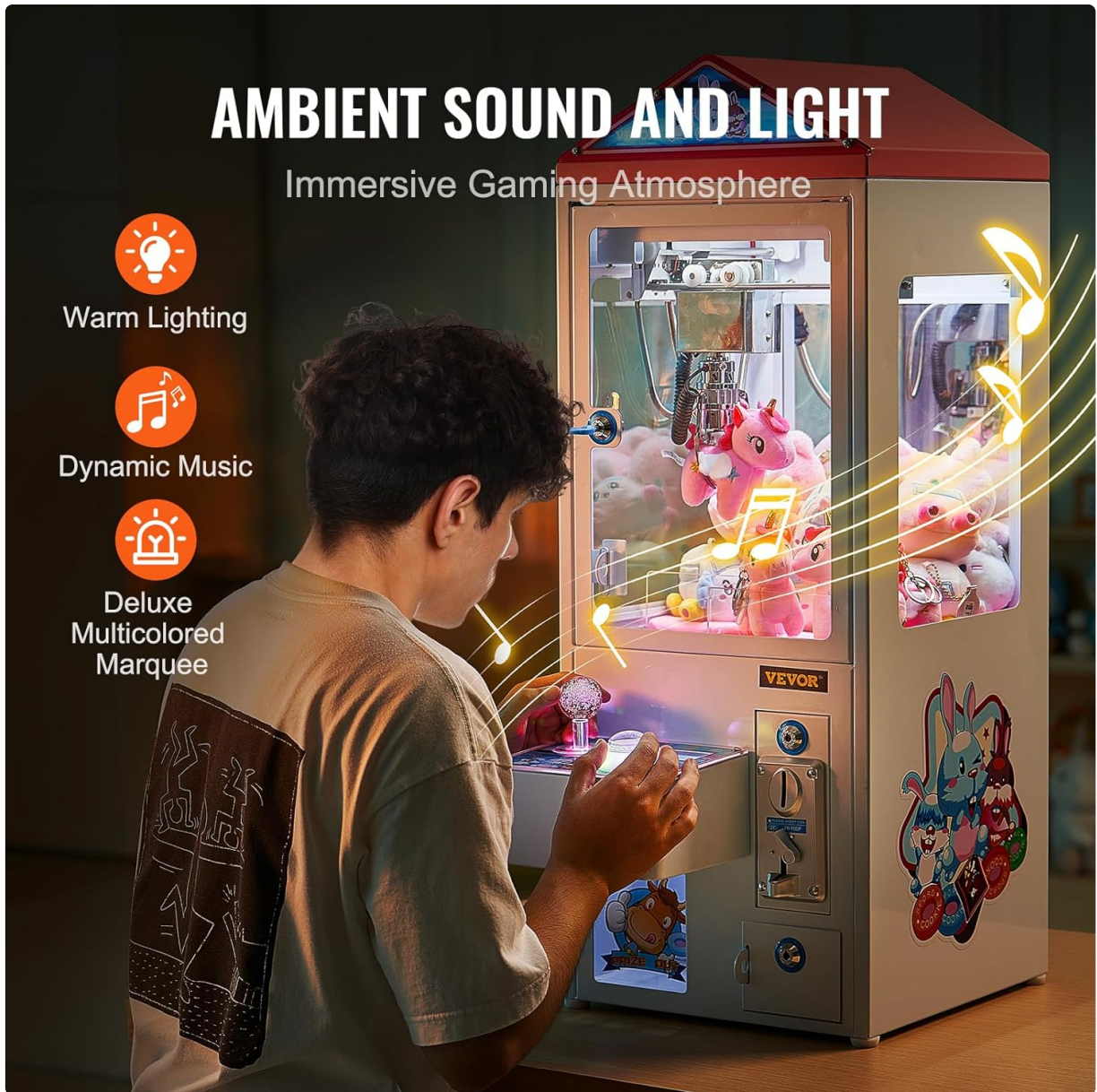
Figure 6: Ambient Sound and Light.