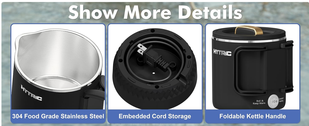
Image: The HYTRIC Travel Electric Kettle showcasing its portable and foldable design, with dimensions for both states.

Thank you for choosing the HYTRIC Travel Electric Kettle. This compact and versatile appliance is designed for convenience, allowing you to enjoy hot beverages and meals wherever you go. Its foldable design, dual power control, and safety features make it an ideal companion for travel, camping, dormitories, and offices. Please read this manual thoroughly before use to ensure safe and optimal operation.