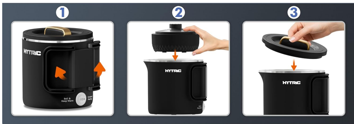
Image: The kettle's compact folded and extended dimensions are highlighted, demonstrating its travel-friendly design.