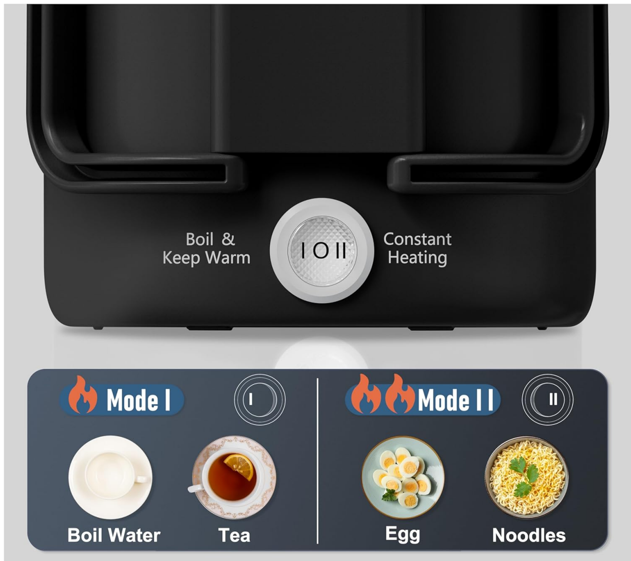
Image: A detailed view of the kettle's control panel, illustrating the two distinct heating modes and their indicators.