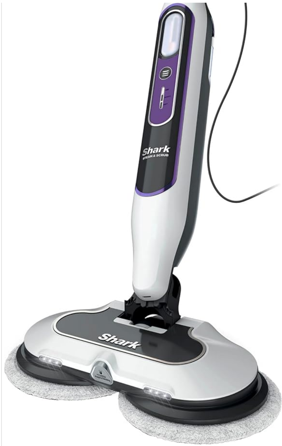
Figure 1: Shark S8201 Steam & Scrub Mop