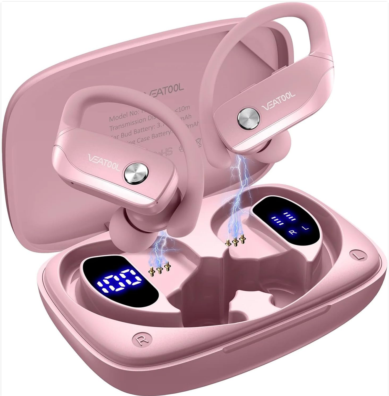
Image: VEAT00L Wireless Bluetooth Earbuds inside their charging case, illustrating the charging process with digital battery indicators on the case.

Familiarize yourself with the components of your VEAT00L earbuds and charging case.