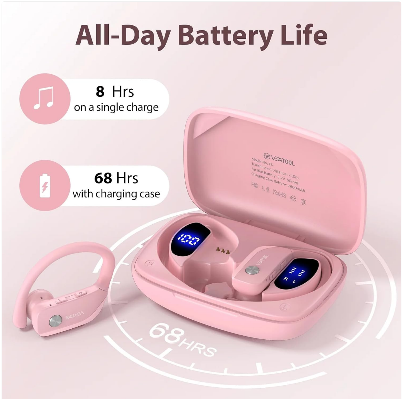
Image: Diagram showing the VEAT00L earbuds and charging case, highlighting the extended battery life of 8 hours on a single charge and 68 hours with the charging case, totaling 72 hours.

Battery Life: The earbuds provide approximately 8 hours of playback on a single charge. The charging case provides multiple additional charges, extending the total playtime to up to 72 hours.