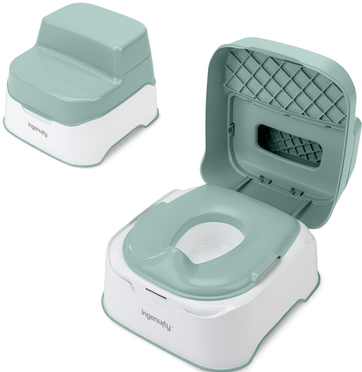
Image: The Ingenuity Prepare to Potty 3-in-1 System, illustrating its primary configurations as a potty and a step stool.