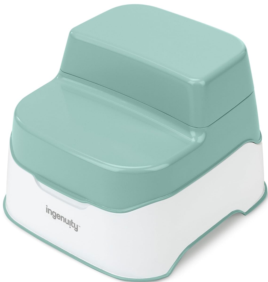
Image: The Ingenuity Prepare to Potty base transformed into a double step stool.