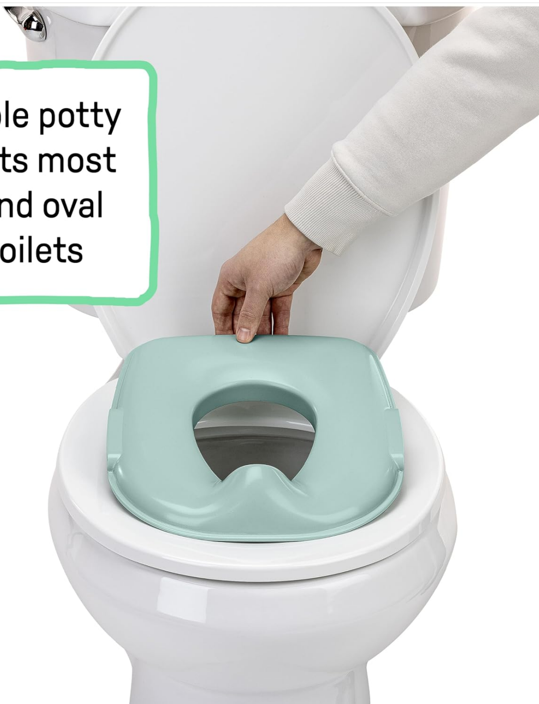
Image: The removable potty topper positioned on an adult toilet seat.

Removable potty topper fits most round and oval adult toilets