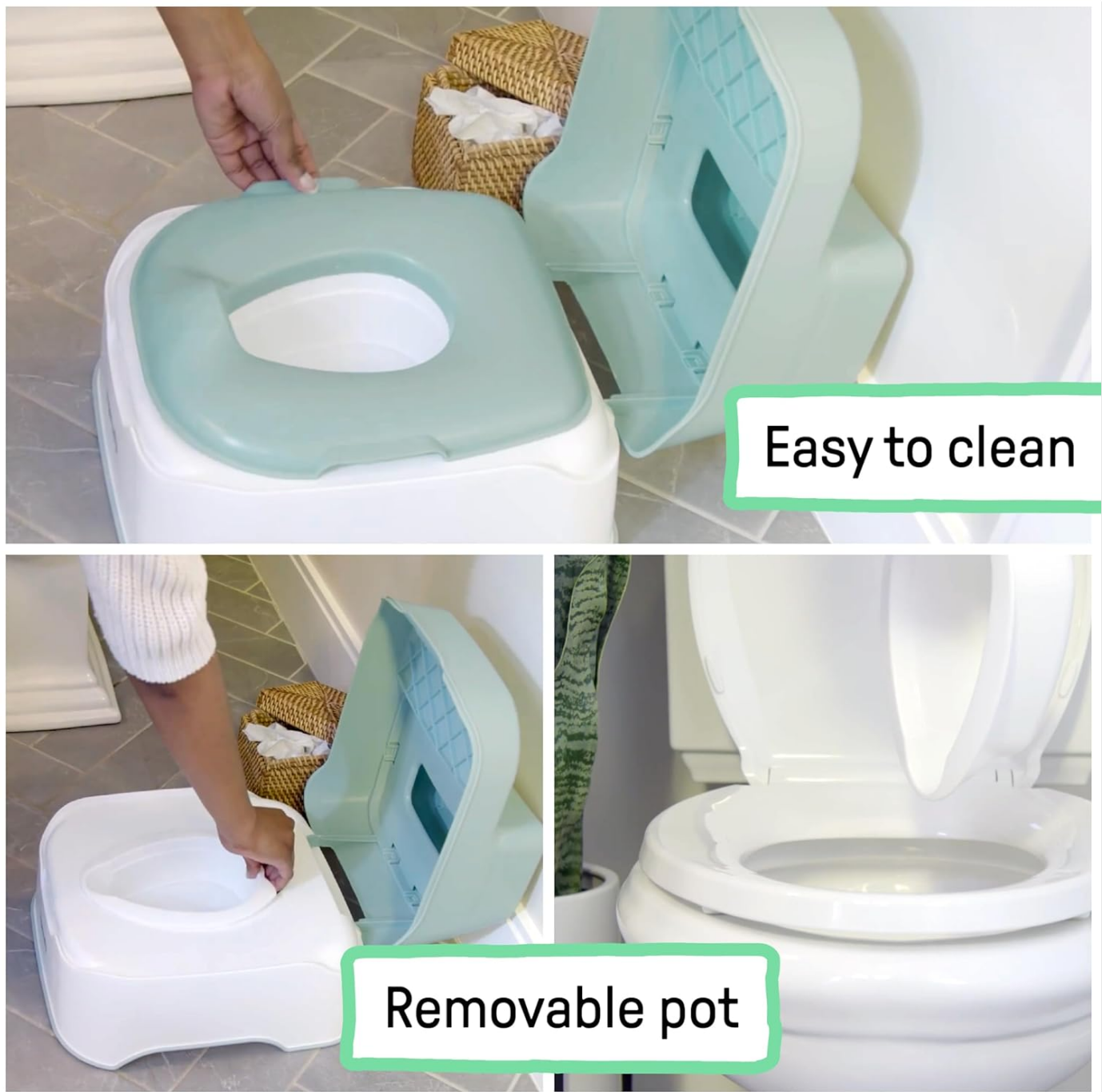
Image: Close-up view highlighting the removable pot and ease of cleaning for the potty system.