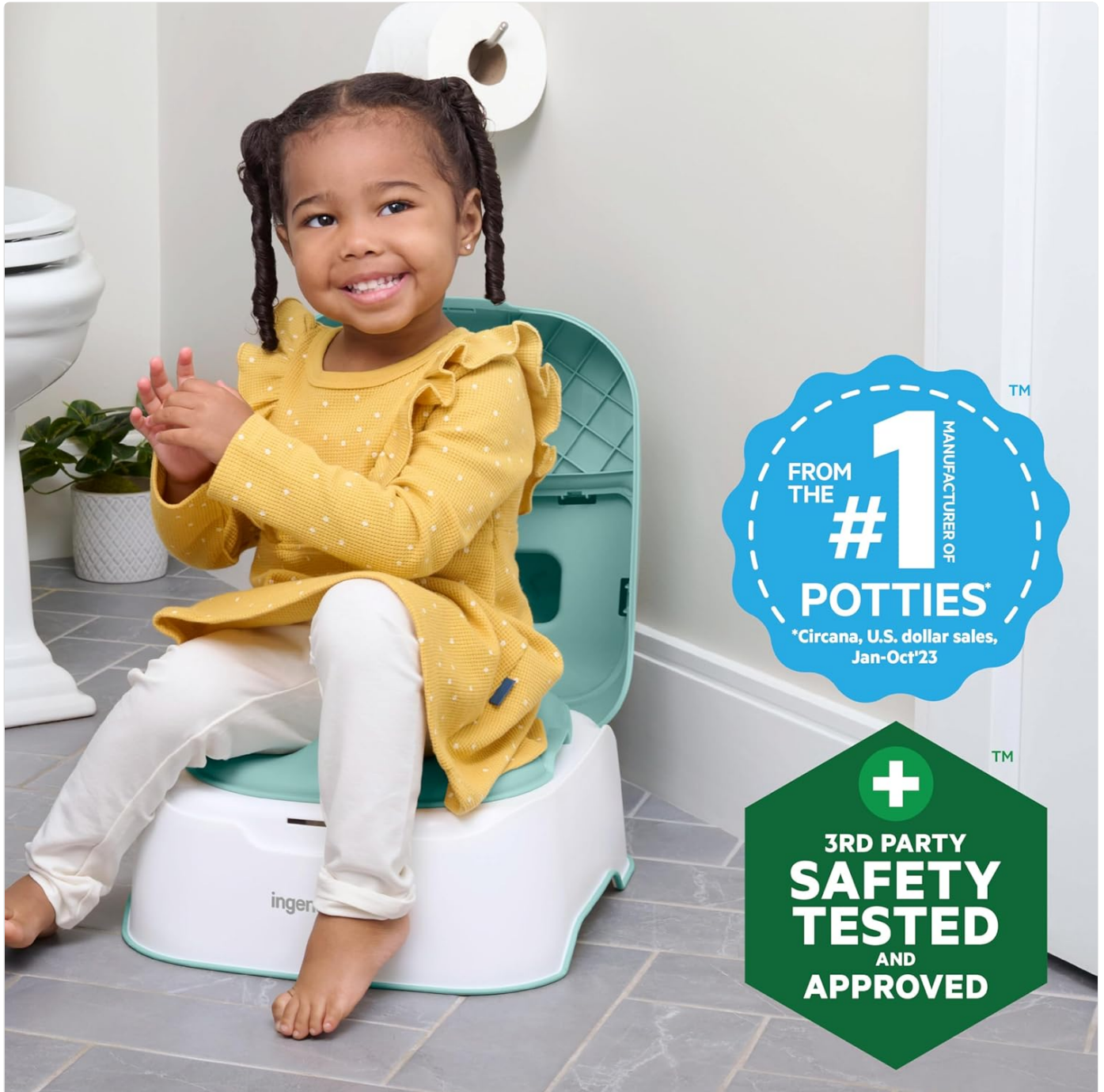
Image: A toddler using the Ingenuity Prepare to Potty in its standalone potty seat configuration.

Use the complete unit as a standalone potty. The removable pot features a pour spout for easy and hygienic cleanup.