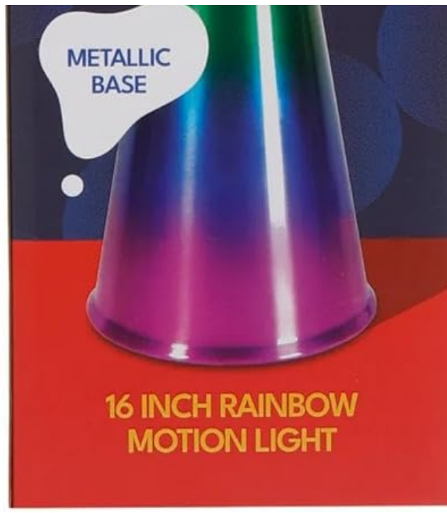
Figure 1: The InnoVibe 16" Rainbow Moody Lamp in its retail packaging, showcasing the product design and branding.