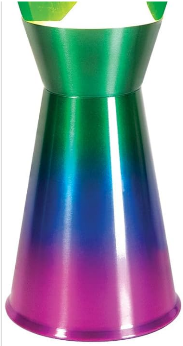
Figure 2: A detailed view of the InnoVibe Rainbow Moody Lamp, showing its metallic base and the vibrant, color-changing liquid inside.