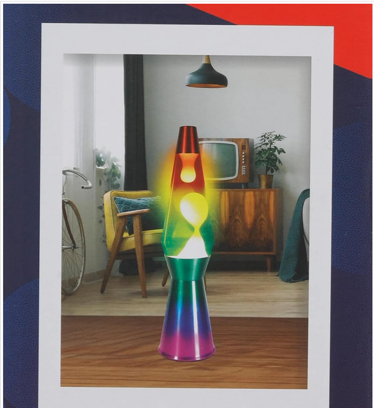
Figure 3: The InnoVibe Rainbow Moody Lamp enhancing the ambiance of a modern living space.