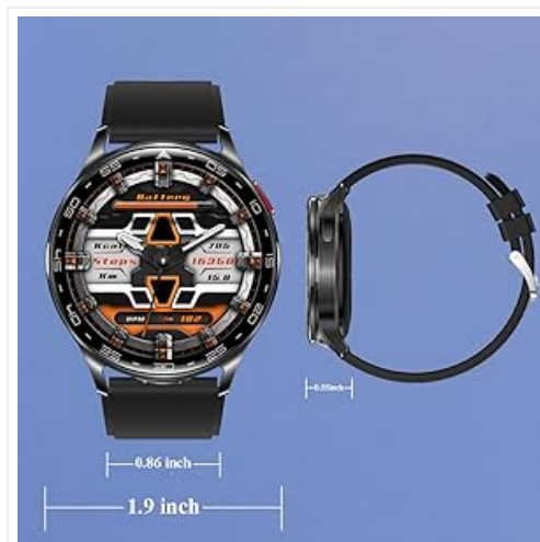
Image: The smart watch displaying a sports tracking interface, with icons representing over 100 different sports activities.

The watch supports over 100 sports modes, allowing you to track specific activities. It records distance, speed, and time for your workouts.