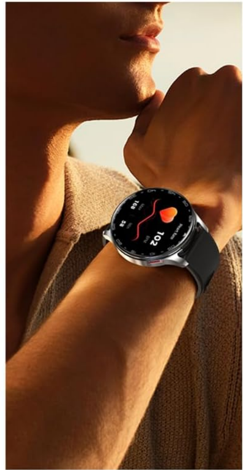
Image: A close-up of the smart watch face, showing a digital display with various data points and a customizable background.