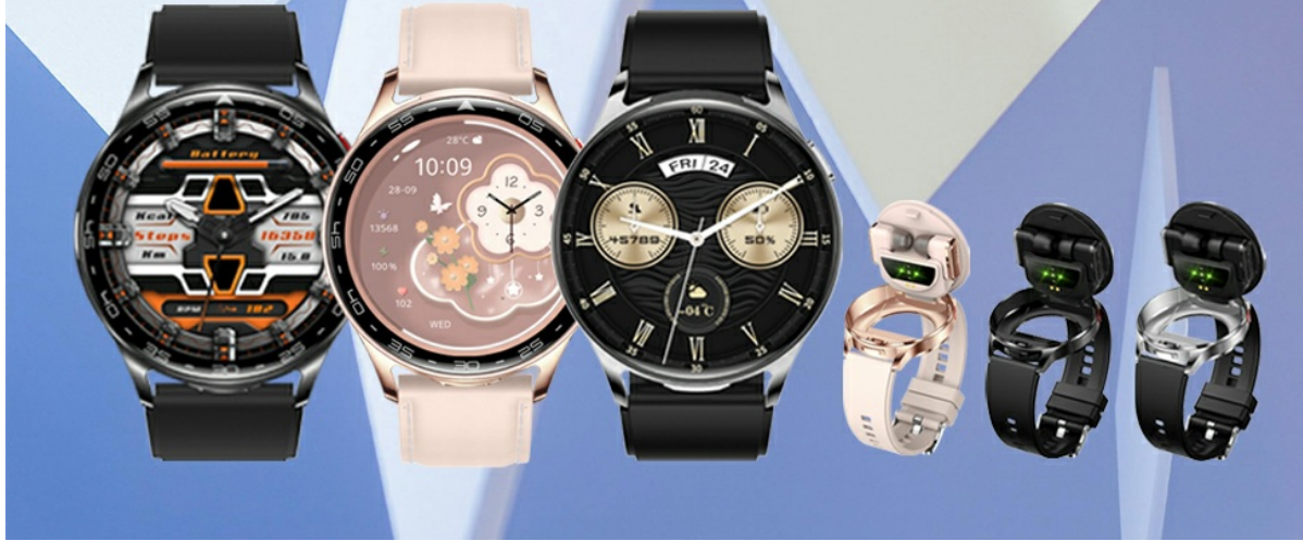
Image: The Alliget Smart Watch with Earbuds, showcasing both the pink and black color variants. The earbuds are stored within the watch casing.