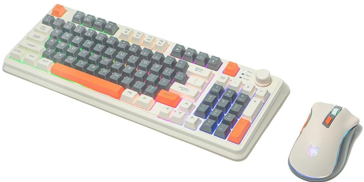
Image 1.1: The XUNFOX RGB 94-Key Keyboard and Mouse Combo, featuring a cream-colored keyboard with RGB backlighting and a matching mouse.

This manual provides instructions for the XUNFOX RGB 94-Key Keyboard and Mouse Combo. This product is designed for both work and gaming, offering a customizable RGB backlight keyboard with a volume control knob and a mouse with adjustable DPI and additional buttons. Please read this manual thoroughly before use to ensure proper operation and maintenance.