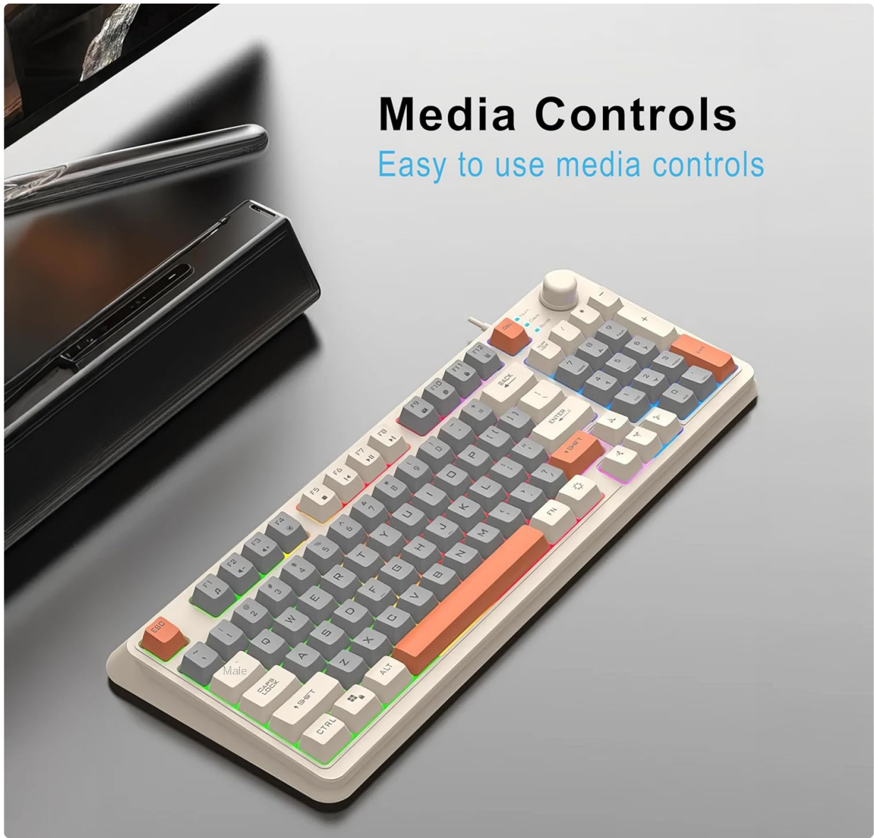
Image 4.3: The keyboard layout highlighting the media control functions integrated into the F-keys.

Stable Keycap Structure: The keycaps are designed with an embedded structure to ensure stability and prevent accidental detachment during use.