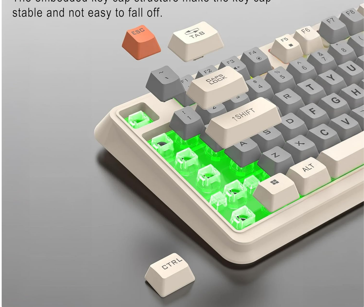
Image 4.4: An exploded view of a keycap, demonstrating the embedded structure that provides stability.

The embedded key cap structure make the key cap stable and not easy to fall off.